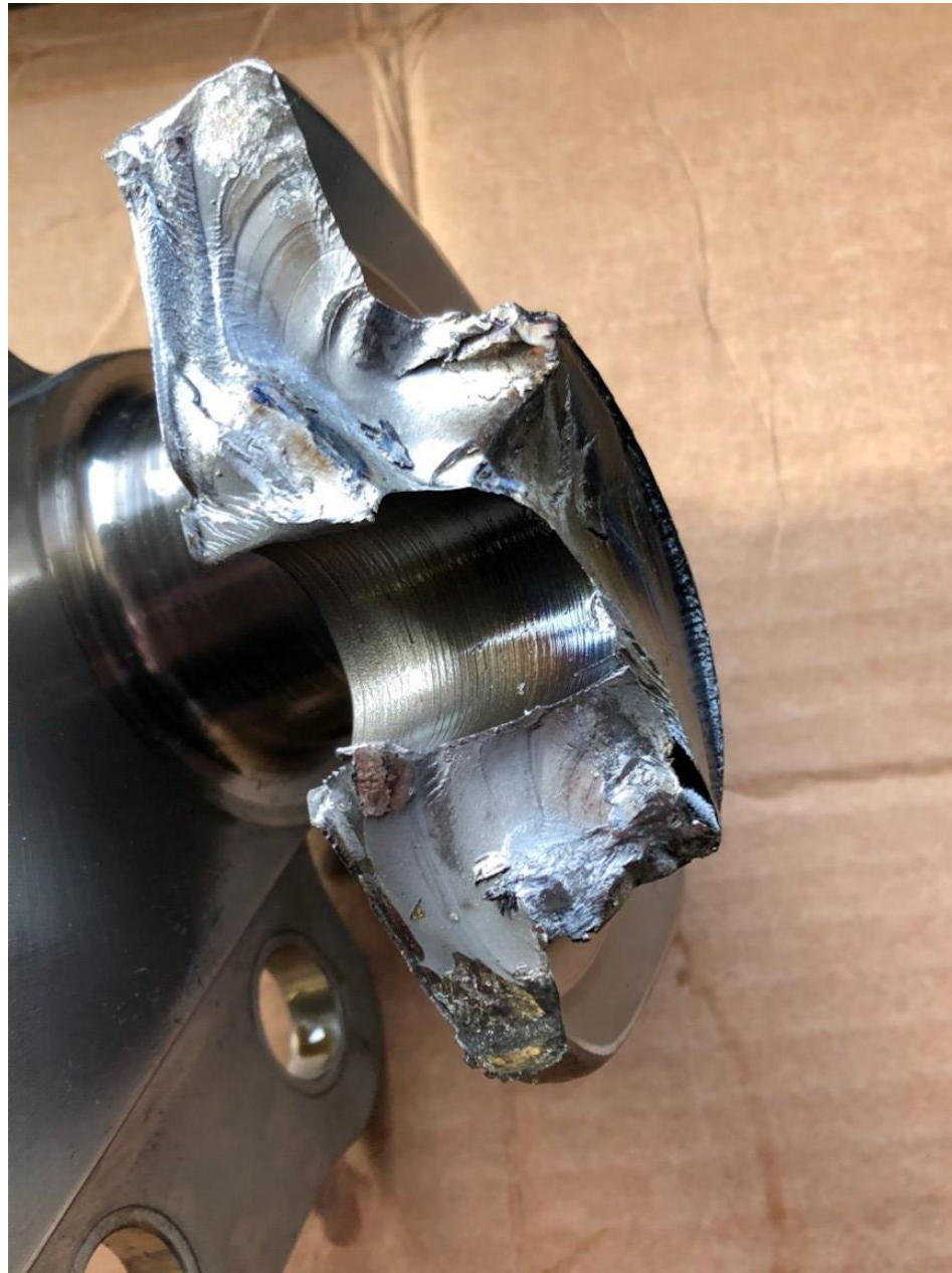
Photo 6 – Damaged crankshaft piece #1