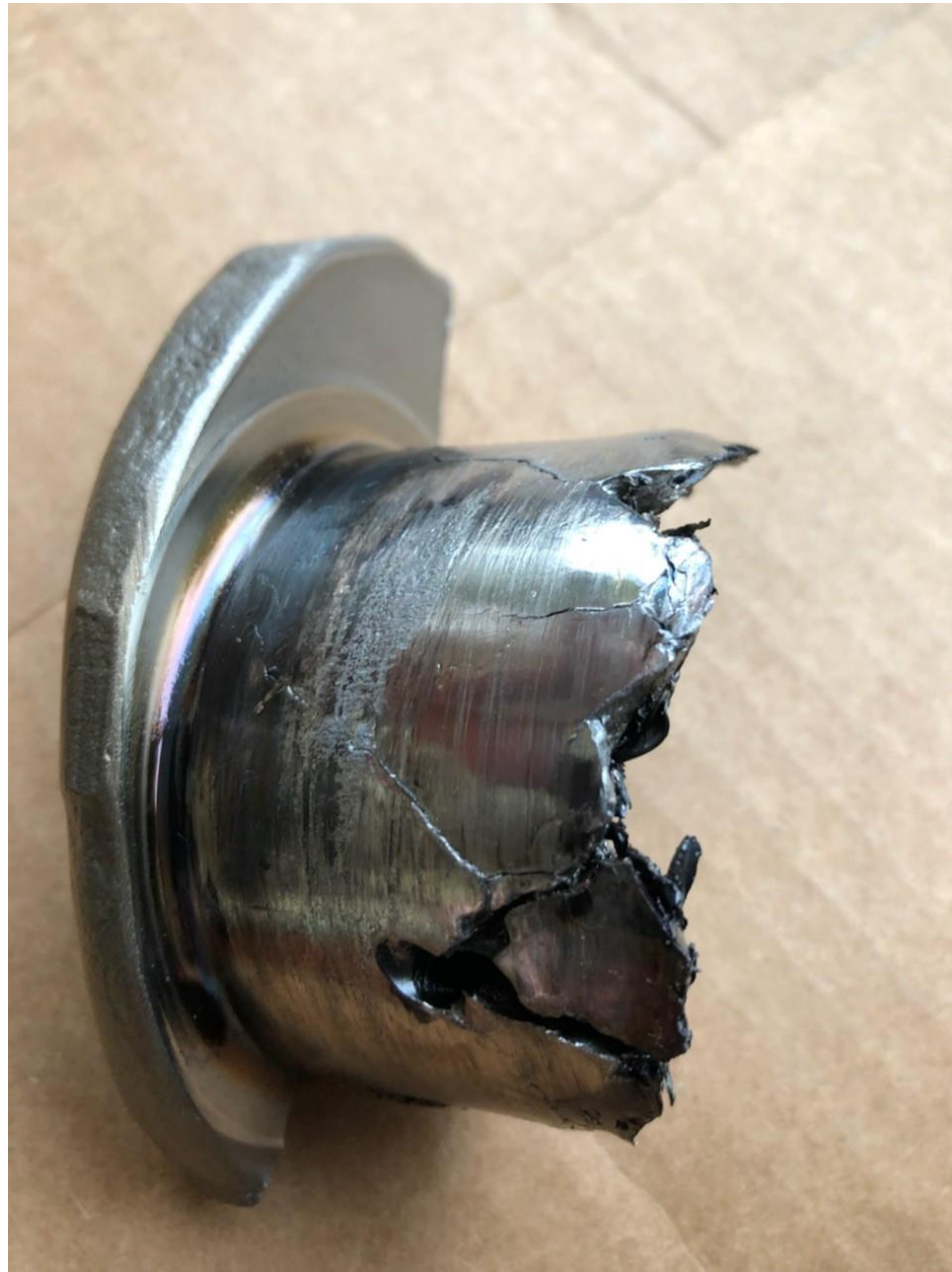
Photo 8 – Damaged crankshaft piece #3