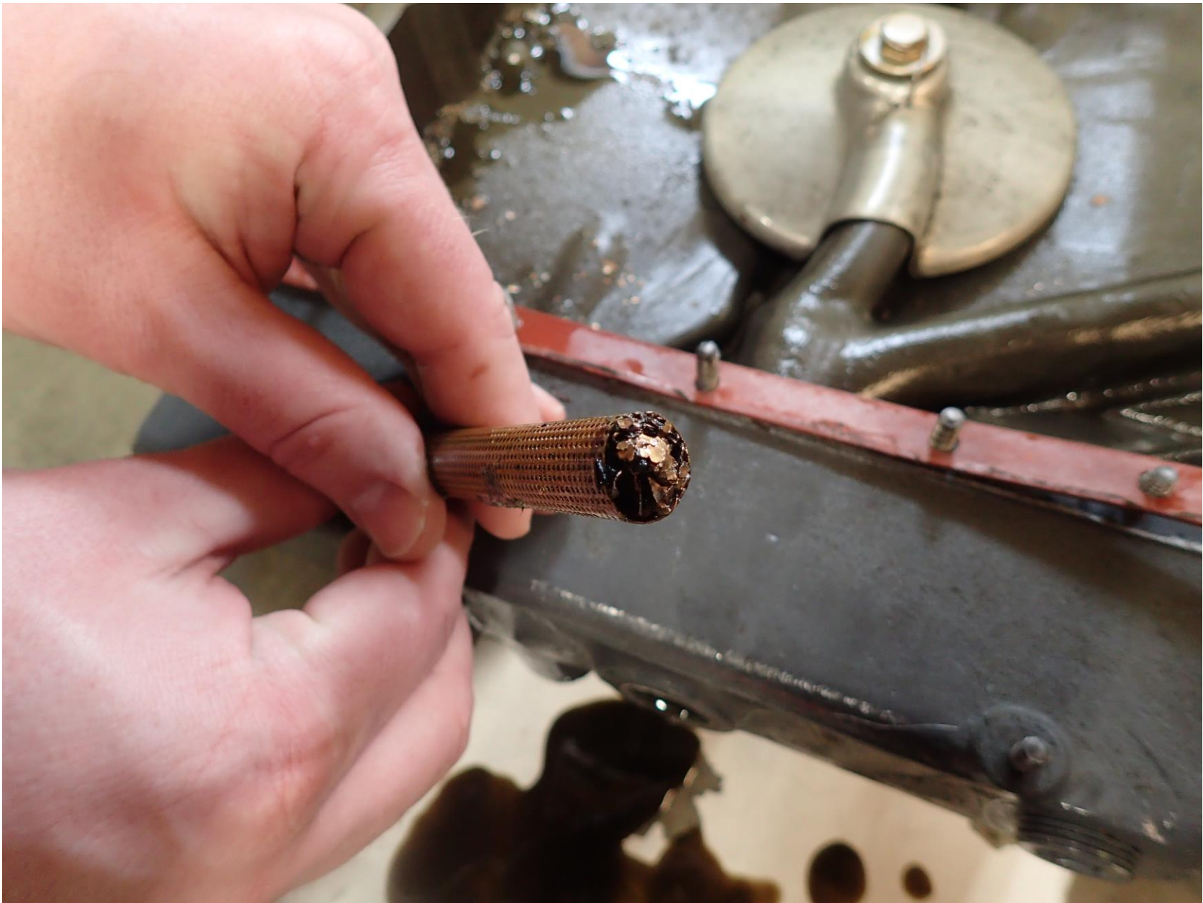
Photo 3 – Metal shavings in oil filter