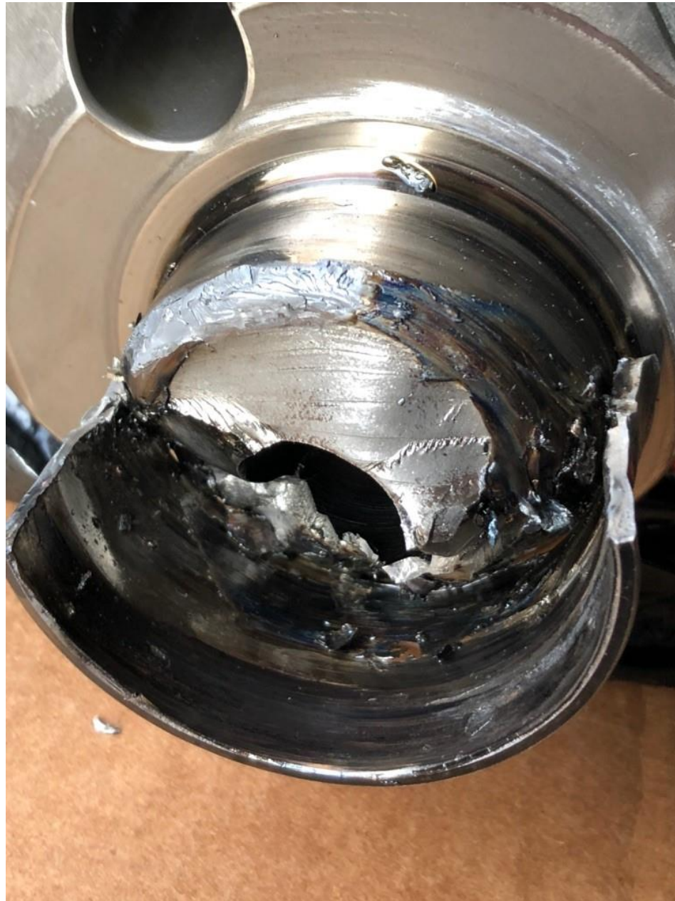
Photo 7 – Damaged crankshaft piece #2