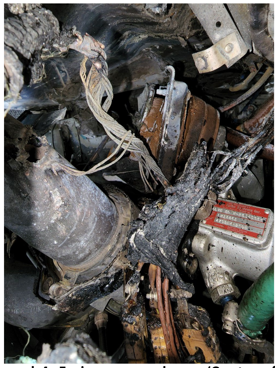
Photograph 4 - Engine accessory damage