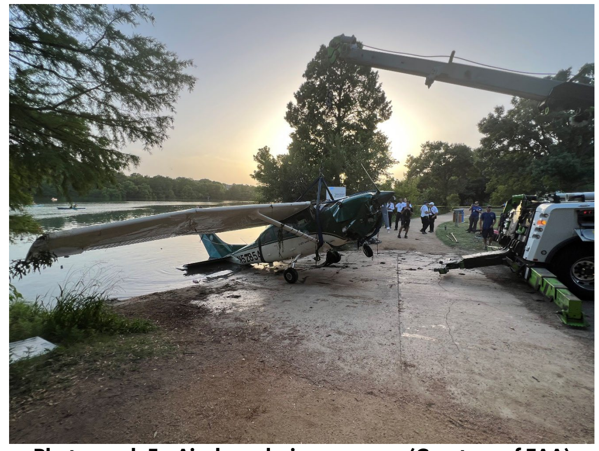
Photograph 5 - Airplane during recovery