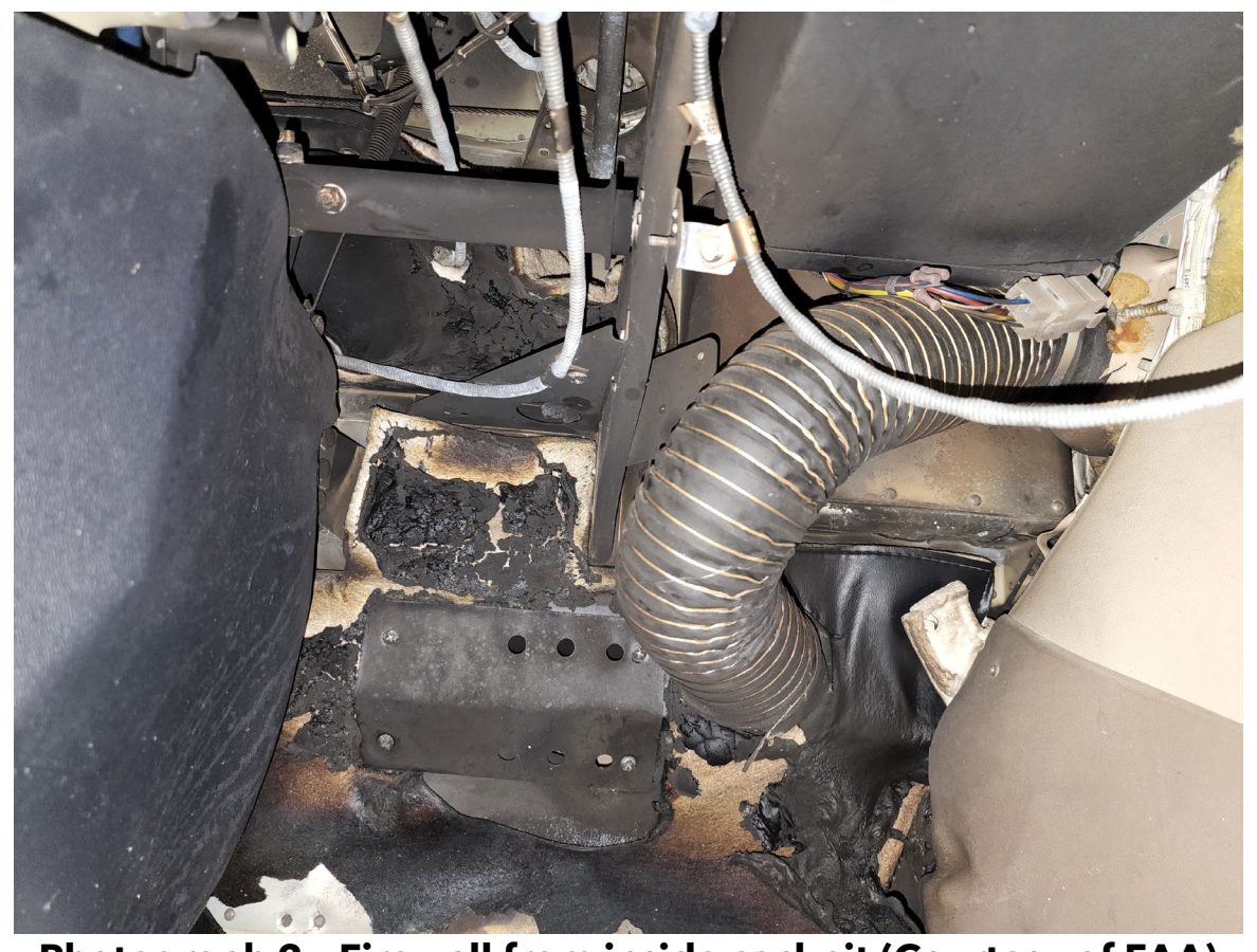
Photograph 2 - Firewall from inside cockpit