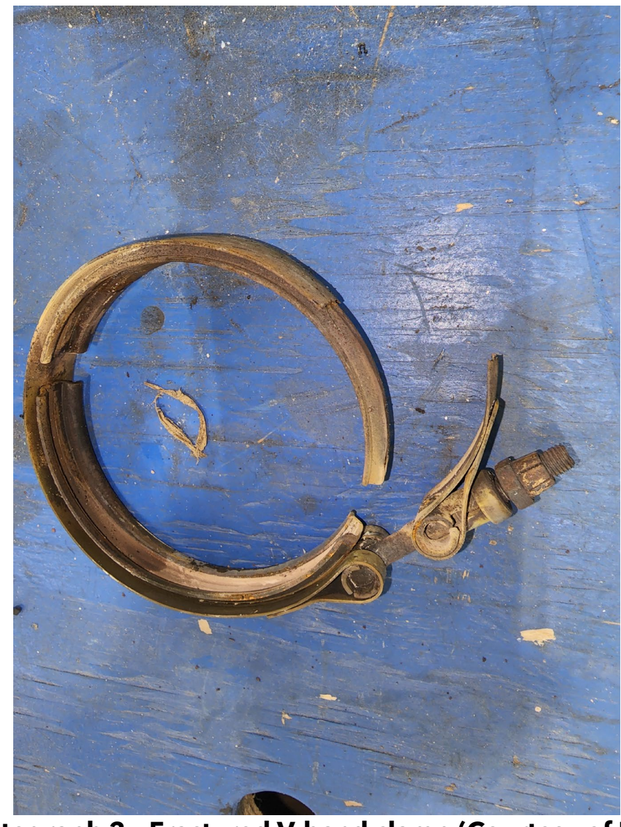
Photograph 3 - Fractured V-band clamp