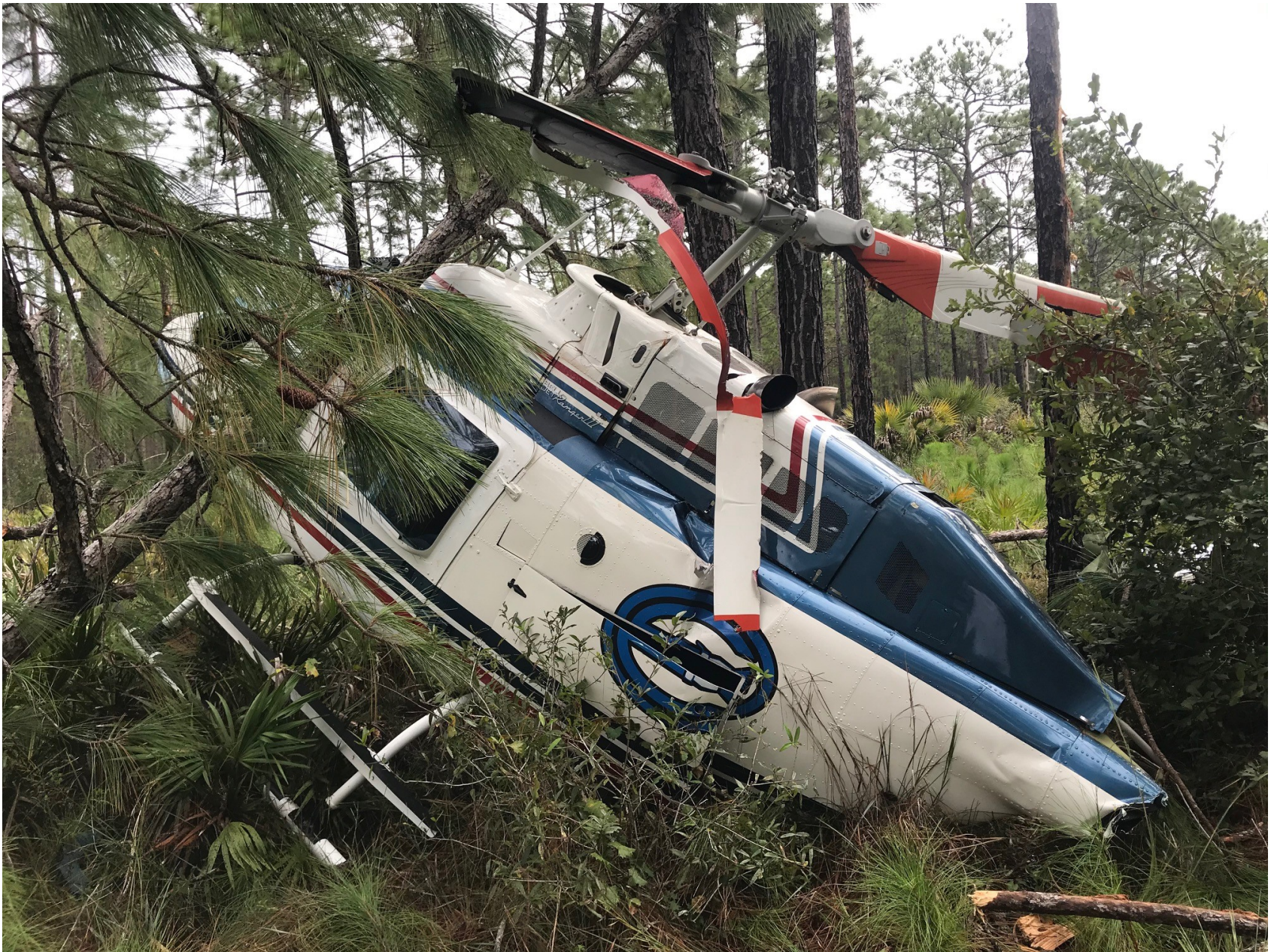
Photo 2 – Left side view of the helicopter.