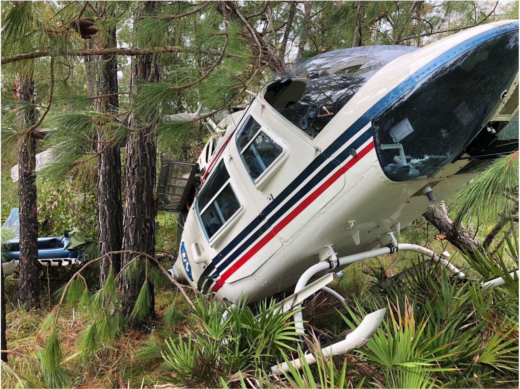
Photo 1 – Right side view of the helicopter.