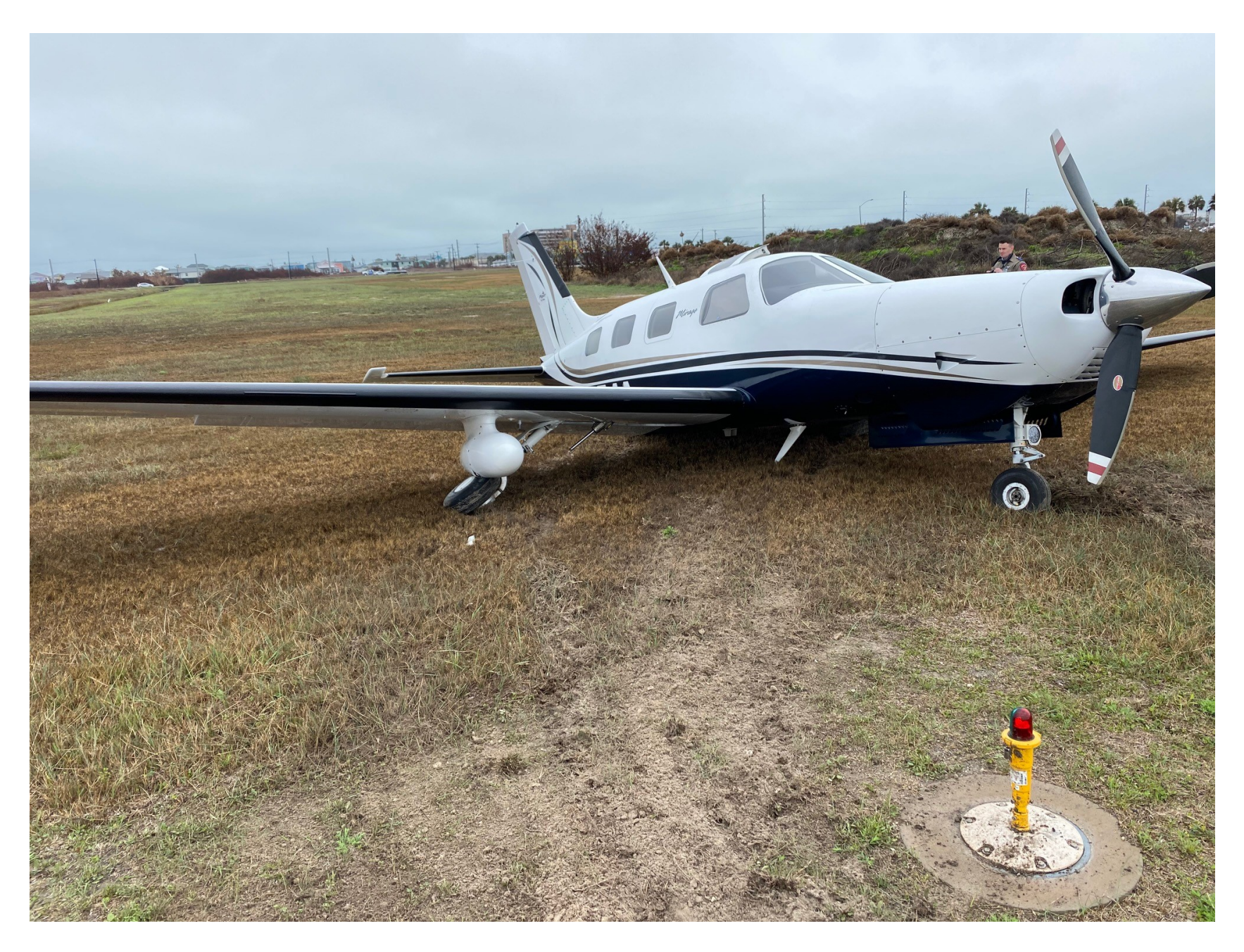
Photo 1 – Photograph of Airplane Sitting in Grass with Collapsed Right Gear