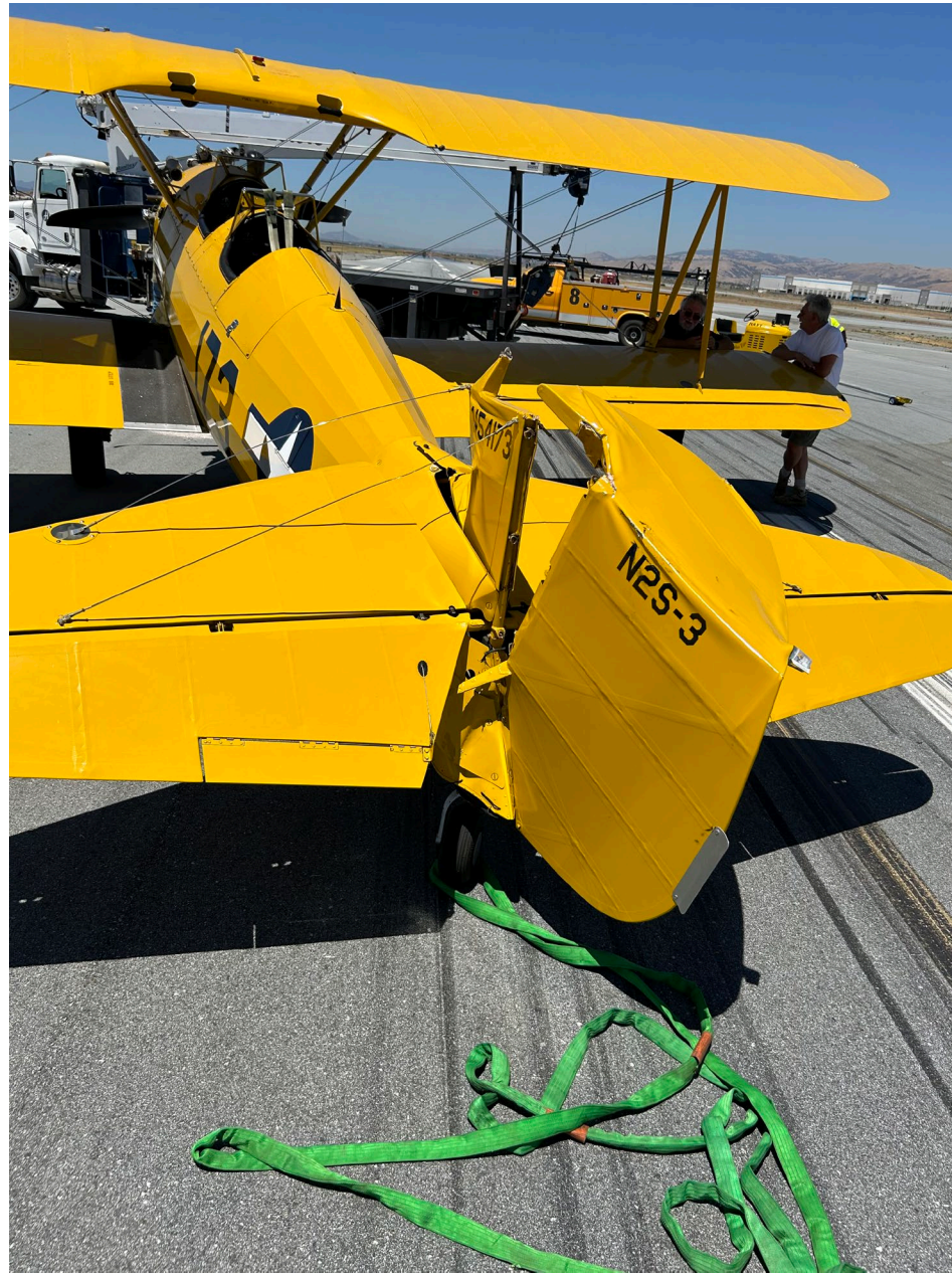
Photo 3 – Rear view of the substantially damaged empennage. Photo pilot.