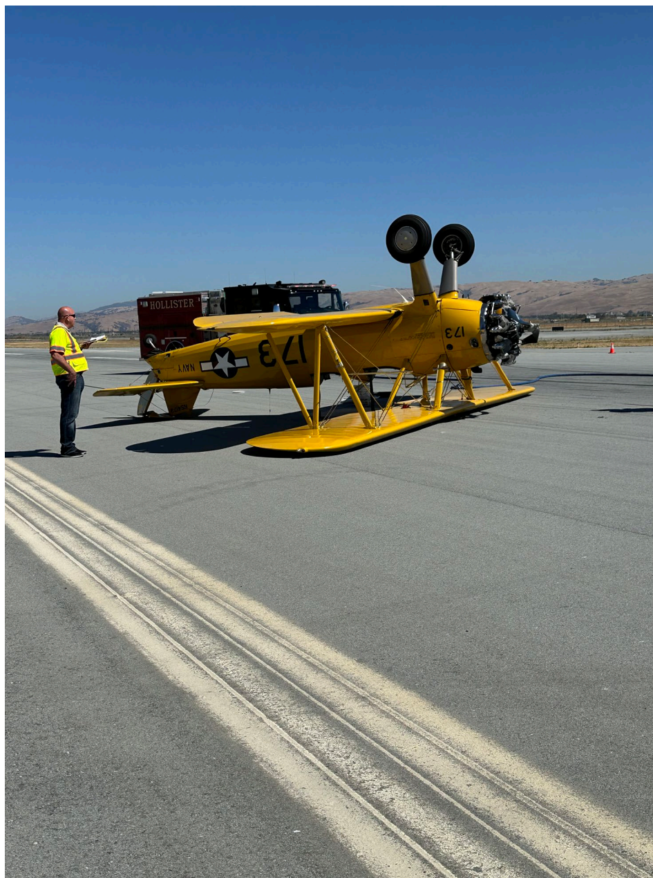
Photo 1 –N54173, at the accident site.