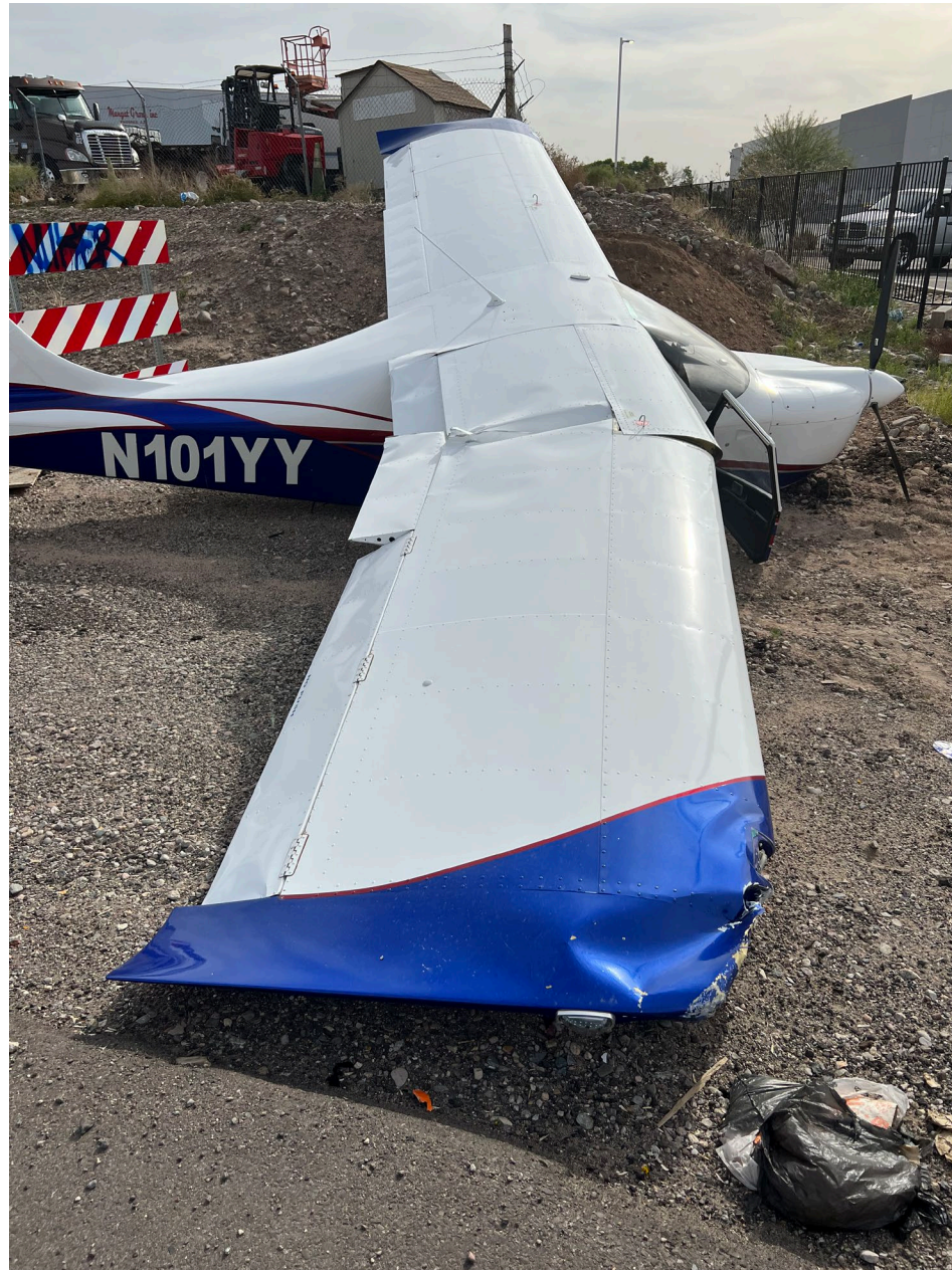
Photo 1 –N101YY, showing damage to the right wing.