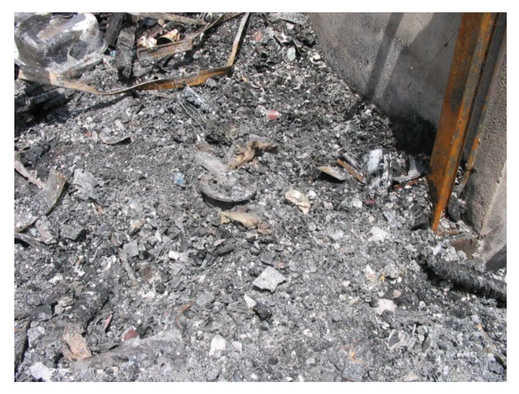
Photo 7 – Photo showing the left main landing gear and ash from the left wing.