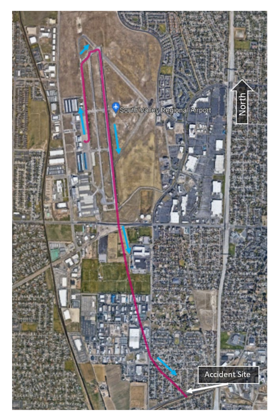
Photo 8 – Image showing the GPS flight path. The blue arrows point to the direction of travel.