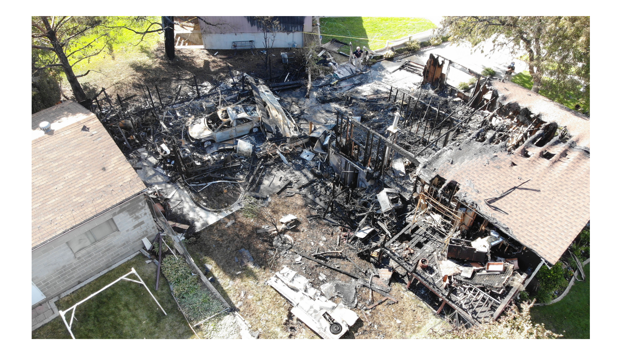
Photo 6 – Overhead view showing the two fire damaged houses and detached garage, along with the right wing.