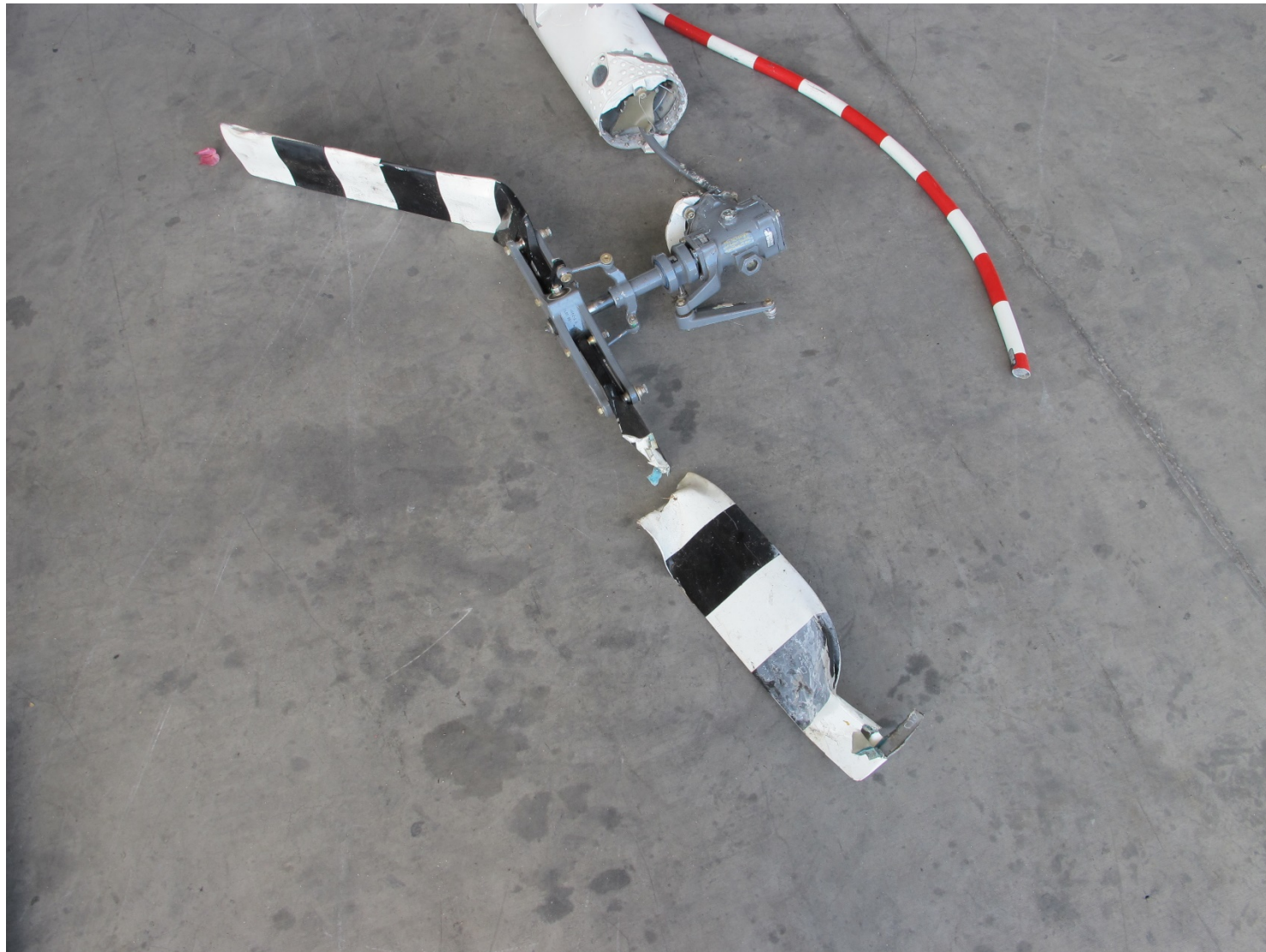
Photo 11. 90-degree Gearbox and Tail Rotor Assembly