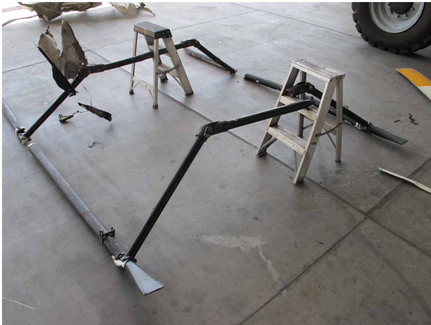
Photo 10. Landing Skids