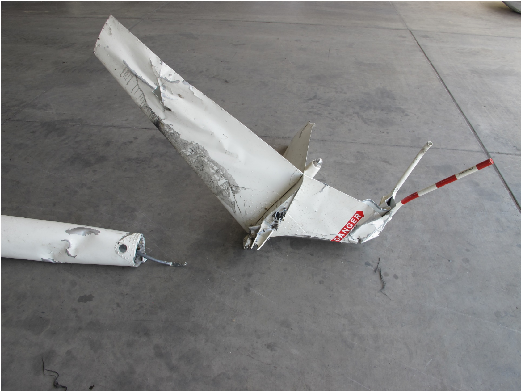
Photo 8 - Empennage