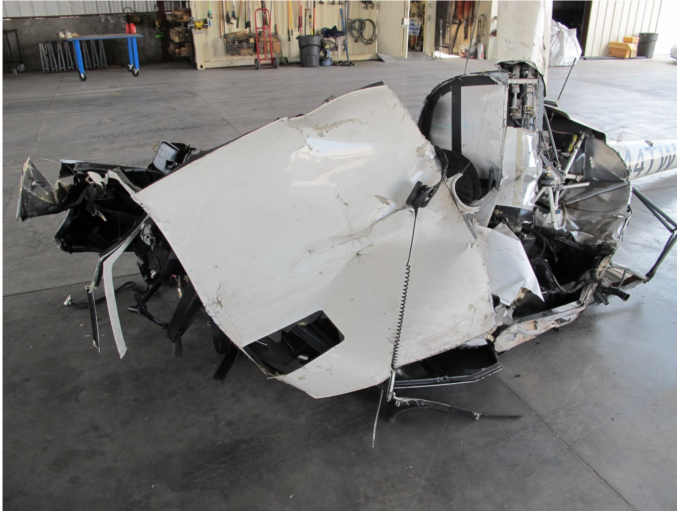
Photo 5. Left-Front View