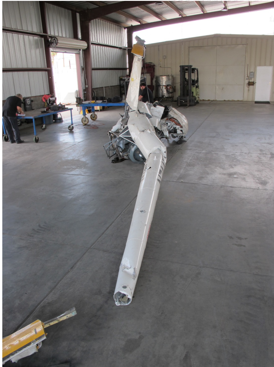
Photo 3. Rear View