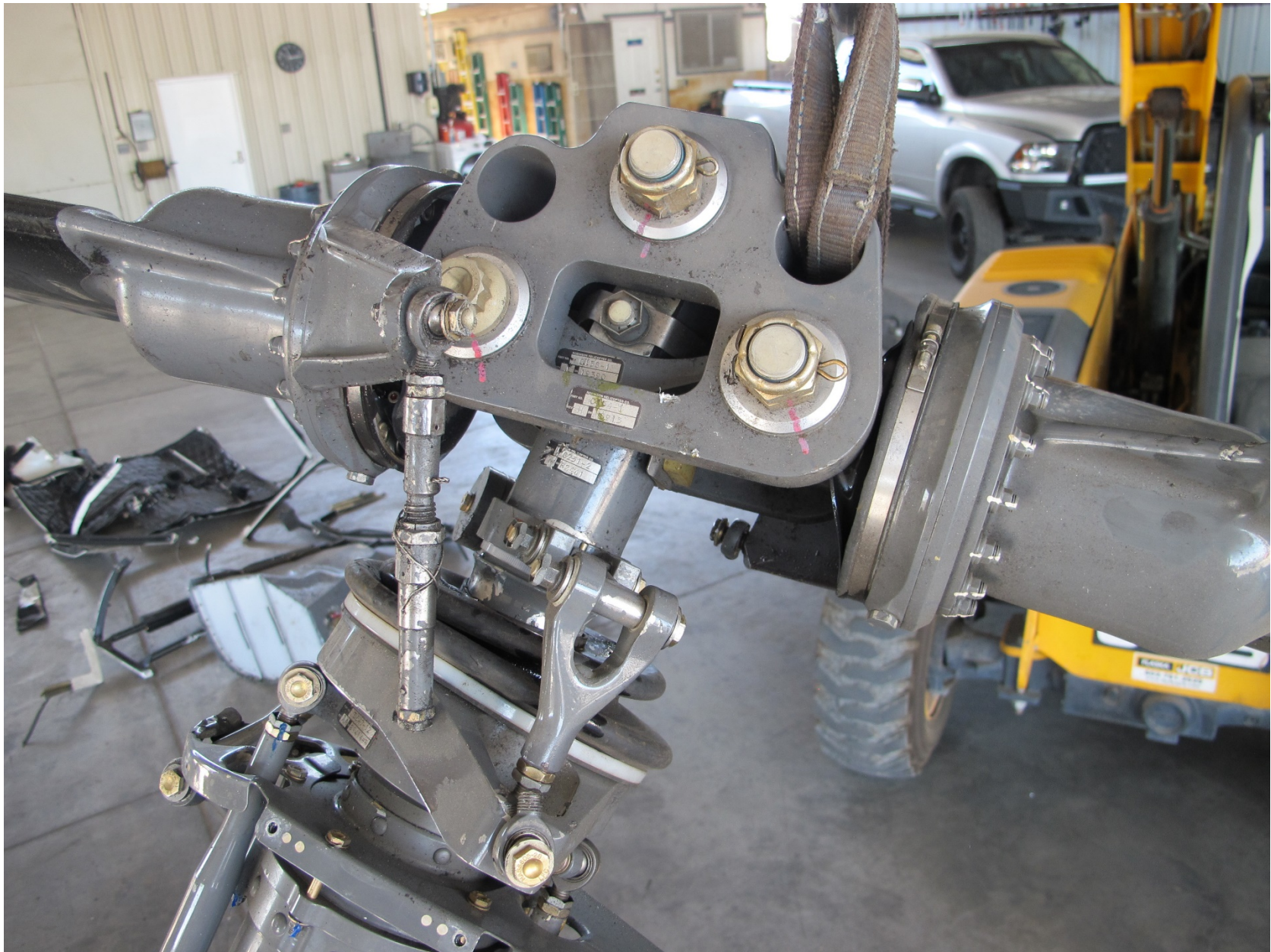
Photo 7. Opposite Side of the Main Rotor Head