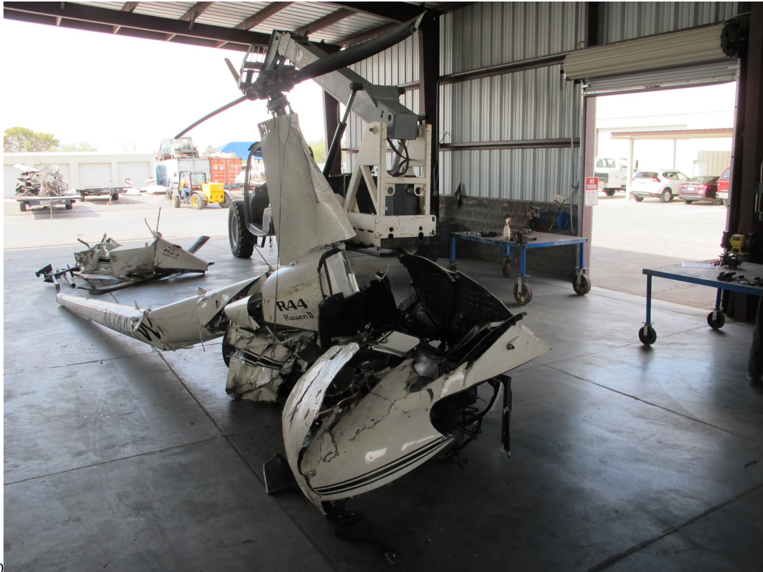
Photo 1. N744TW, Right-Front View