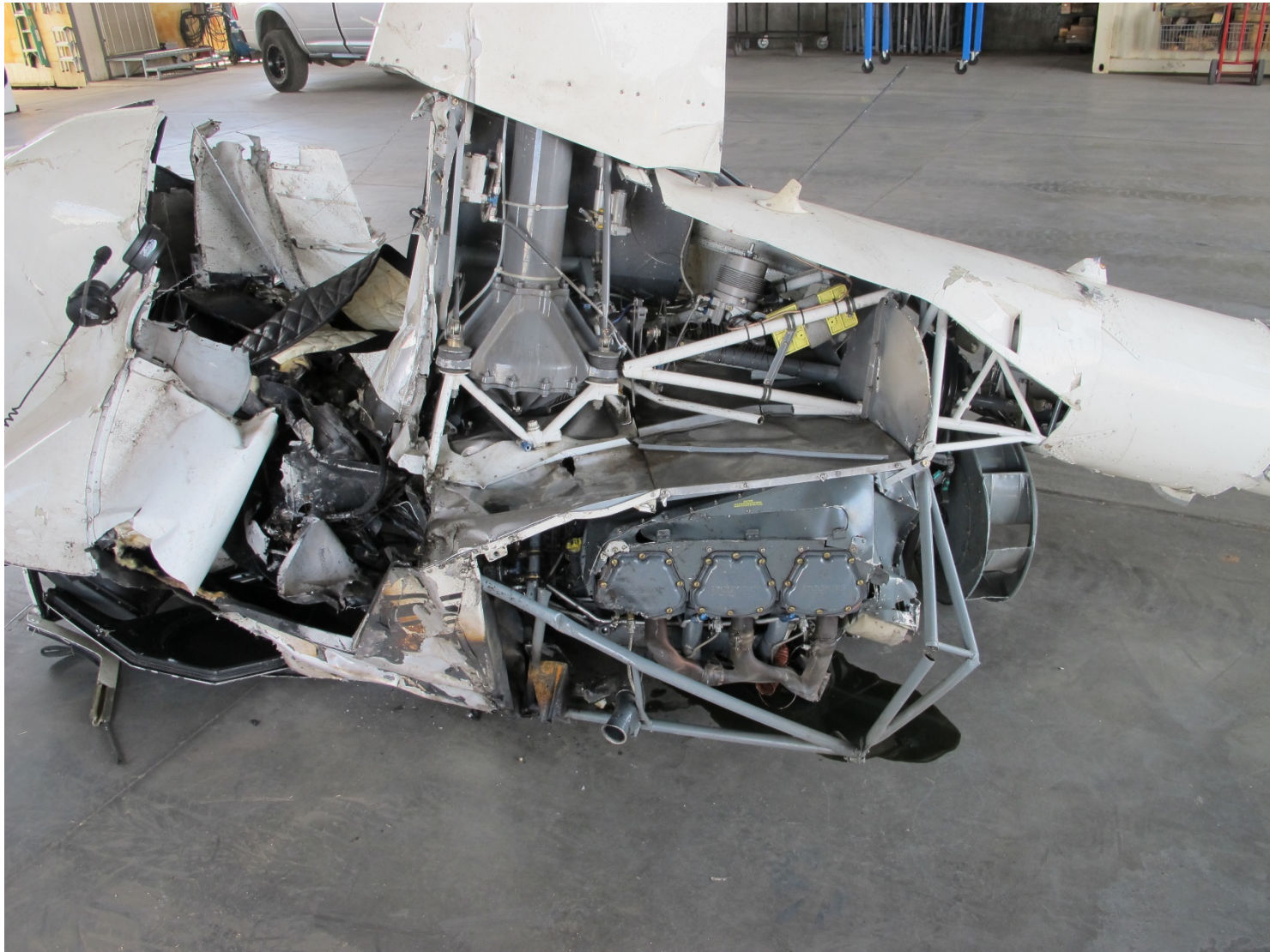
Photo 4. Left-Side View