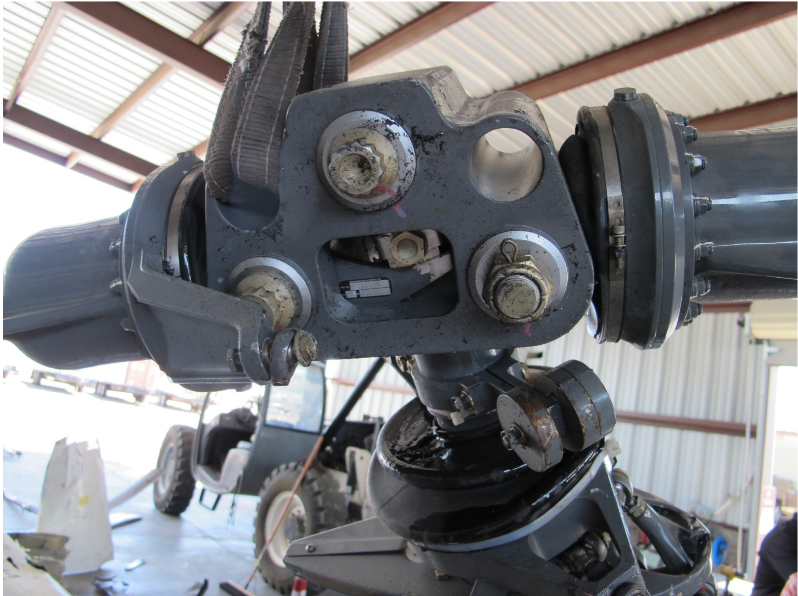
Photo 6. View of the Main Rotor Head