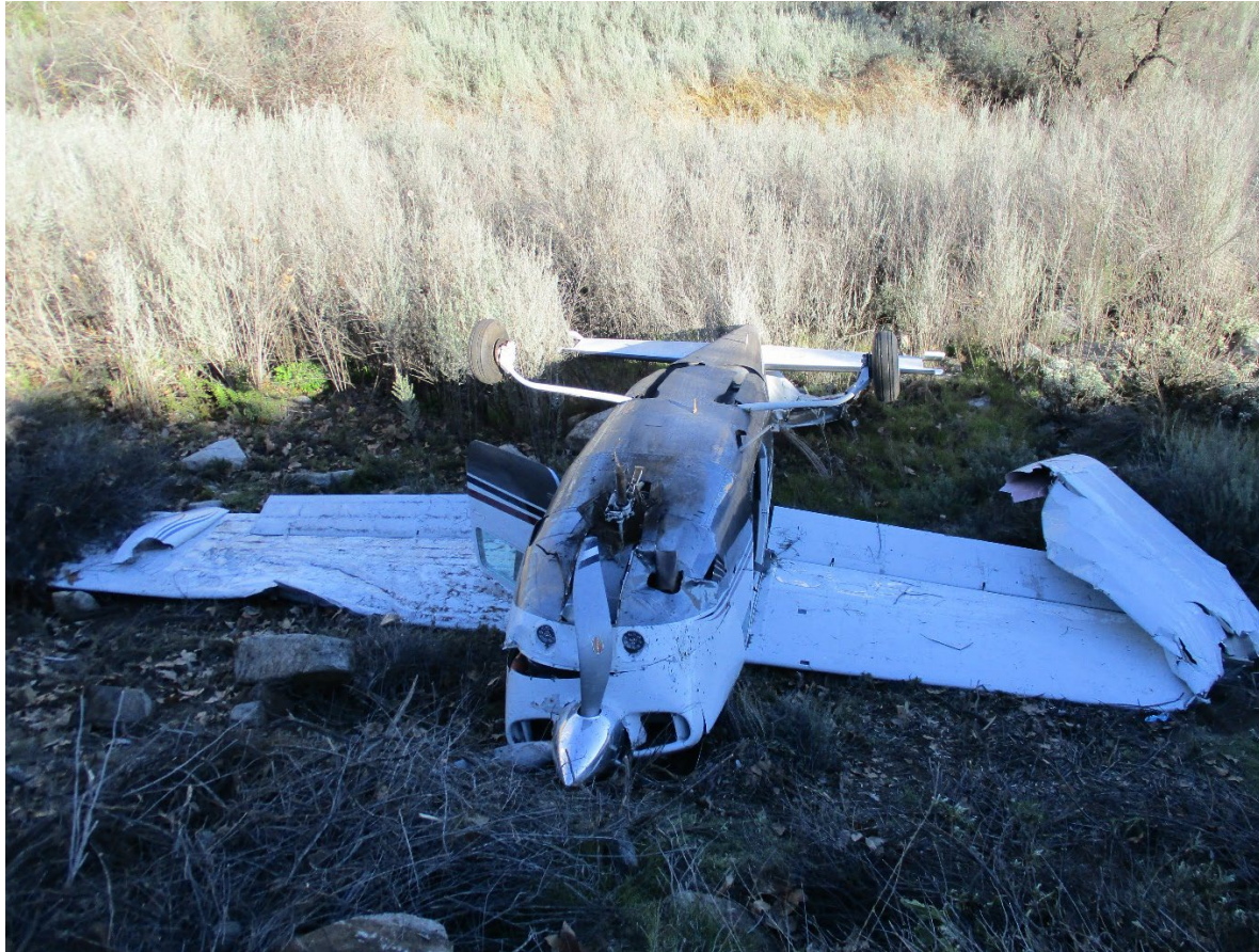
Photograph 1 - Forward to aft view of accident airplane and substantial damage to both wings