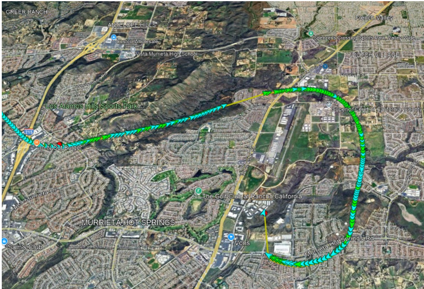
Photograph 3 - ADS-B view of accident airplane's airport traffic pattern track