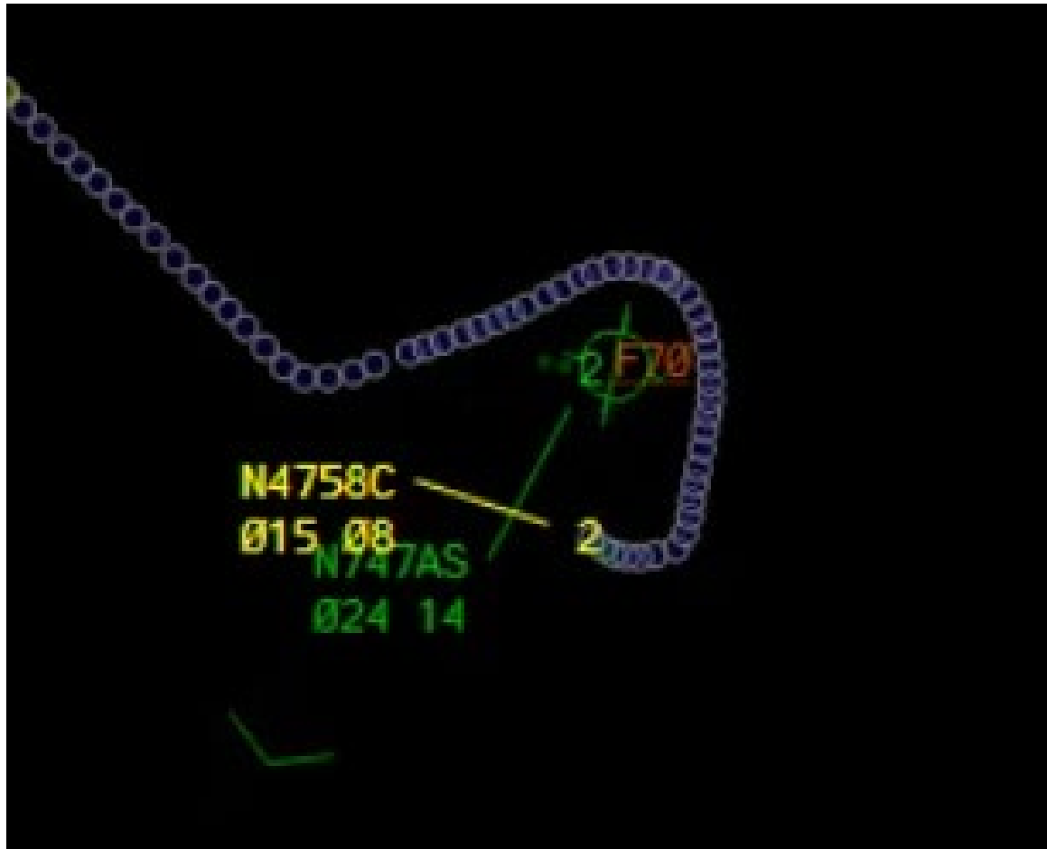
Photograph 4 - Falcon Replay radar return of airplane's altitude of 1,500 ft MSL during right turn from base to final