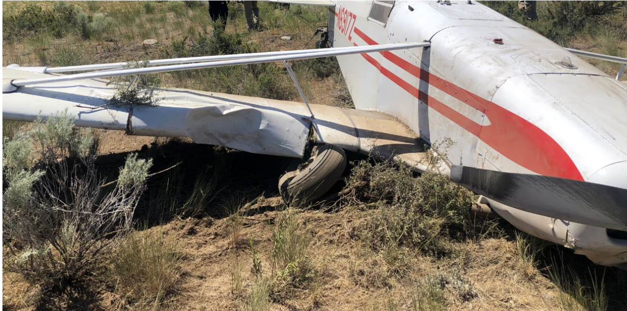
Photo 1 – View of damage to the right wing leading edge