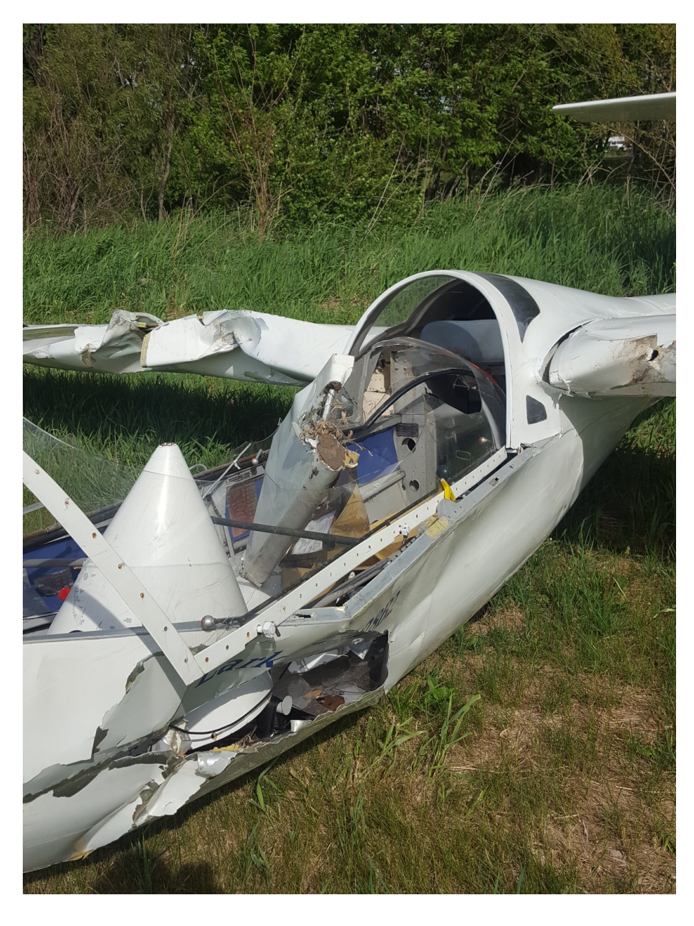
Photo 4 – View of the substantial damage sustained to the fuselage and both wings.