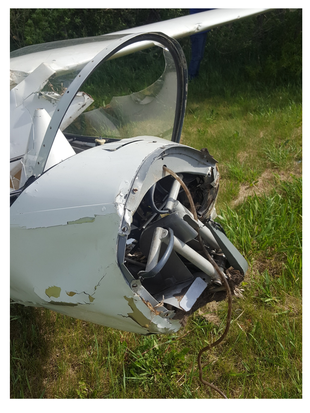
Photo 3 – View of the substantial damage sustained to the fuselage.