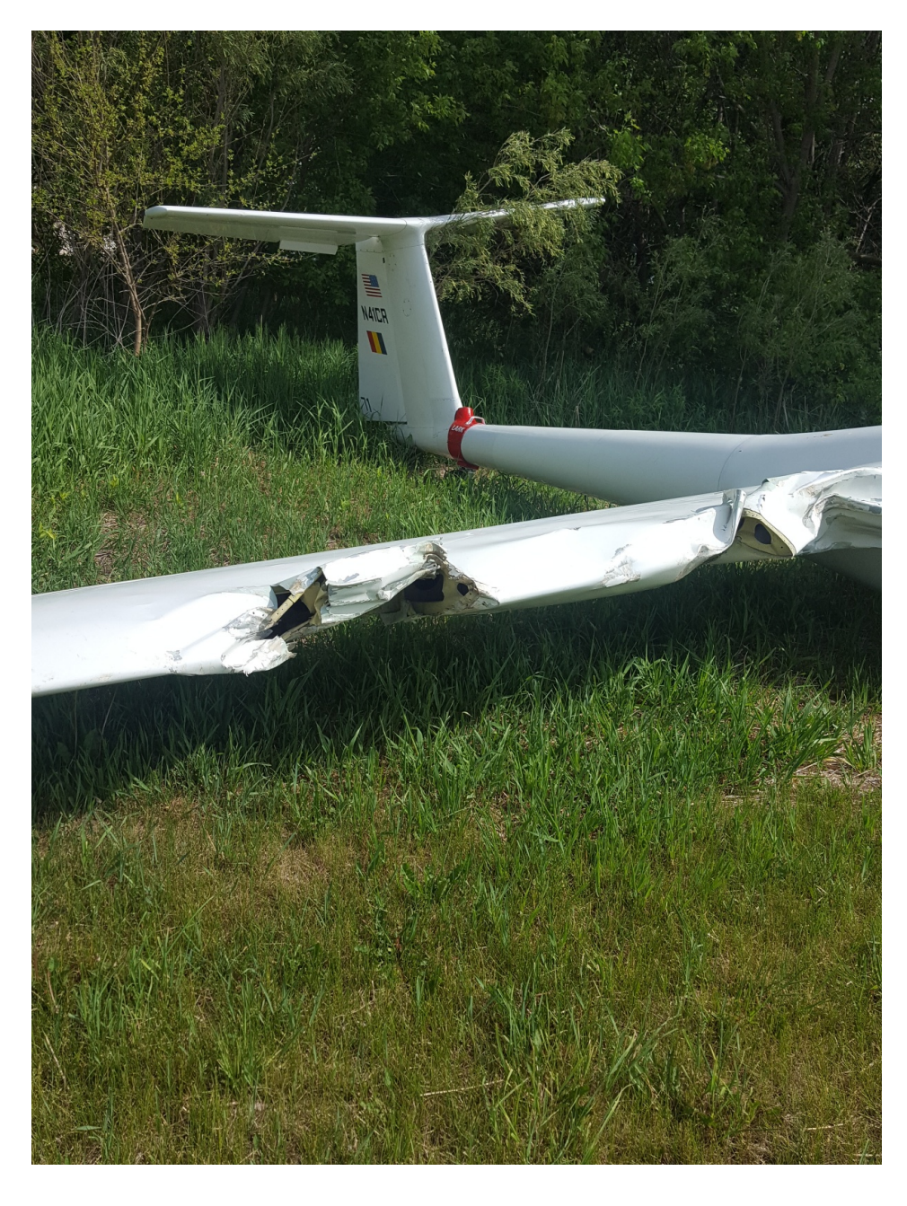
Photo 5 - View of the substantial damage sustained to the right wing (courtesy of the flight instructor).