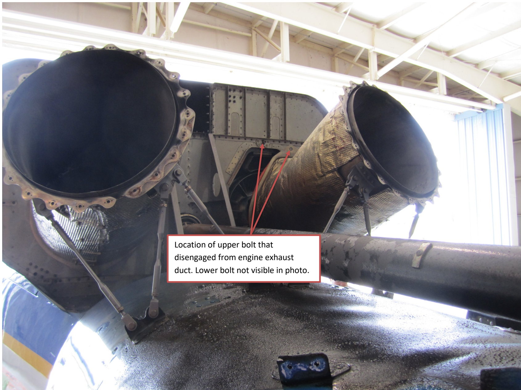
Photo 1 – Detached Engine #2 (Right Side) Exhaust Duct