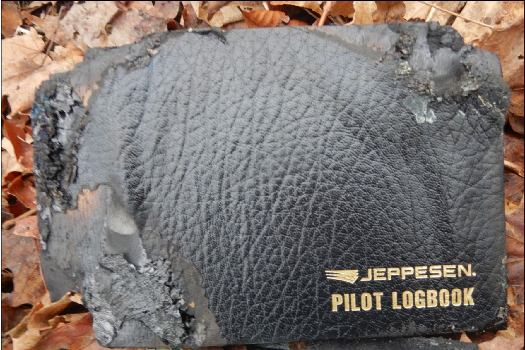
Photo 1 – View of the pilot's logbook recovered at the accident site