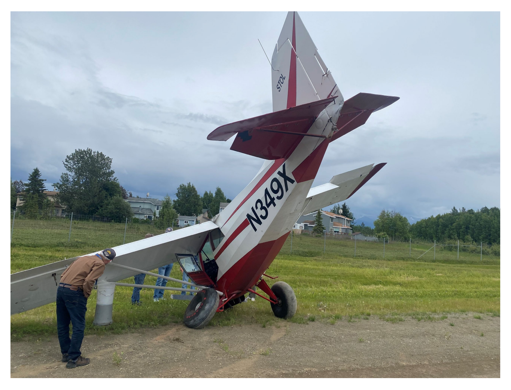
Photo 1-Accident airplane at accident site.