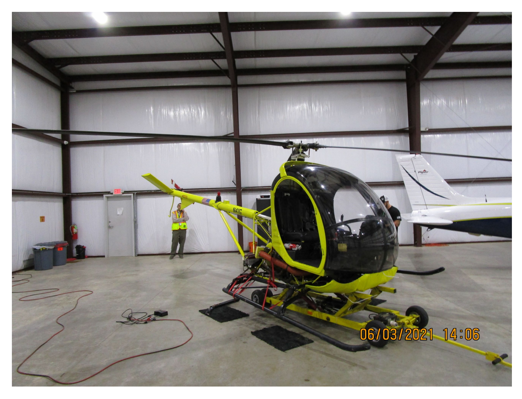
Photo \ 1-Overall \ view \ of \ helicopter \ after \ removal \ from \ accident \ site