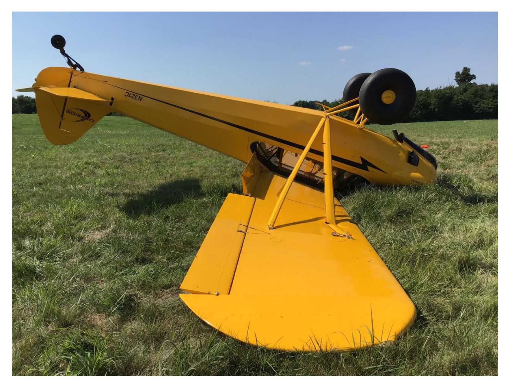
Photo 1-View of the left side of the airplane.