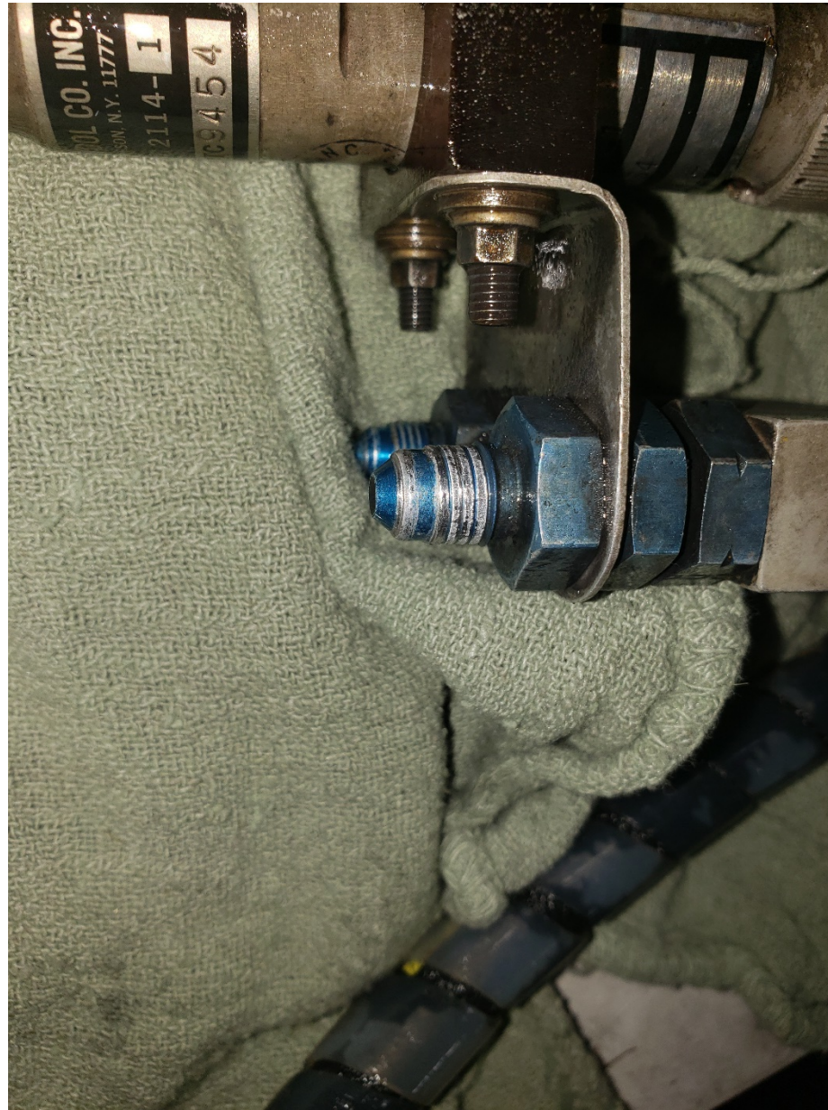
Photo 4. - Hydraulic actuator fitting exhibiting stripped grooves.