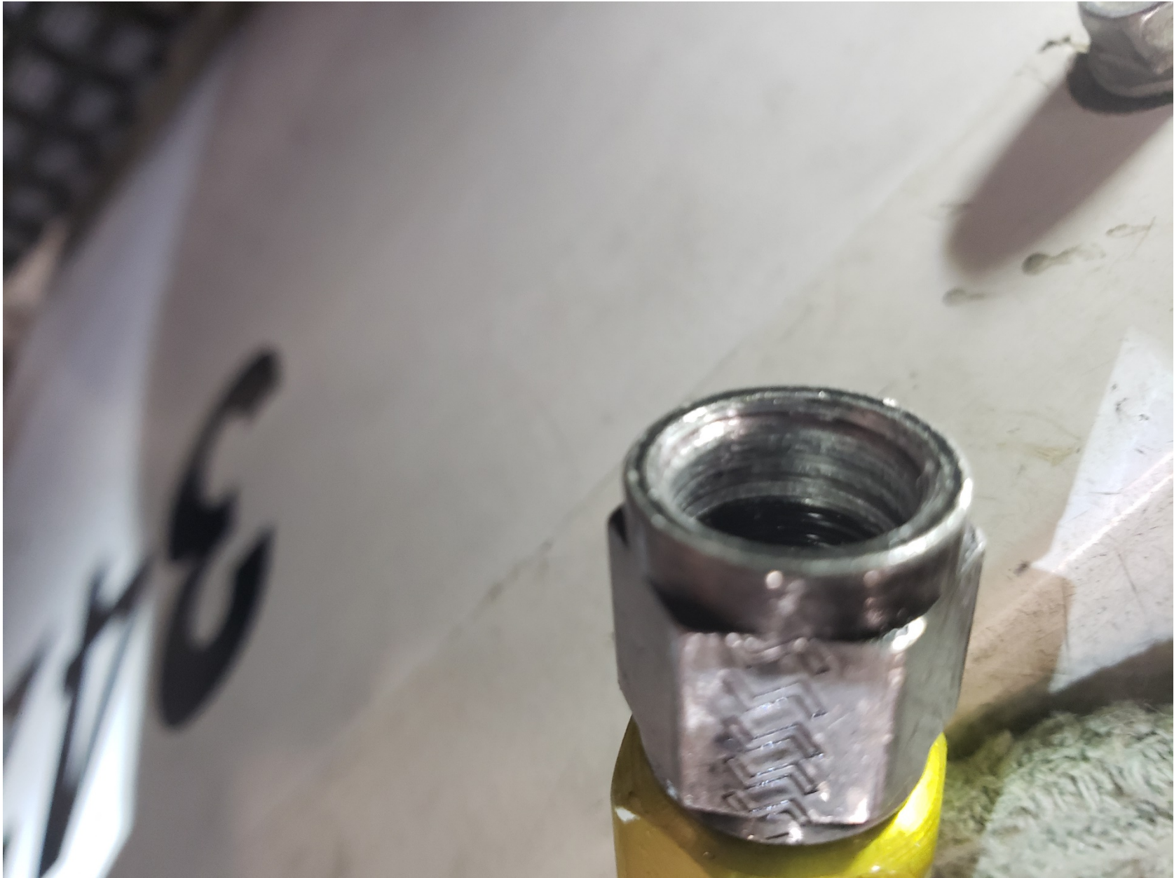
Photo 5 - Female end of hydraulic actuator fitting exhibiting stripped grooves.