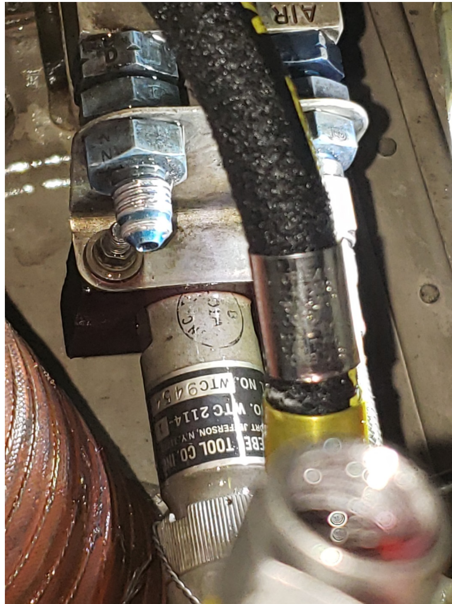
Photo 3 - Hydraulic fitting for the left main landing gear door actuator.