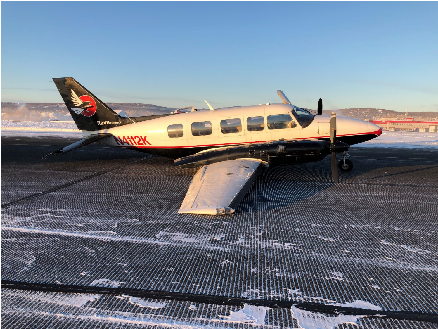
Photo 1 –N4112K with right wing on the runway at the accident scene.