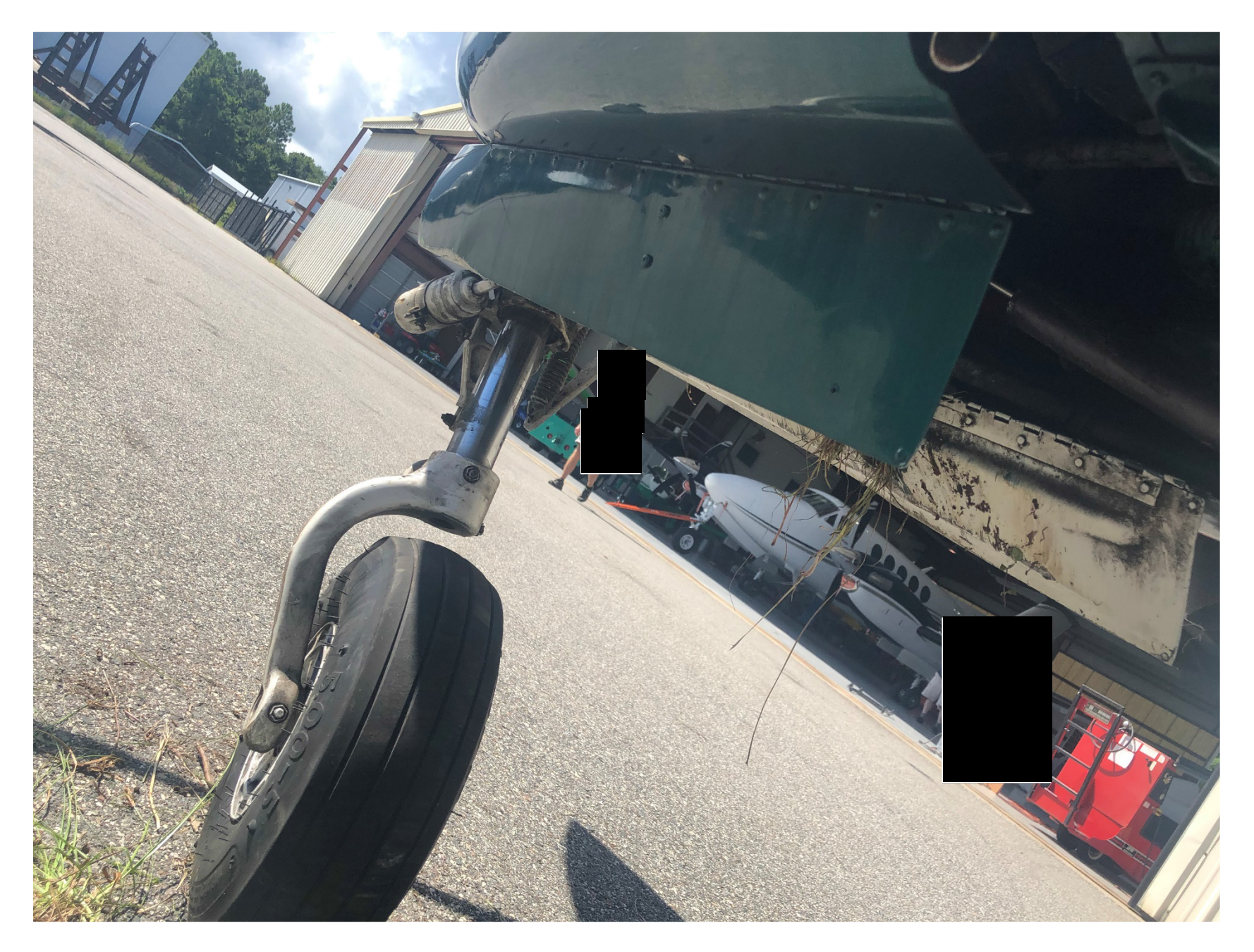
Photo 4 – View of the nose gear postaccident