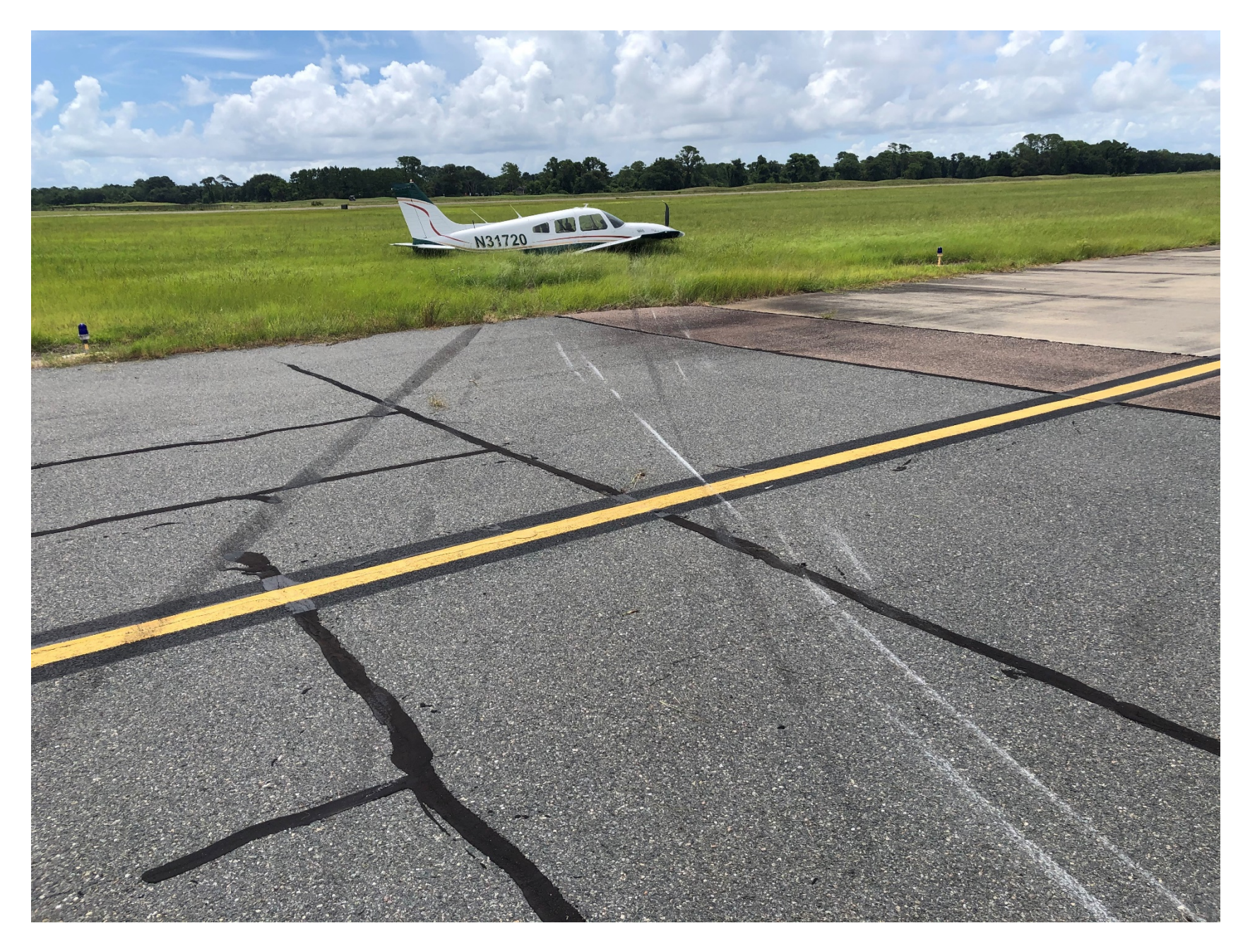
Photo 3 – View of the accident airplane and skid marks