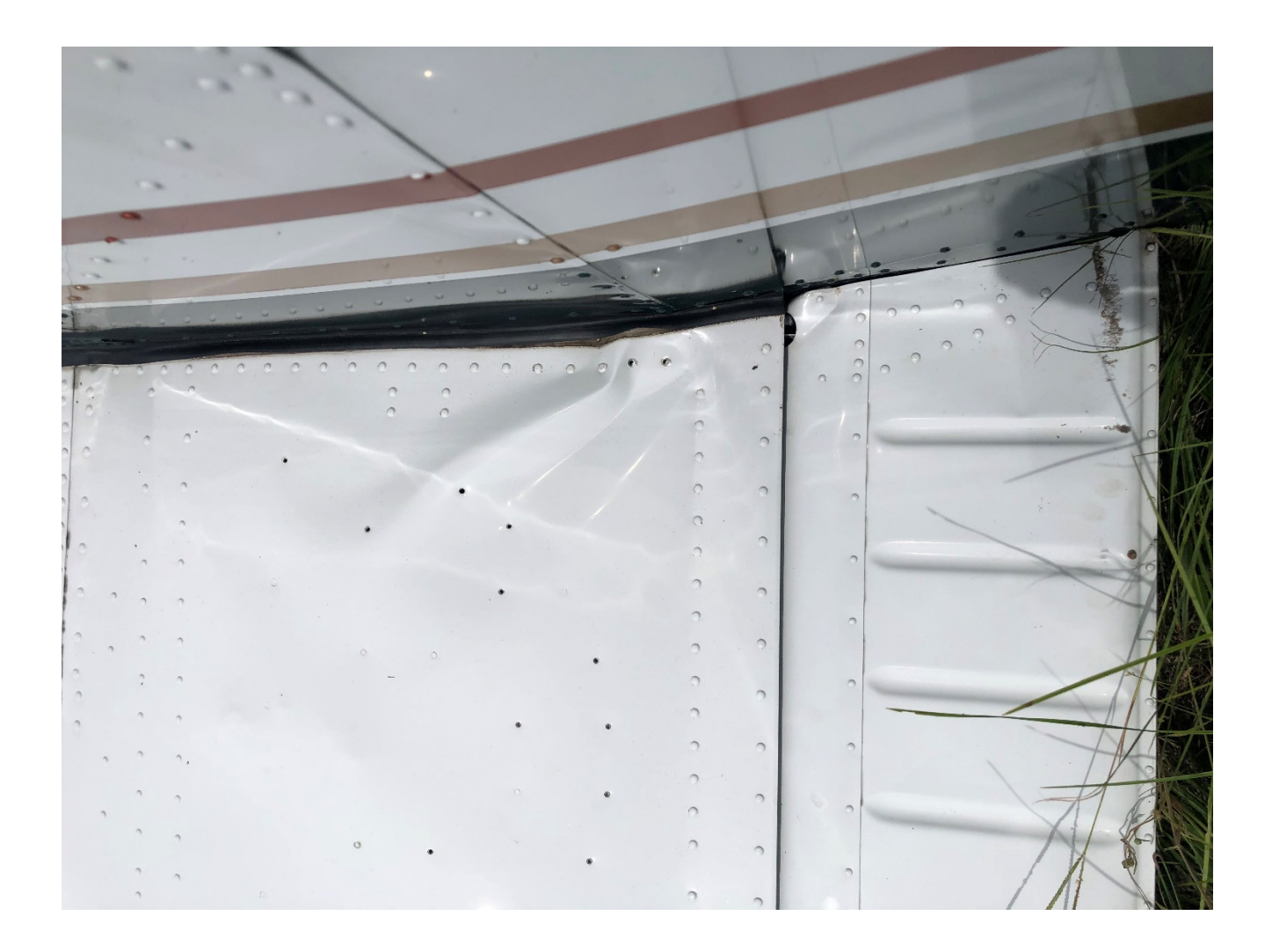
Photo 2 - Buckling and substantial damage to the left wing