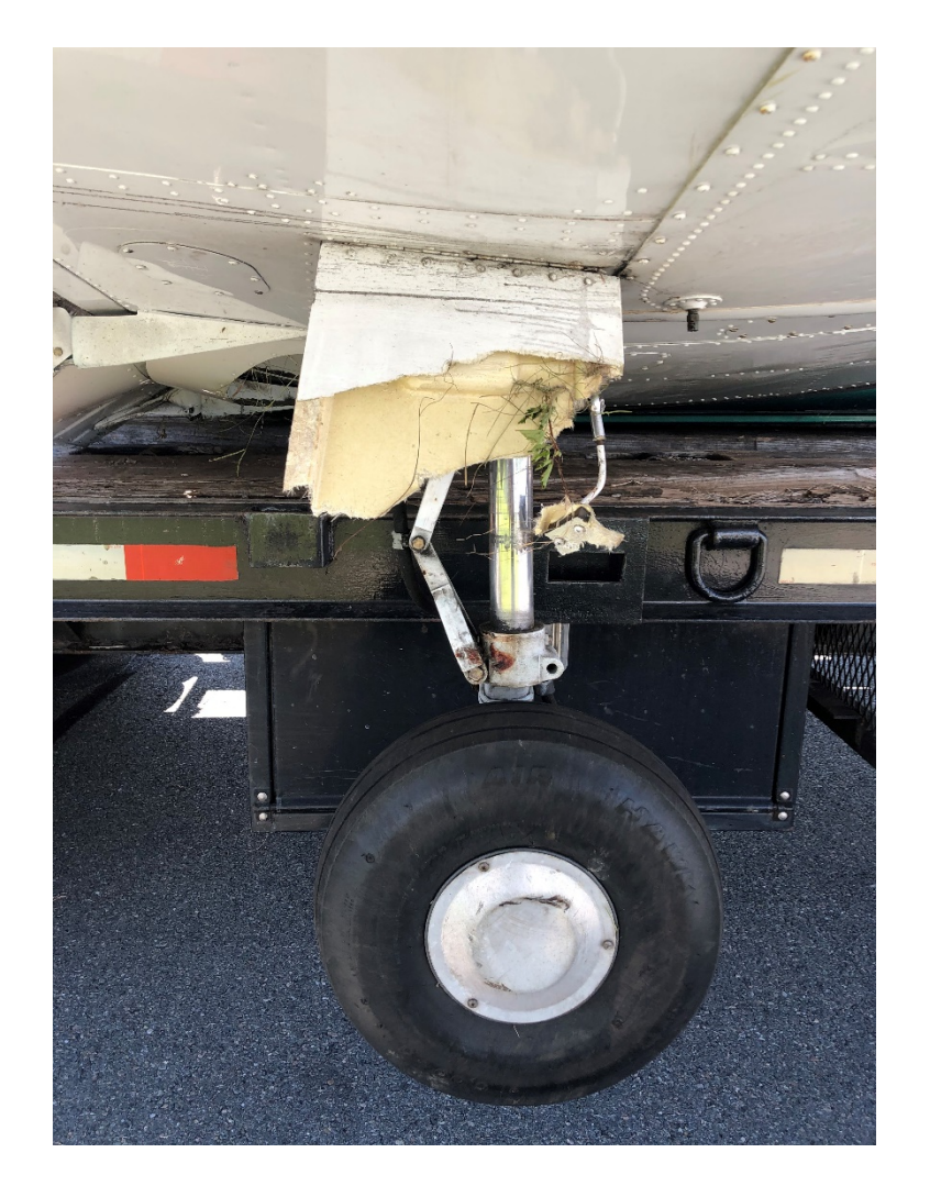
Photo 6 – View of the left main landing gear