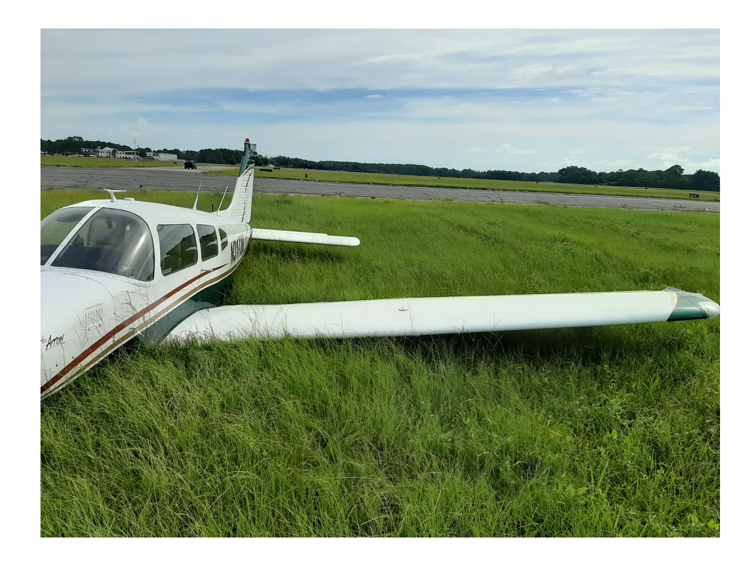
Photo 1 – View of the airplane at the accident site