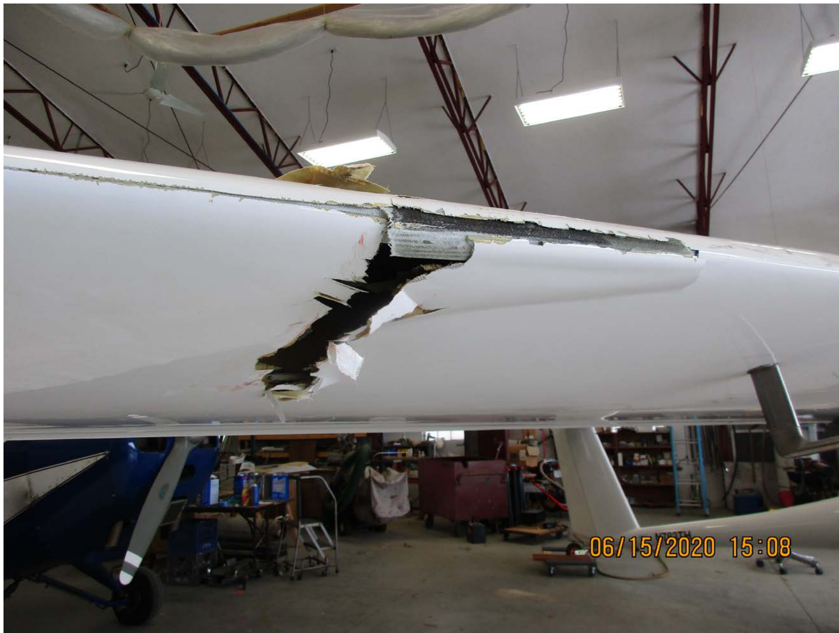
Photo 8 – Close Up of Wing Damage Outboard of Pitot Tube