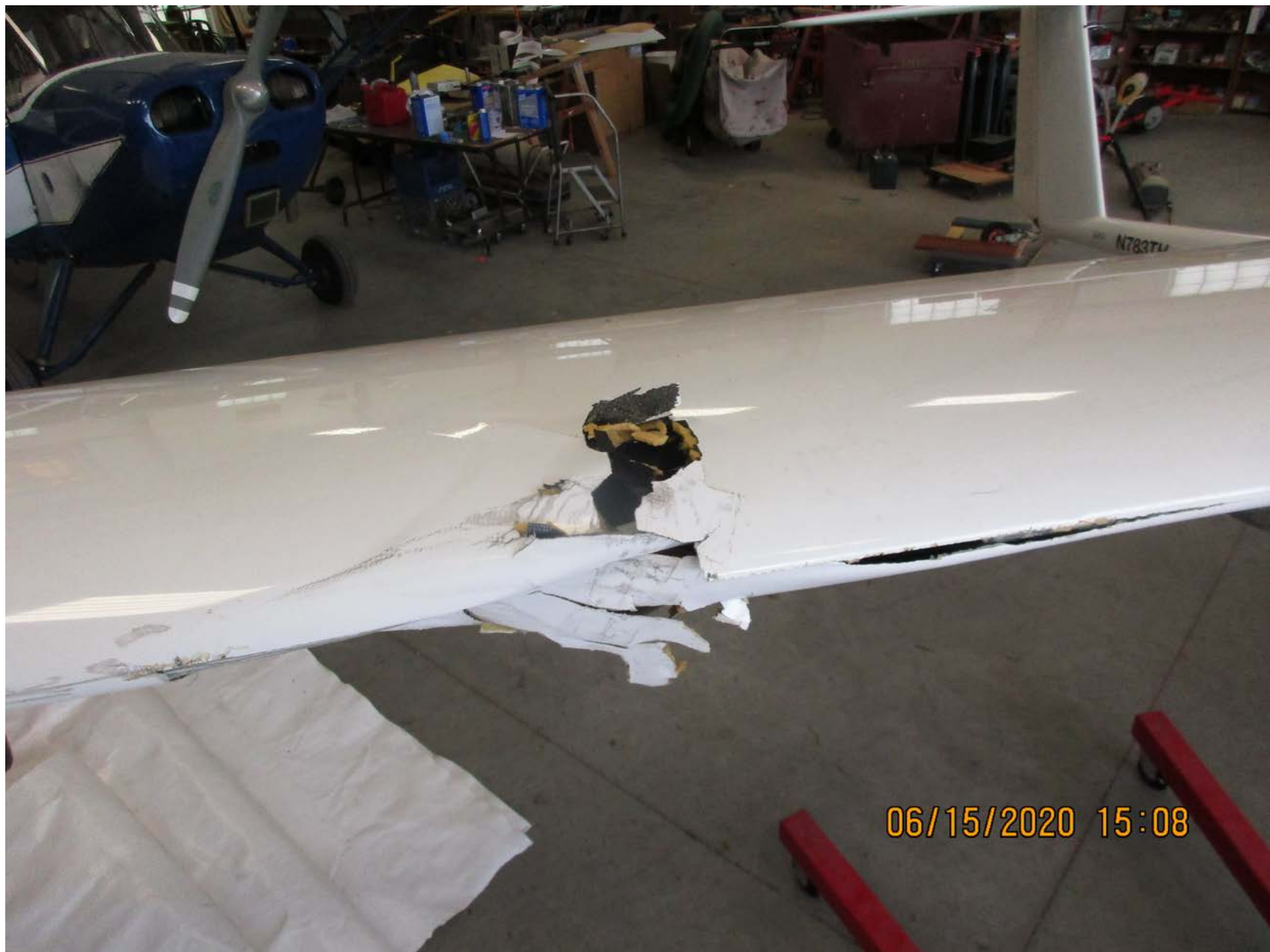
Photo 9 – Close Up of Right Wing Damage Inboard of Pitot Tube