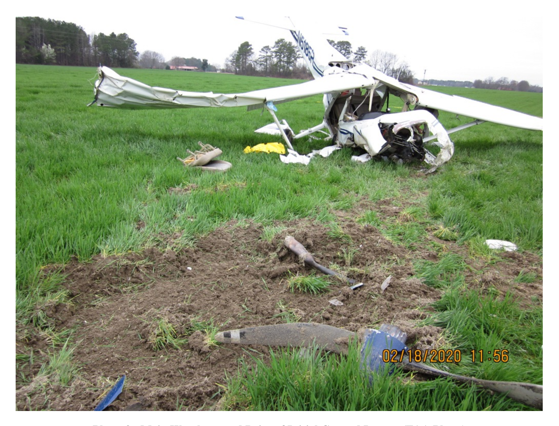
Photo 3 - Main Wreckage and Point of Initial Ground Impact