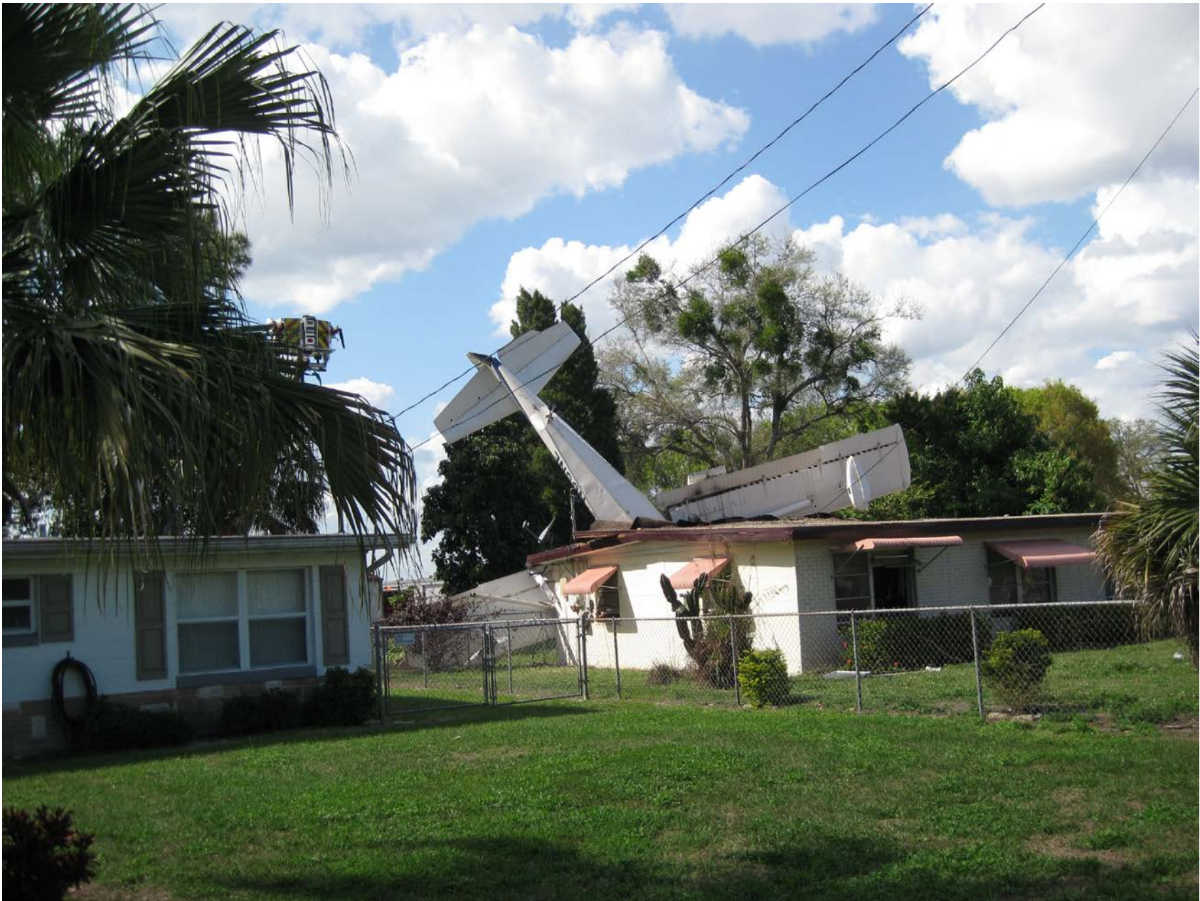
Photo 1 – View of the airplane in the house from the front of the house.