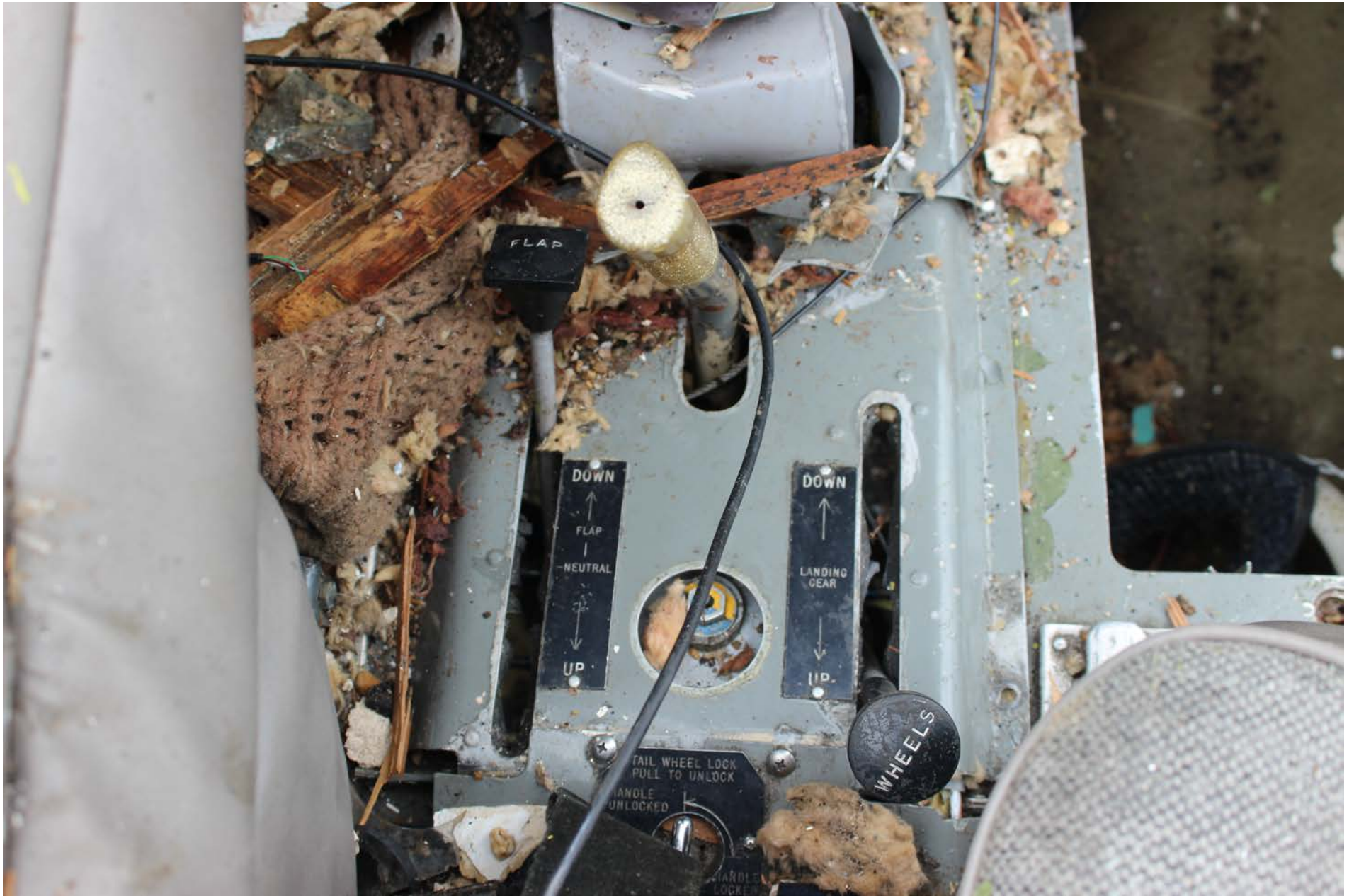
Photo 7 – View of the cockpit controls, the flap and landing gear handles.