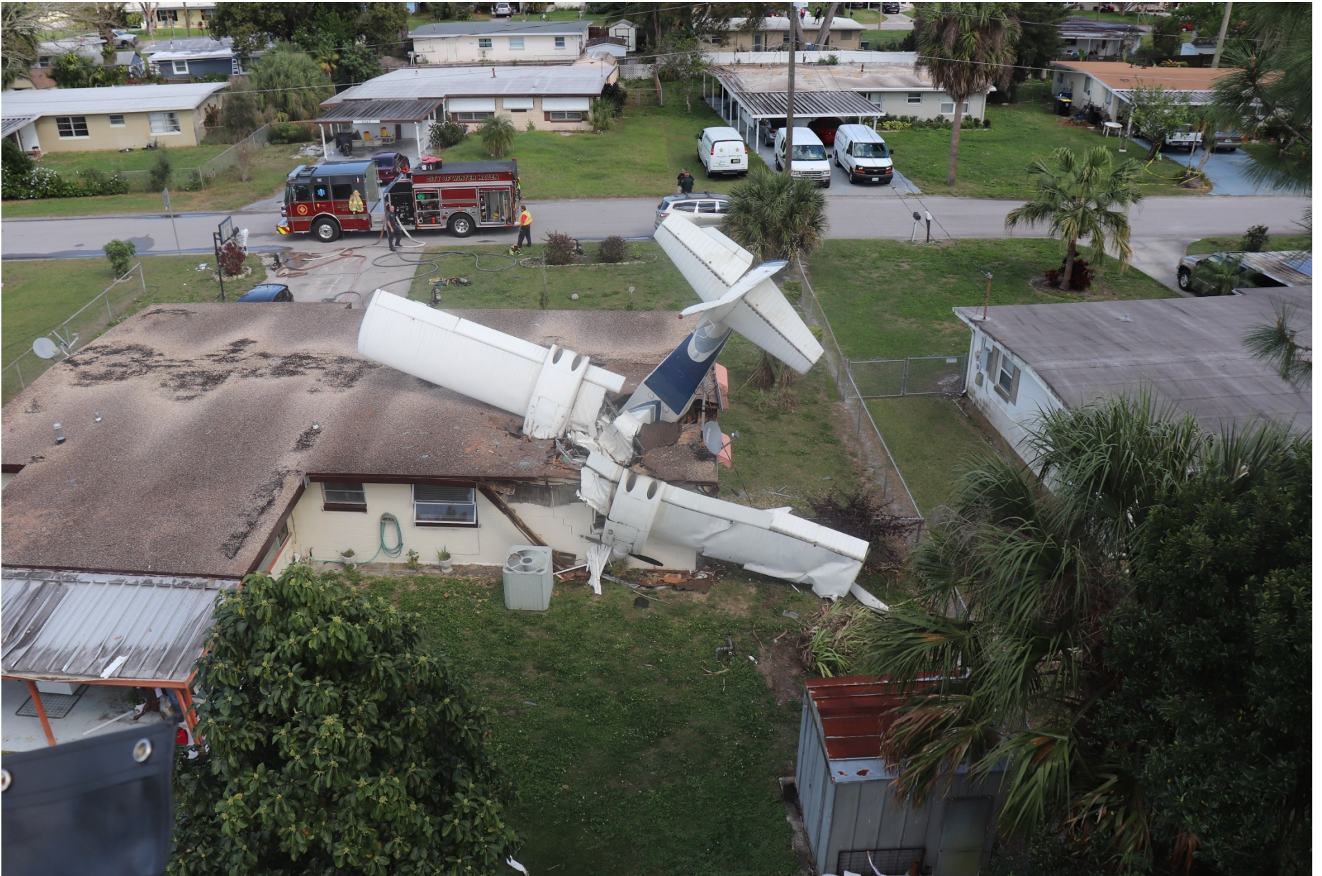
Photo 3 – Aerial view of the airplane in the house.