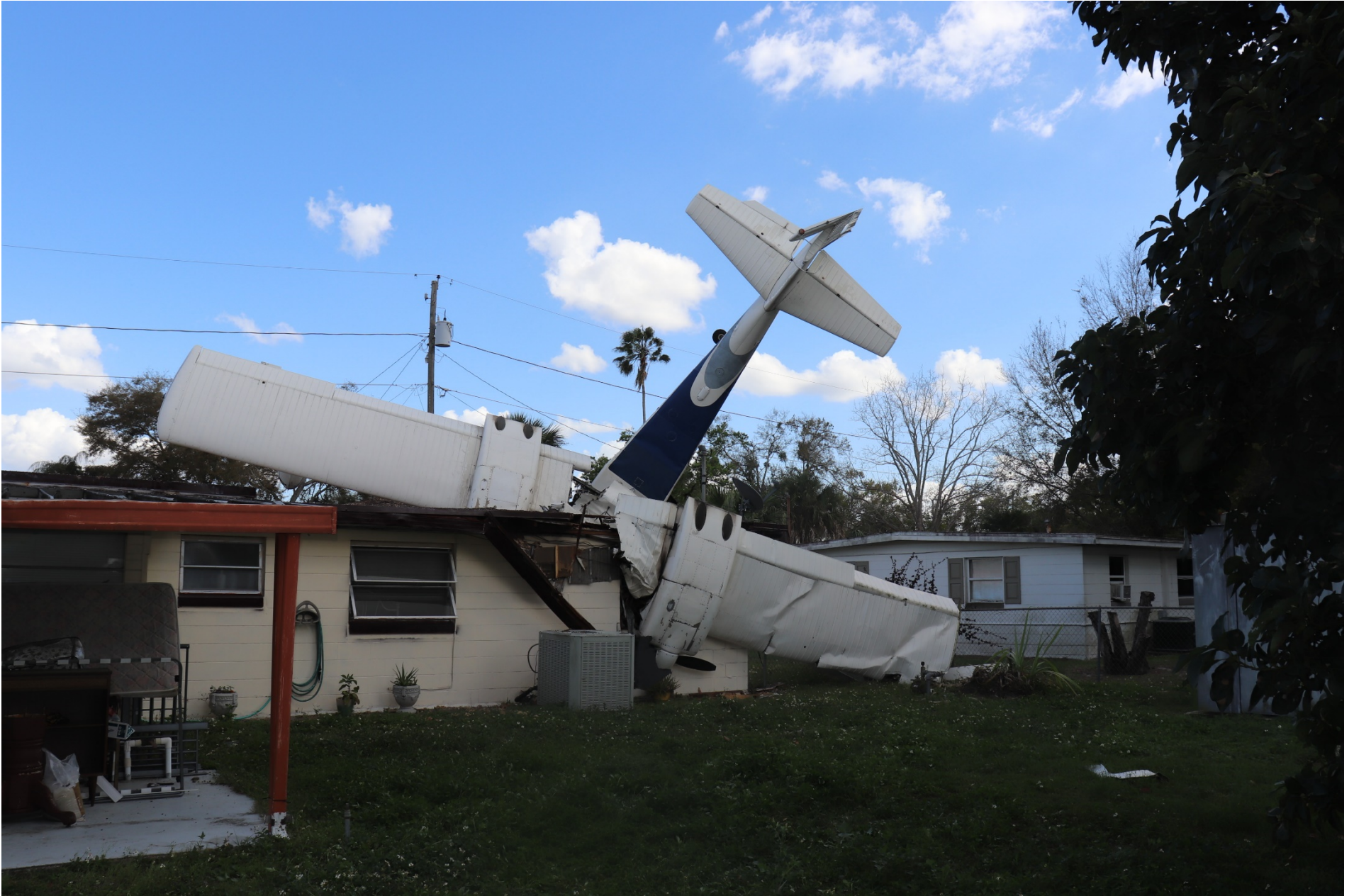
Photo 2 – View of the airplane in the house from the back of the house.