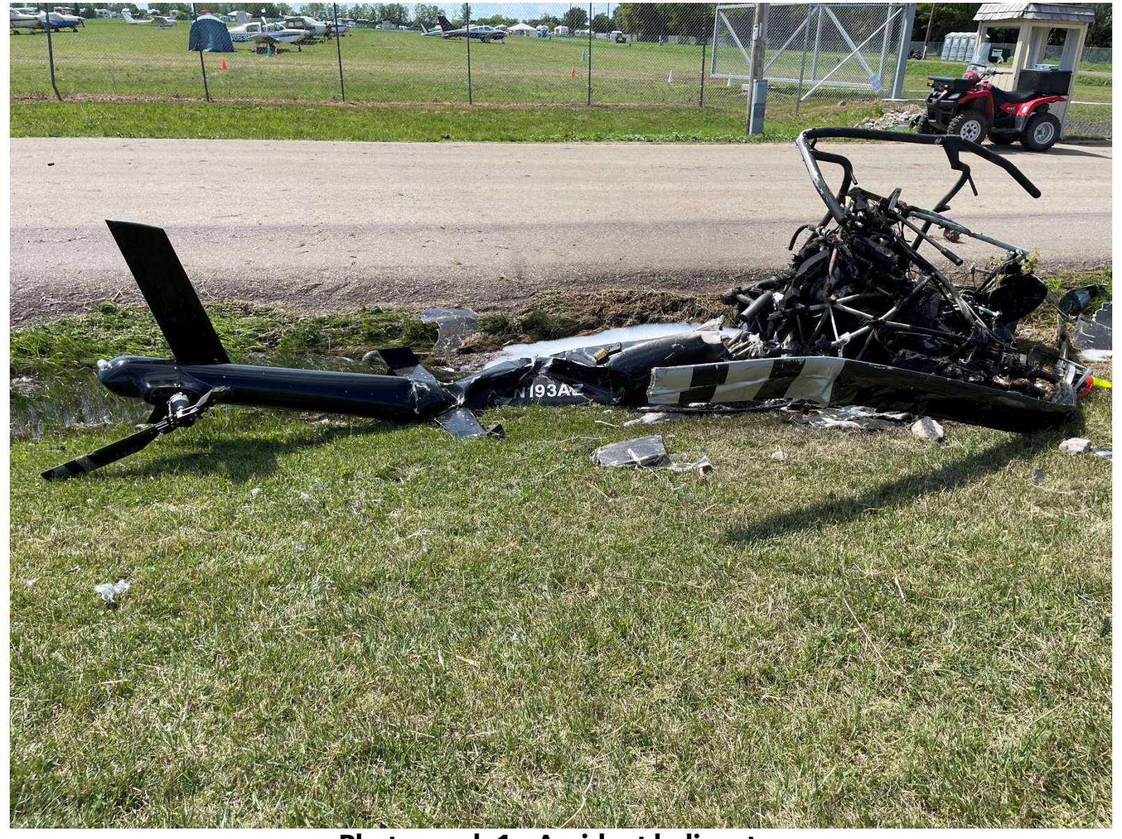
Photograph 1 - Accident helicopter