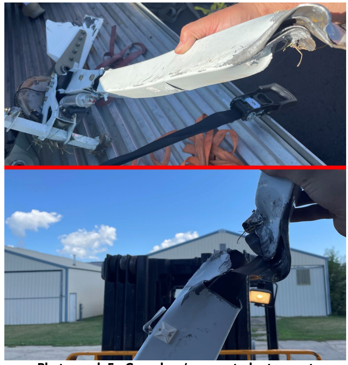
Photograph 5 - Gyroplane's separated rotor mast