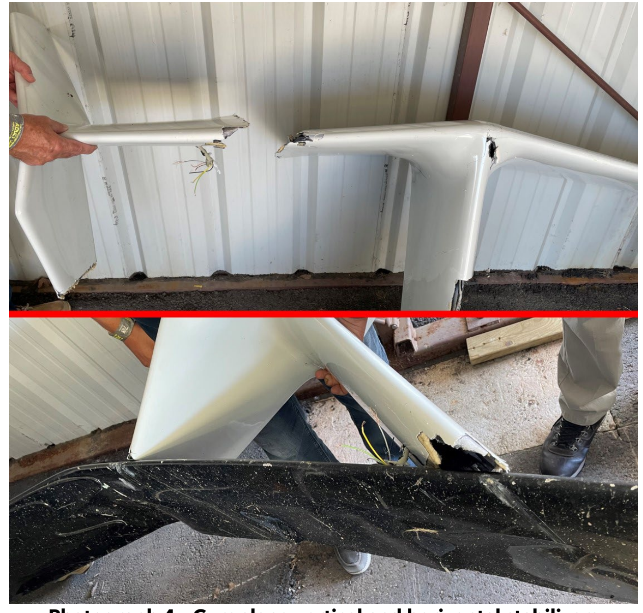
Photograph 4 - Gyroplane vertical and horizontal stabilizers