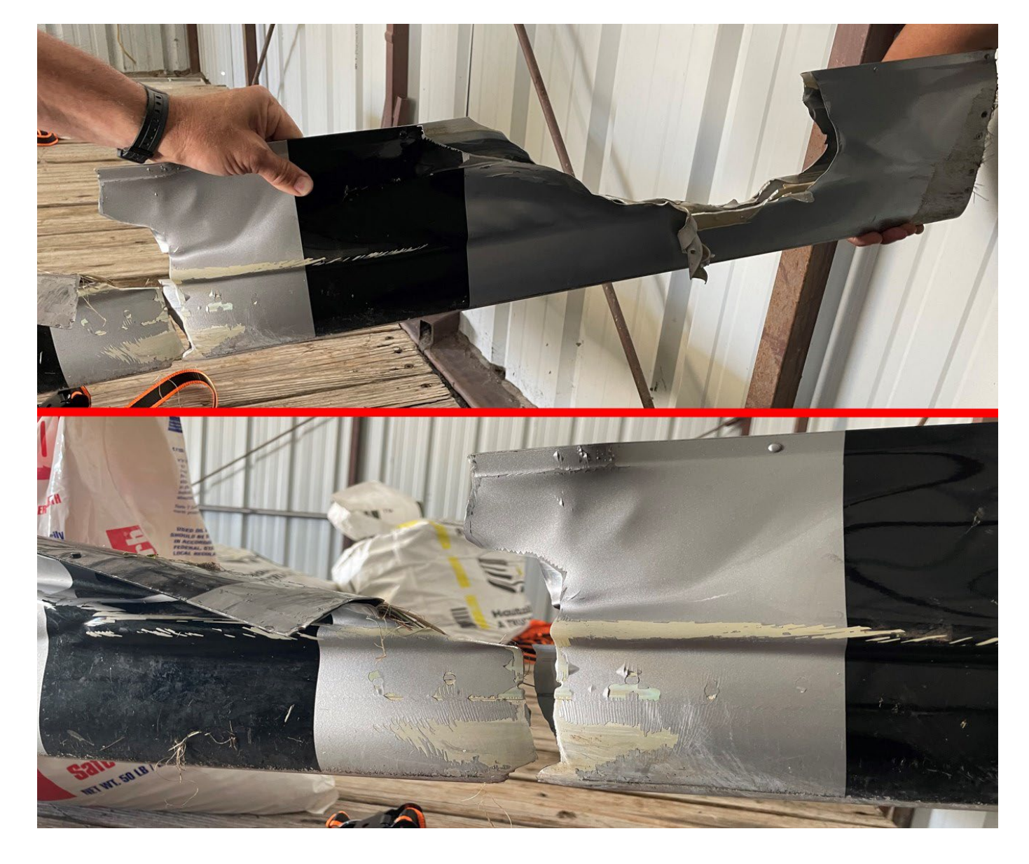
Photograph 3 - Separated outboard sections of the helicopter main rotor blades