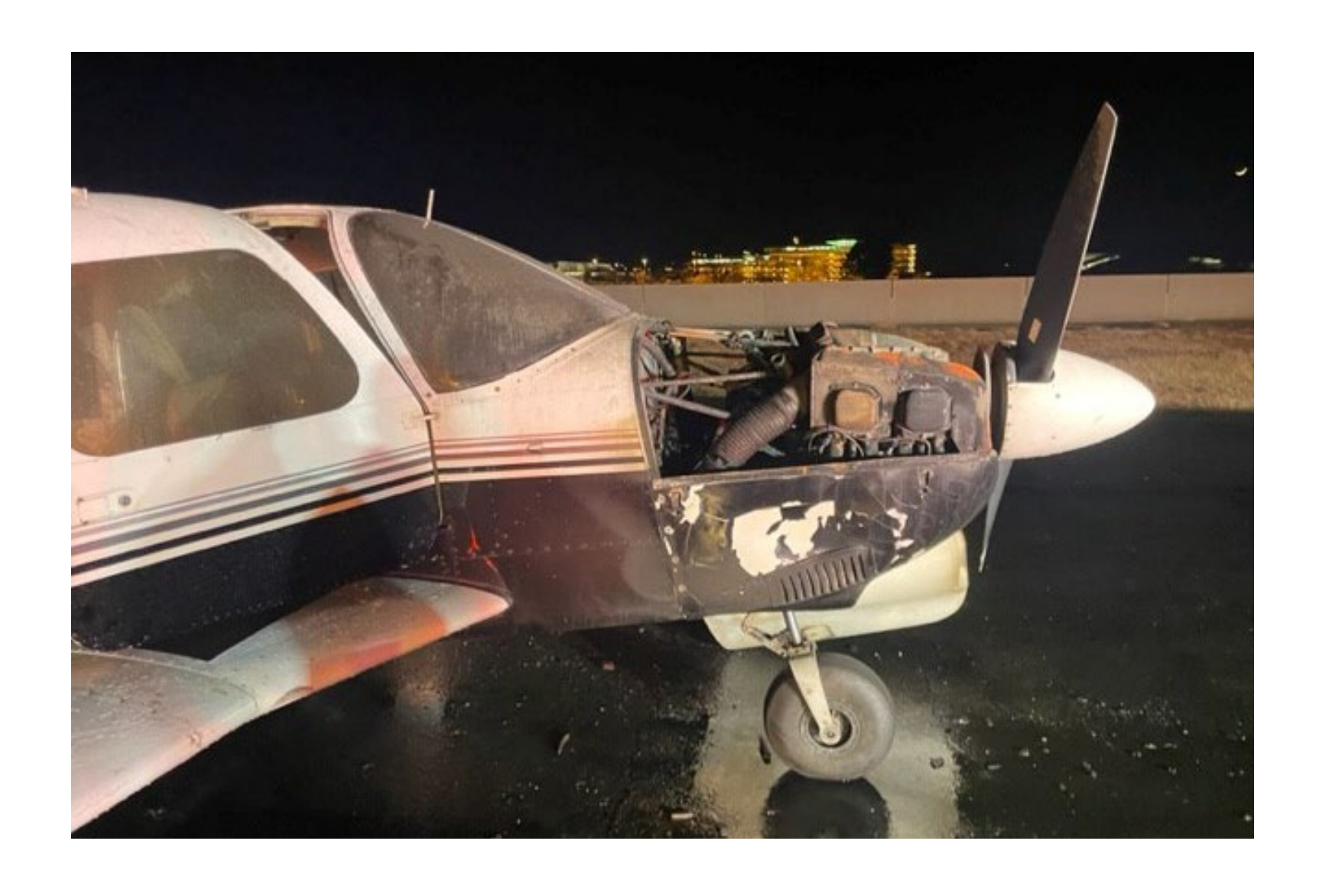
Photo 3 – Close-up view of damage after fire extinguished