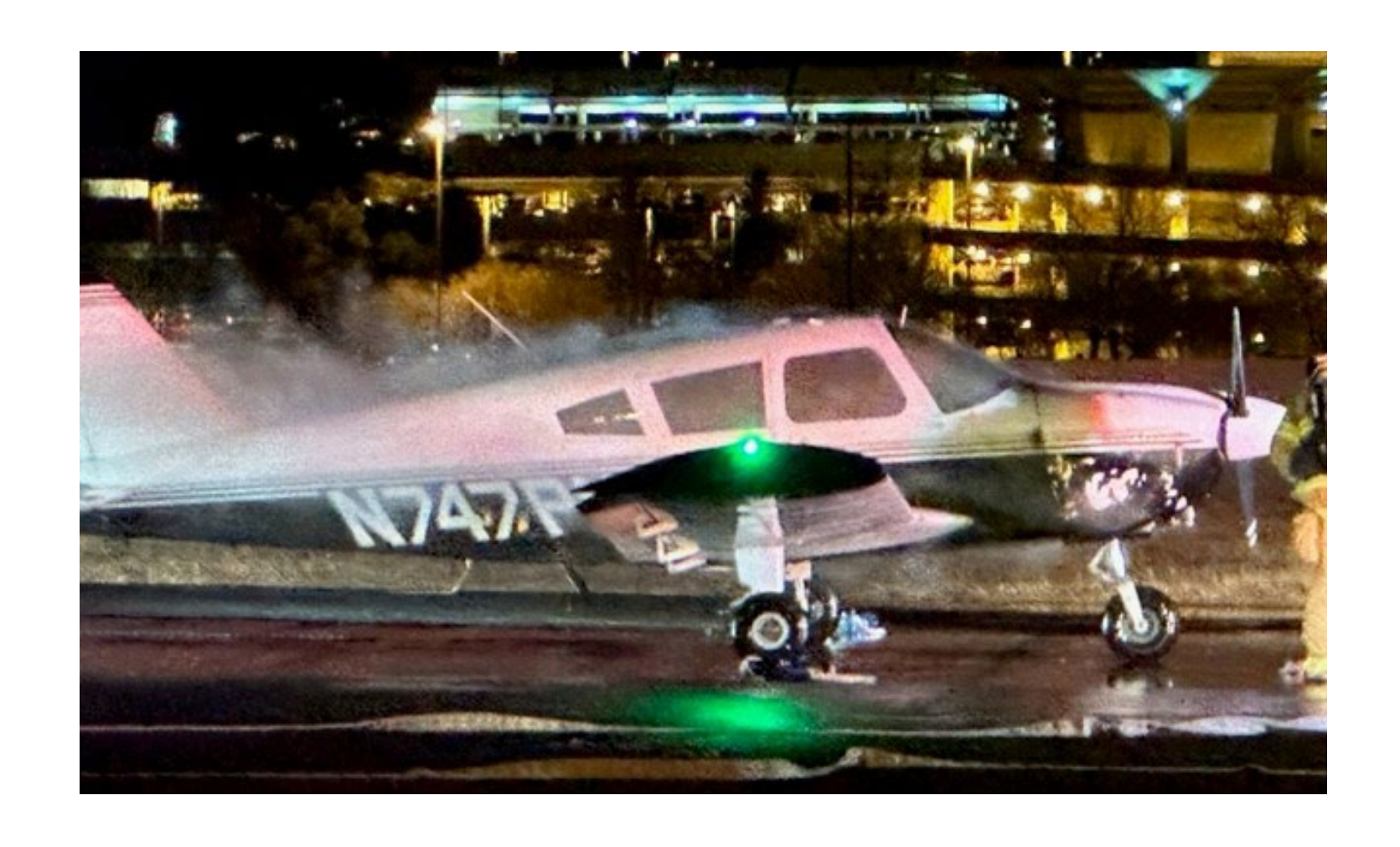
Photo 2 – View of airplane after fire extinguished