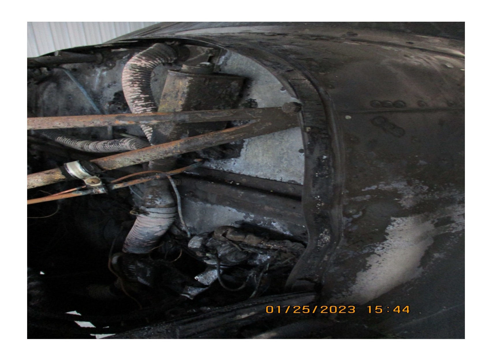
Photo 4 – View of fire damaged engine mounts and firewall