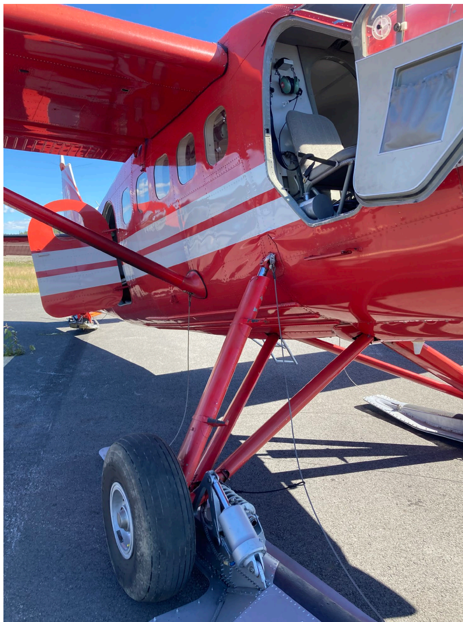
Accident Airplane / Right main landing gear and fuselage