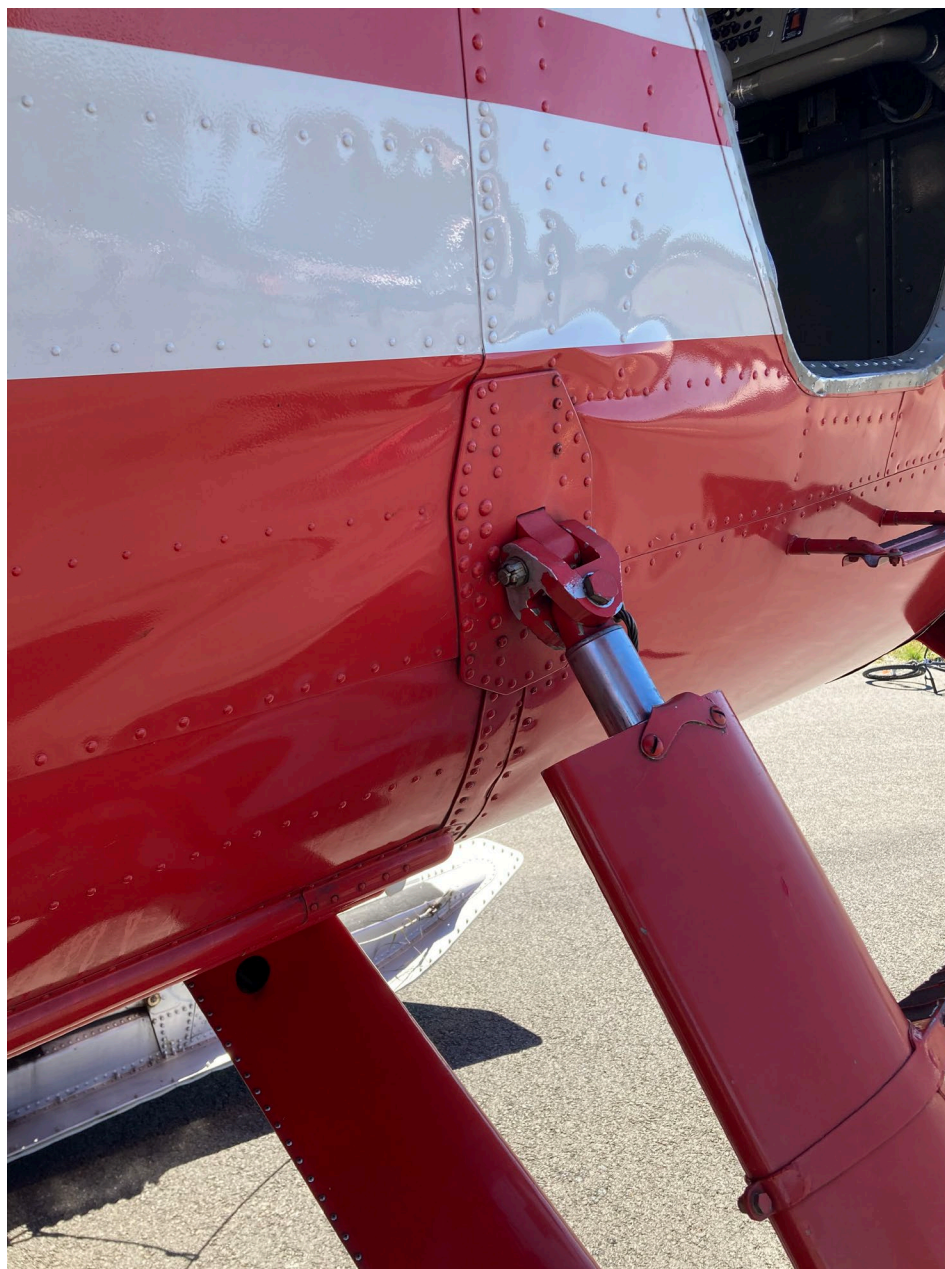
Accident Airplane / Right main landing gear strut