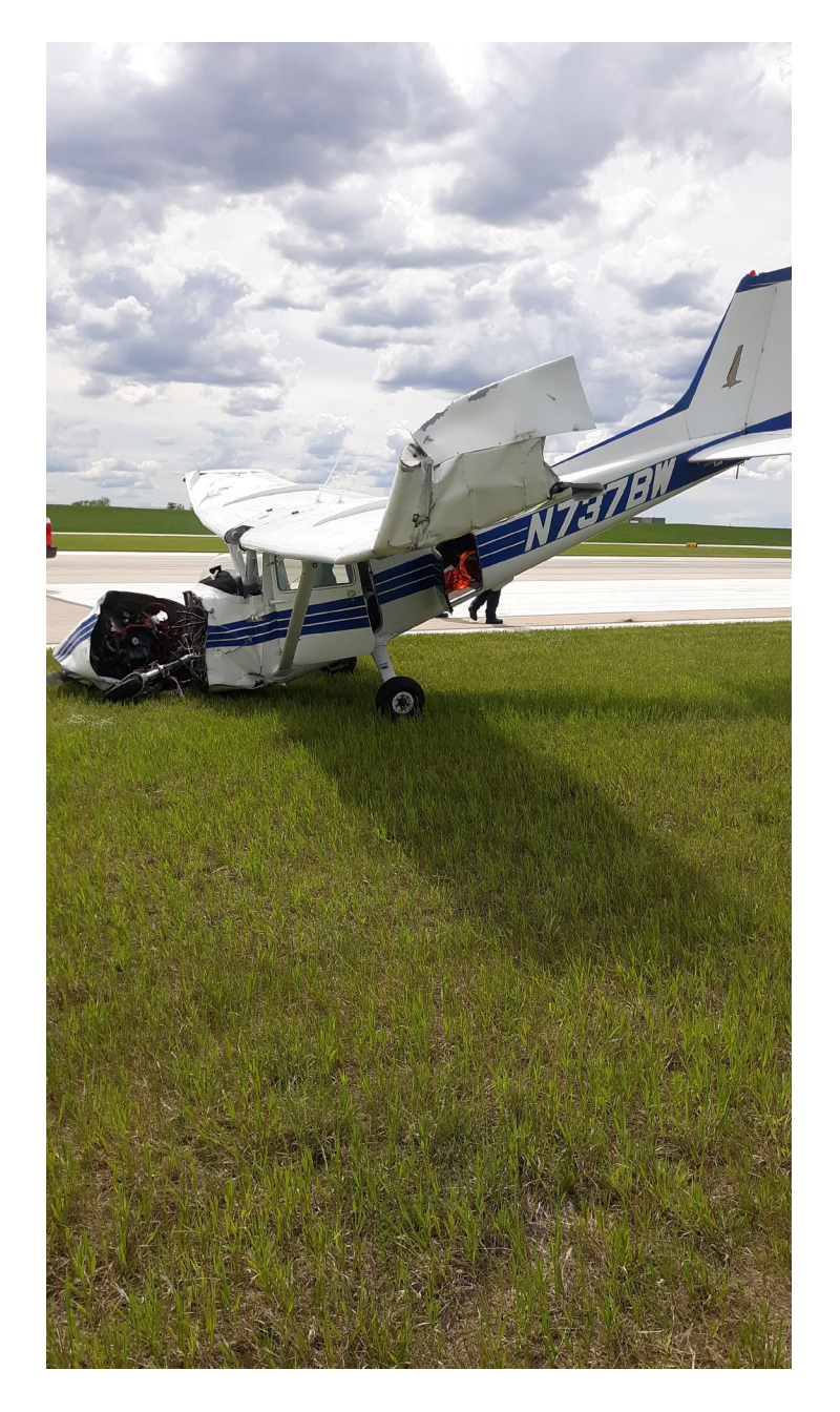
Photo 1 – Left Side of the Airplane