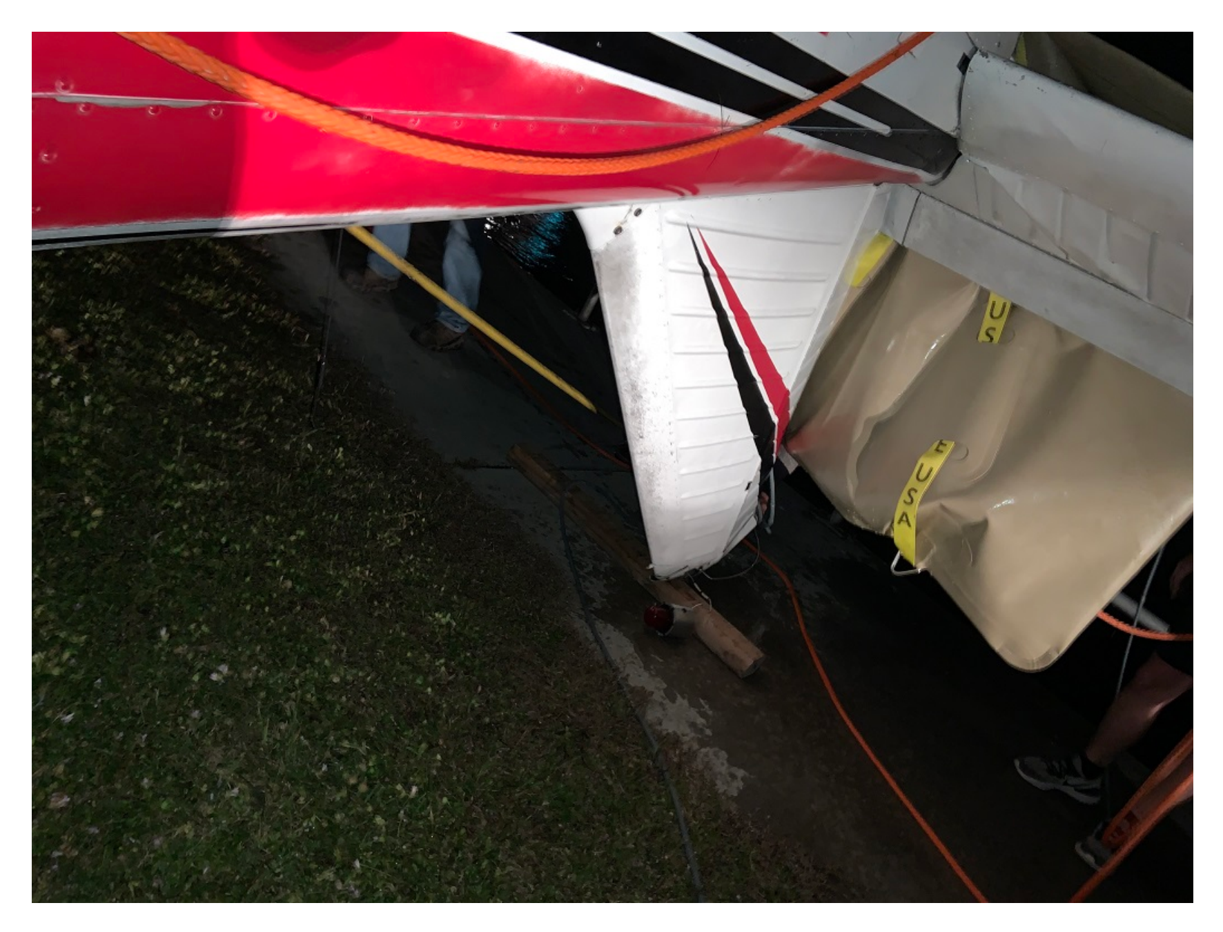
Photo 2 – Right Horizontal Stabilator