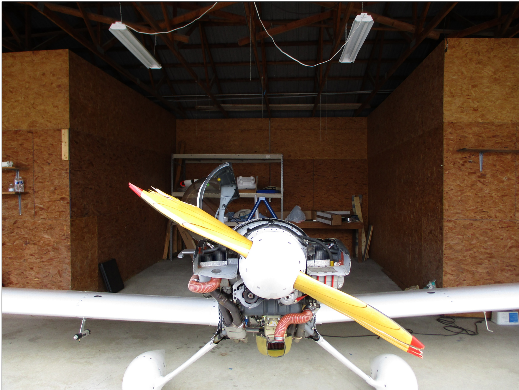
Photo 1 – View of the airplane damage sustained to the forward nose and engine area