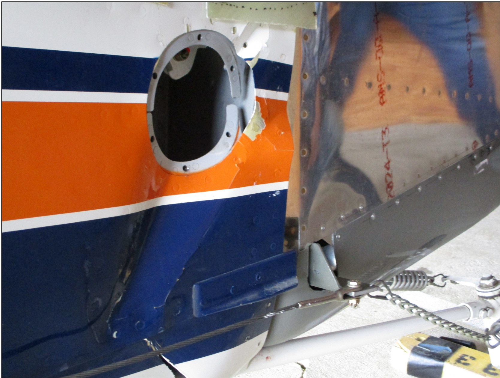
Photo 3 – Overview of the buckled empennage/ fuselage area