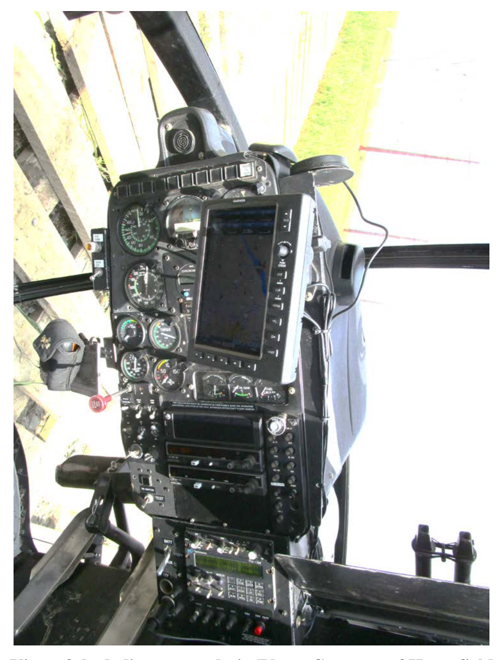
Photo 5 – View of the helicopter cockpit