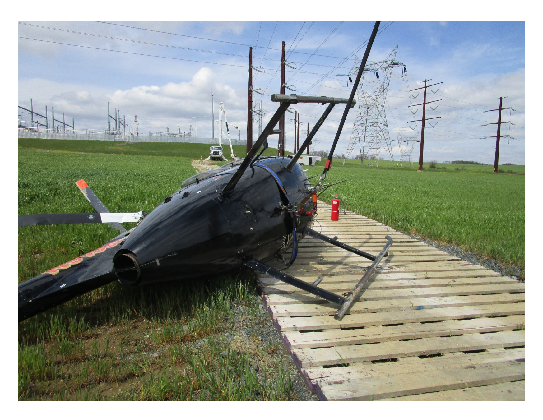
Photo 1 – View of the helicopter at the accident site