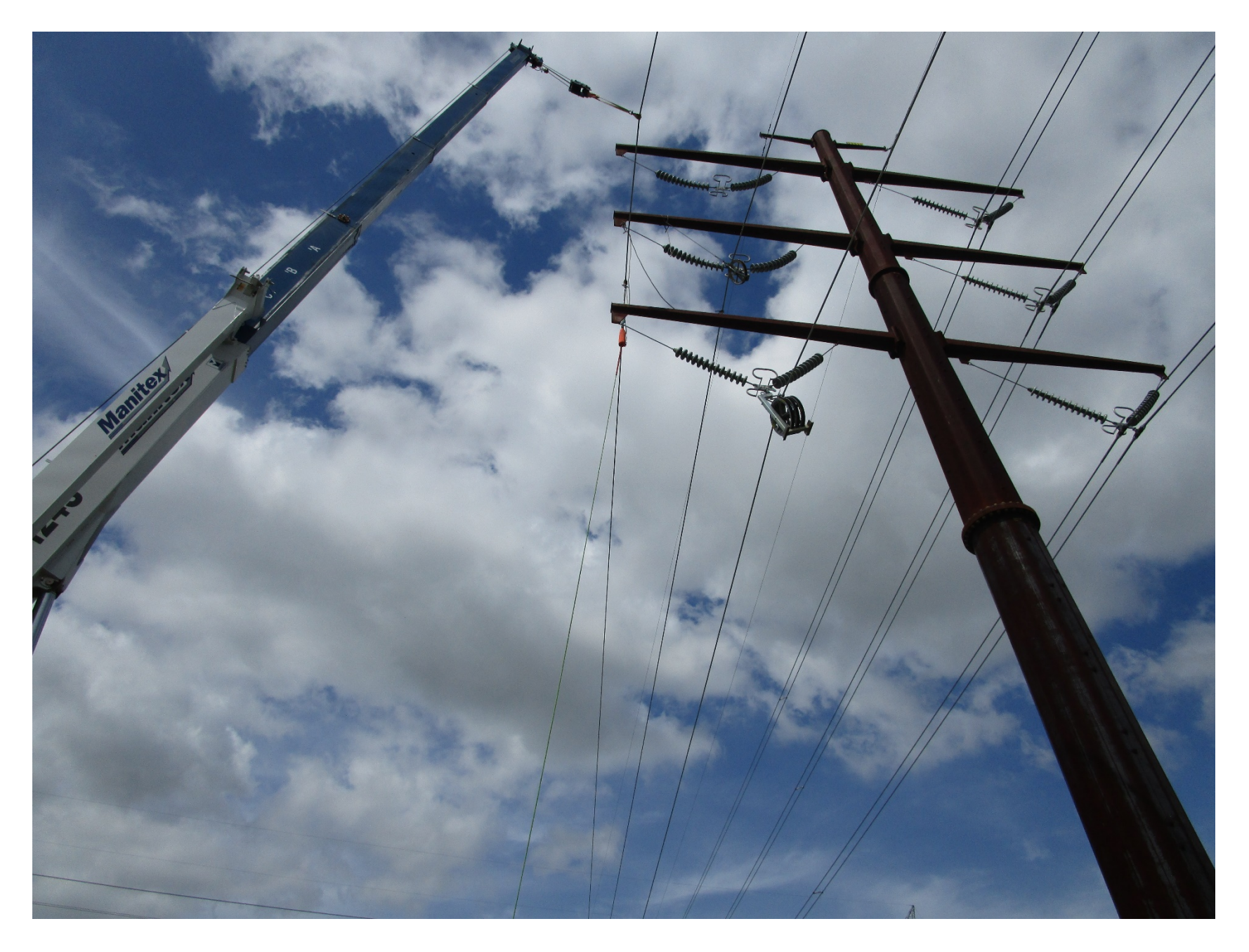
Photo 4 – View of power lines and the long line leading toward helicopter