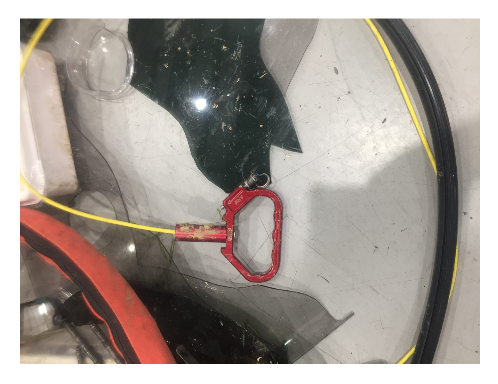
Photo 6 – View of the pulled belly band release handle postaccident