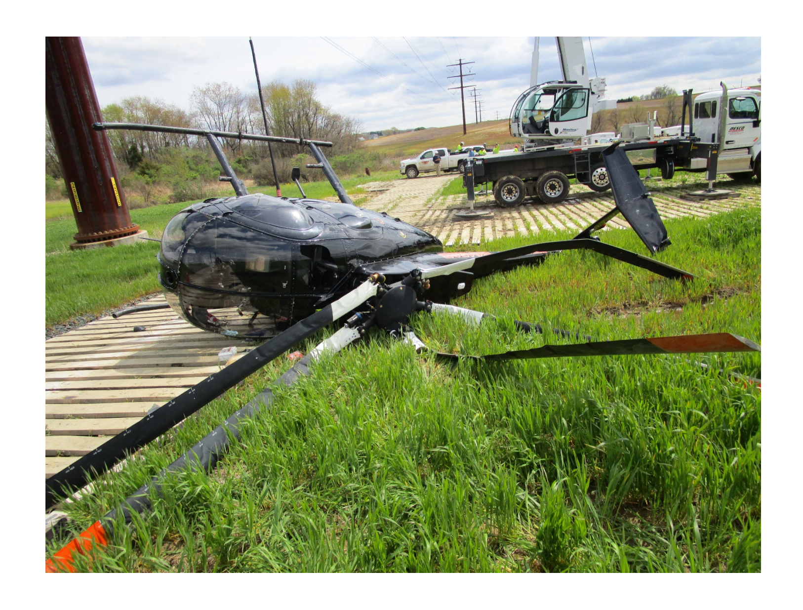
Photo 3 – View of the helicopter at the accident site