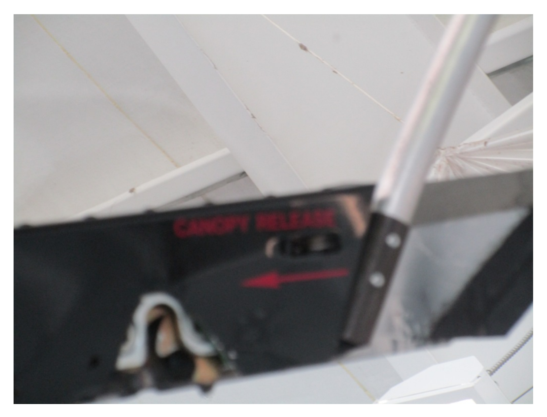
Photo 2 – Latching System Provided By Kit Manufacturer