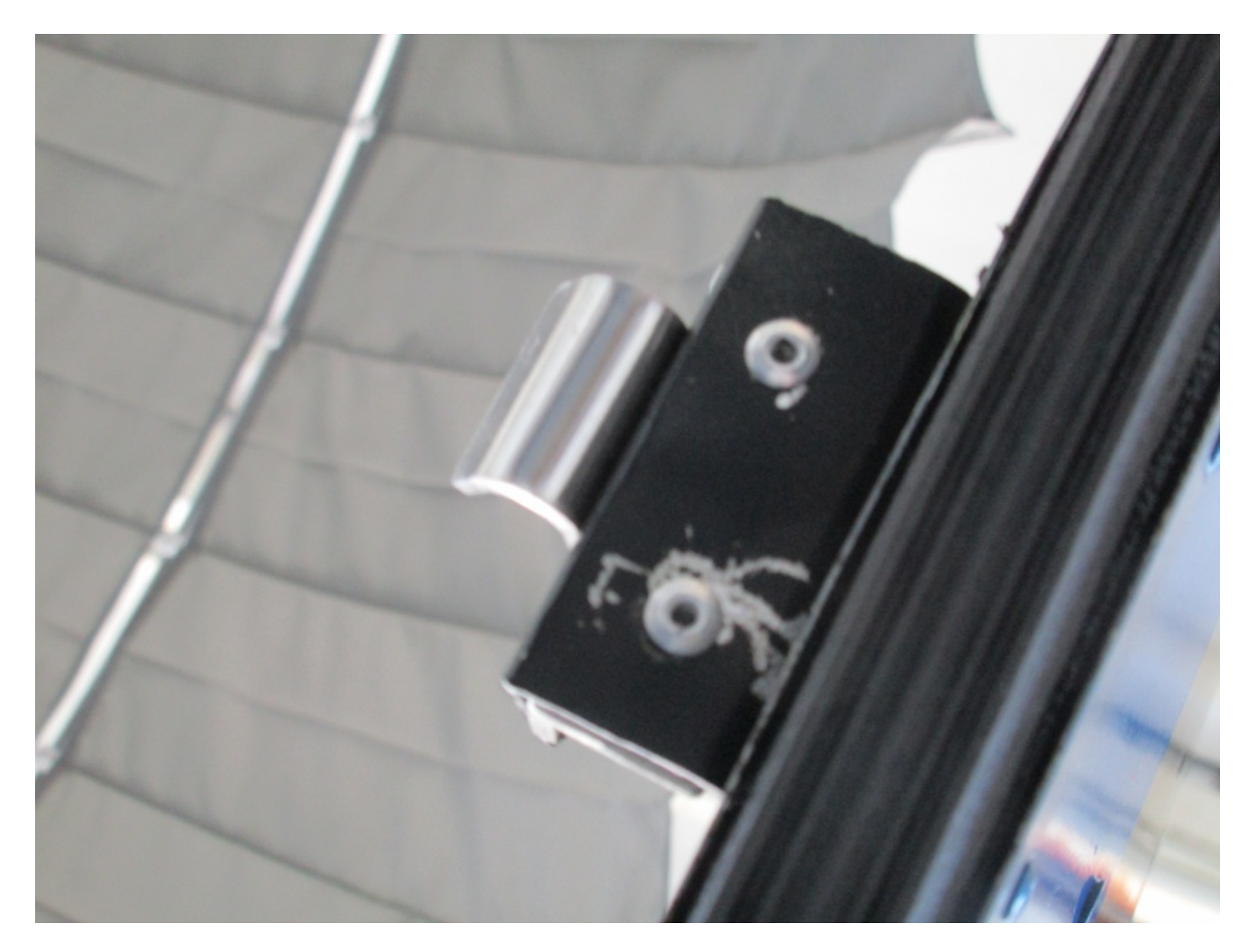
Photo 4 - Secondary Latching System Installed By Pilot/Builder