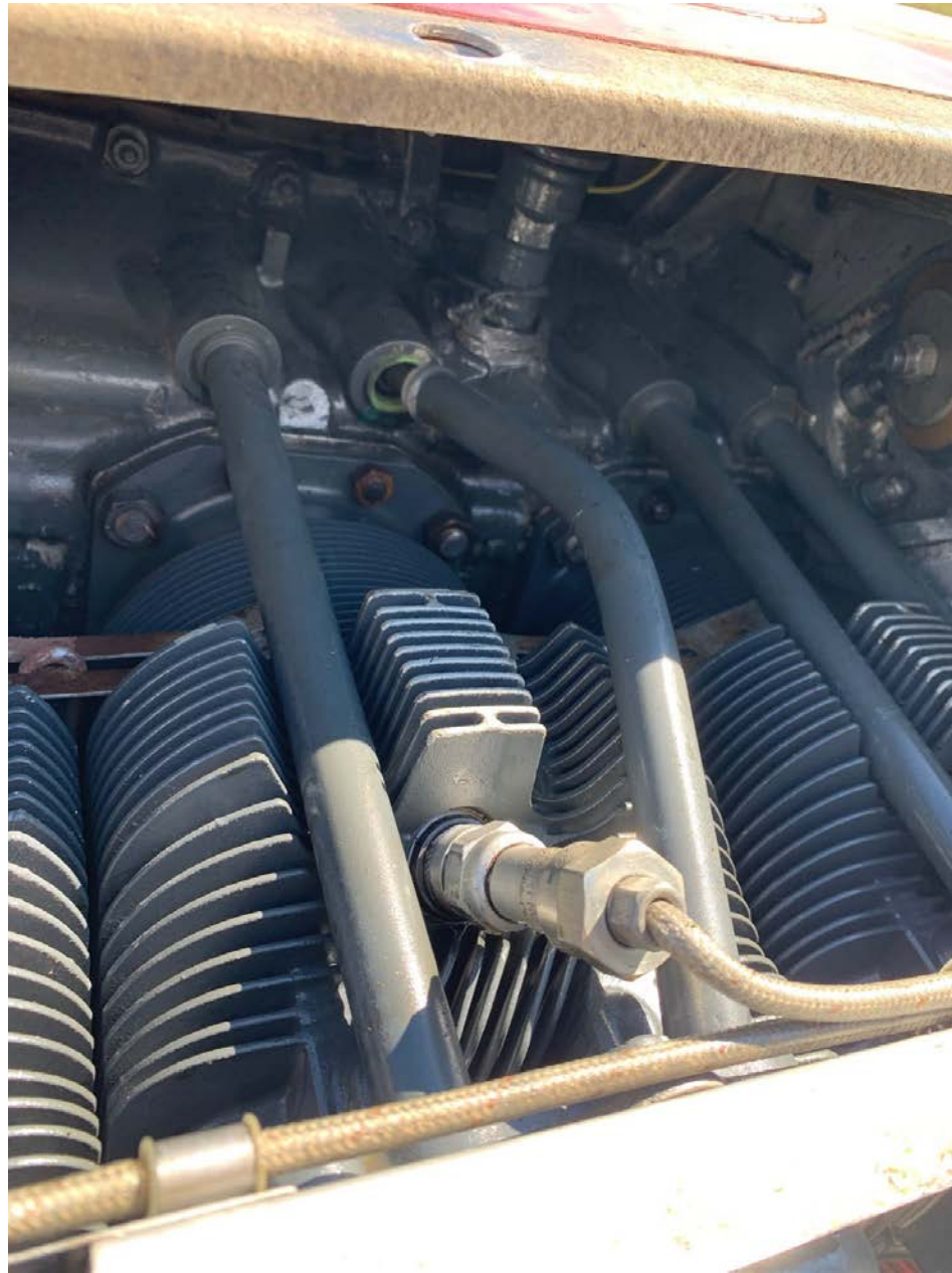
Photo 1 – Bent No. 4 Cylinder Exhaust Push Rod