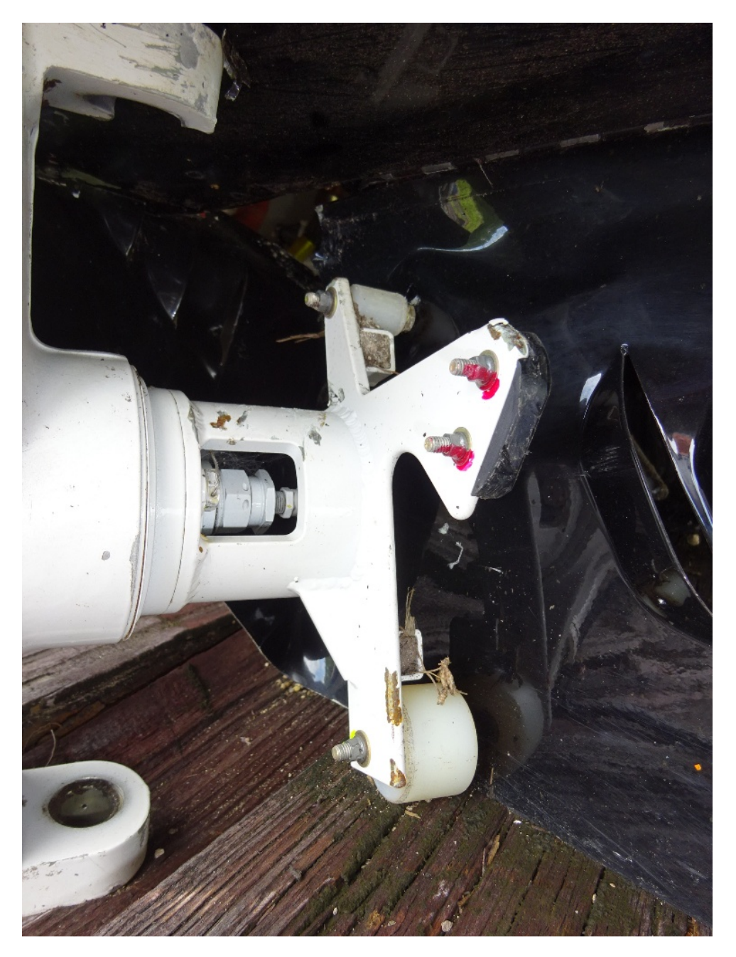
Photo 5 – Steering Horn Assembly