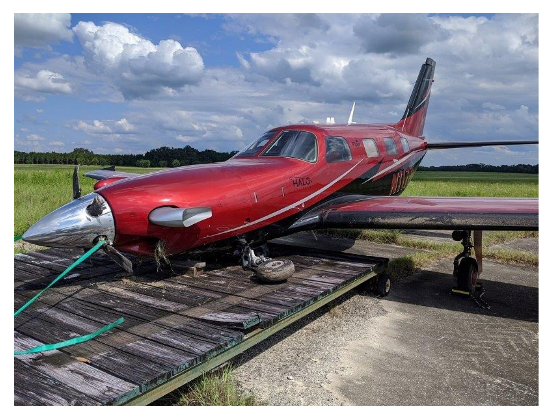
Photo 2 – Main Wreckage Recovered