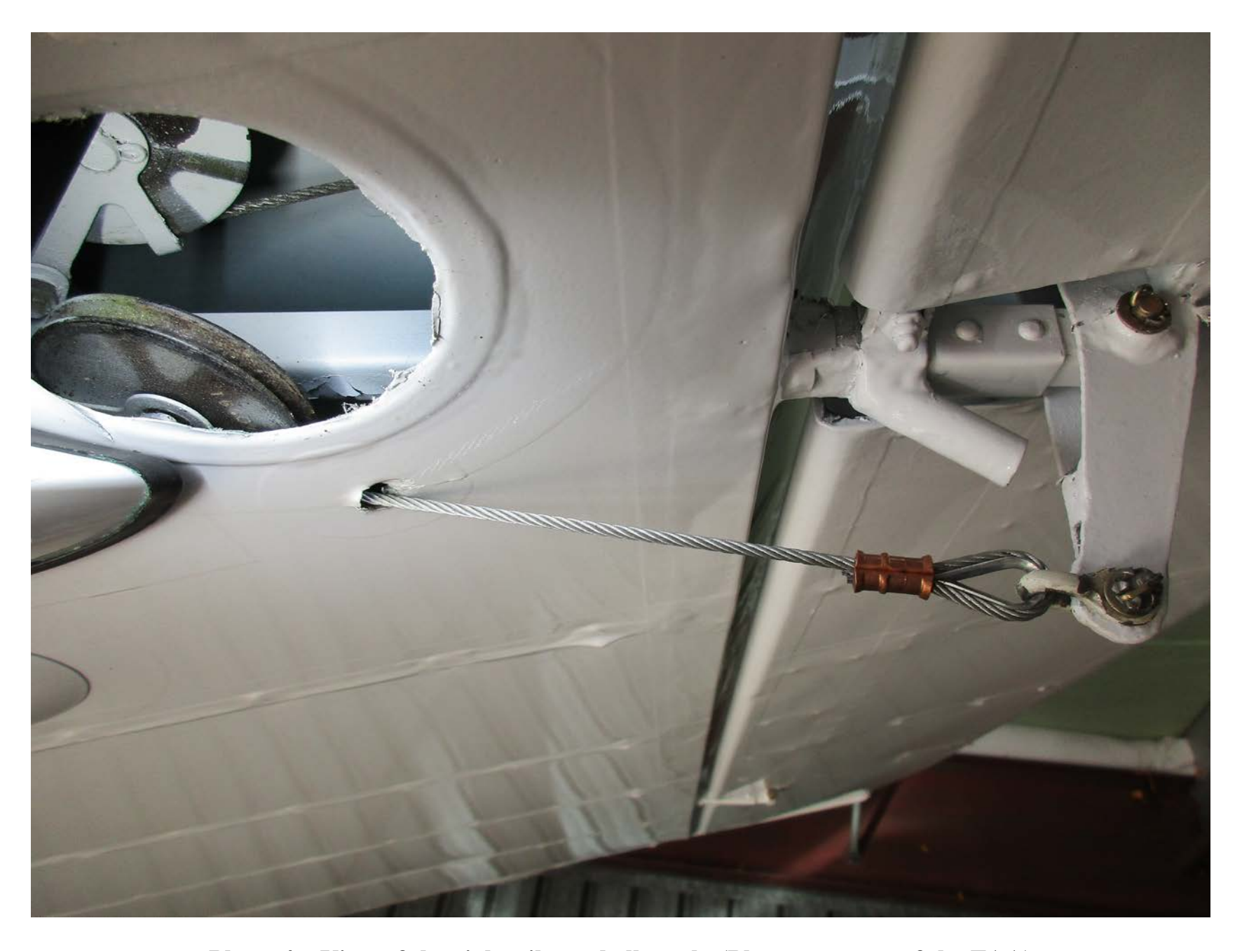
Photo 4-View of the right aileron bellcrank.