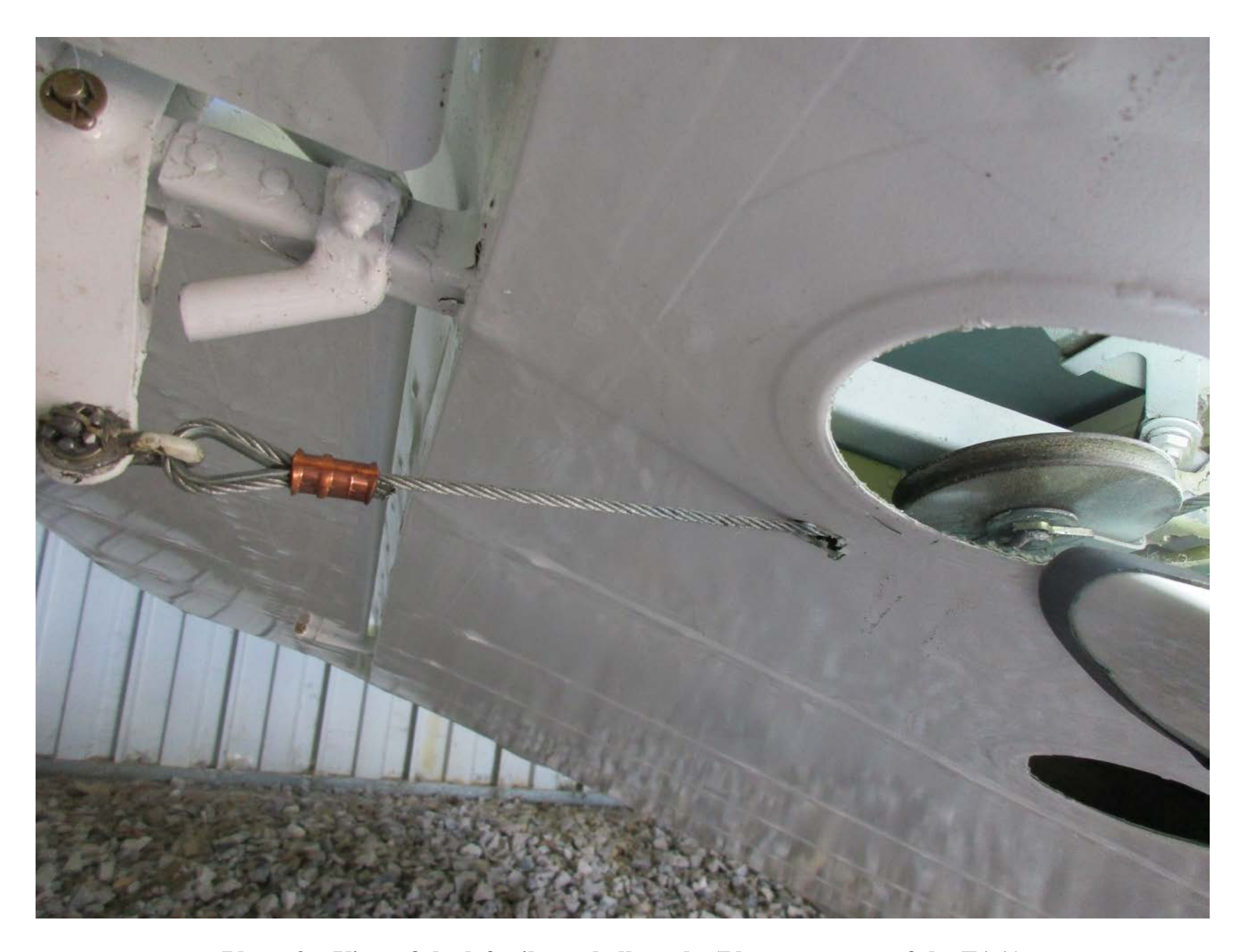
Photo 3-View of the left aileron bellcrank.