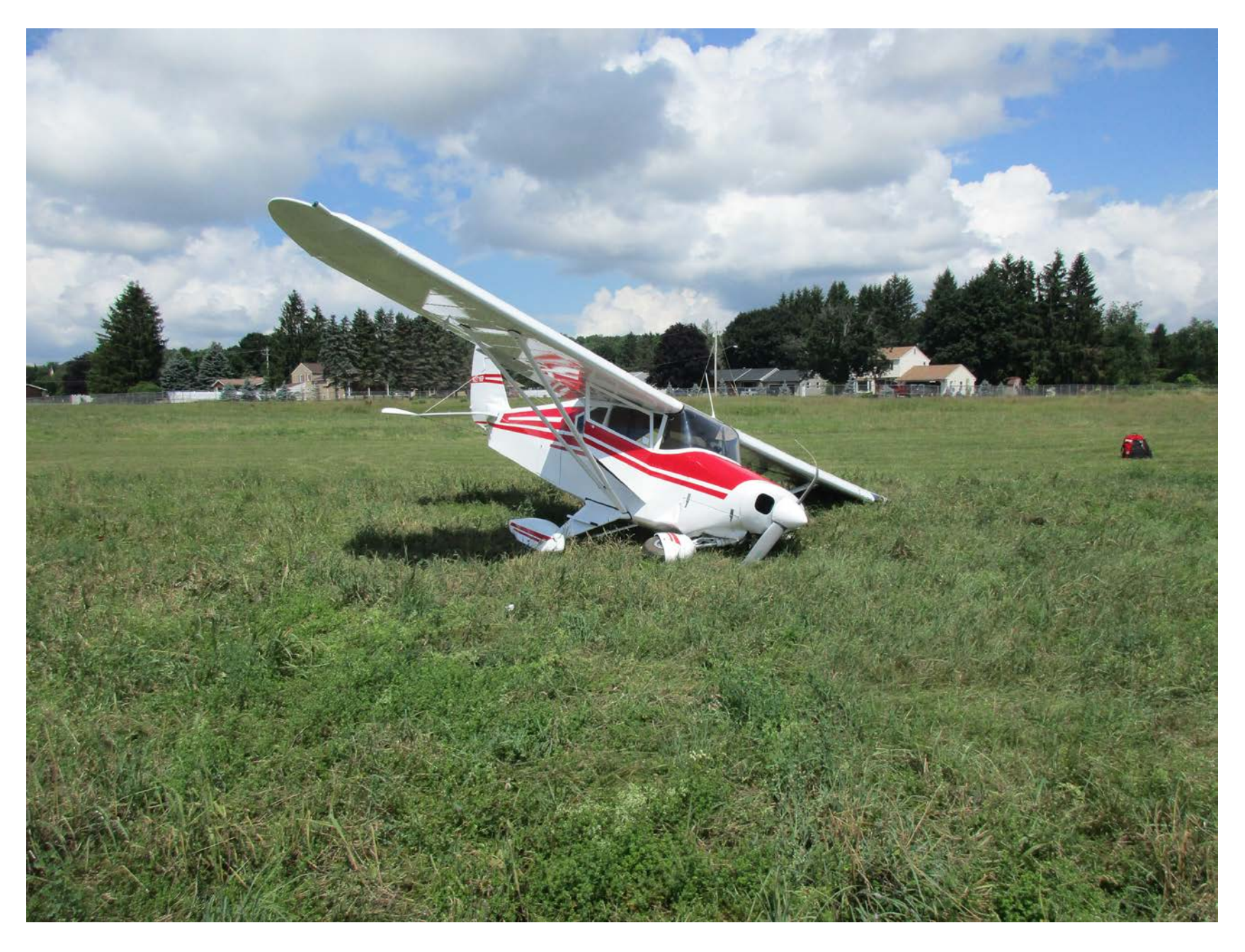
Photo 1-Front\ right\ view\ of\ the\ airplane.