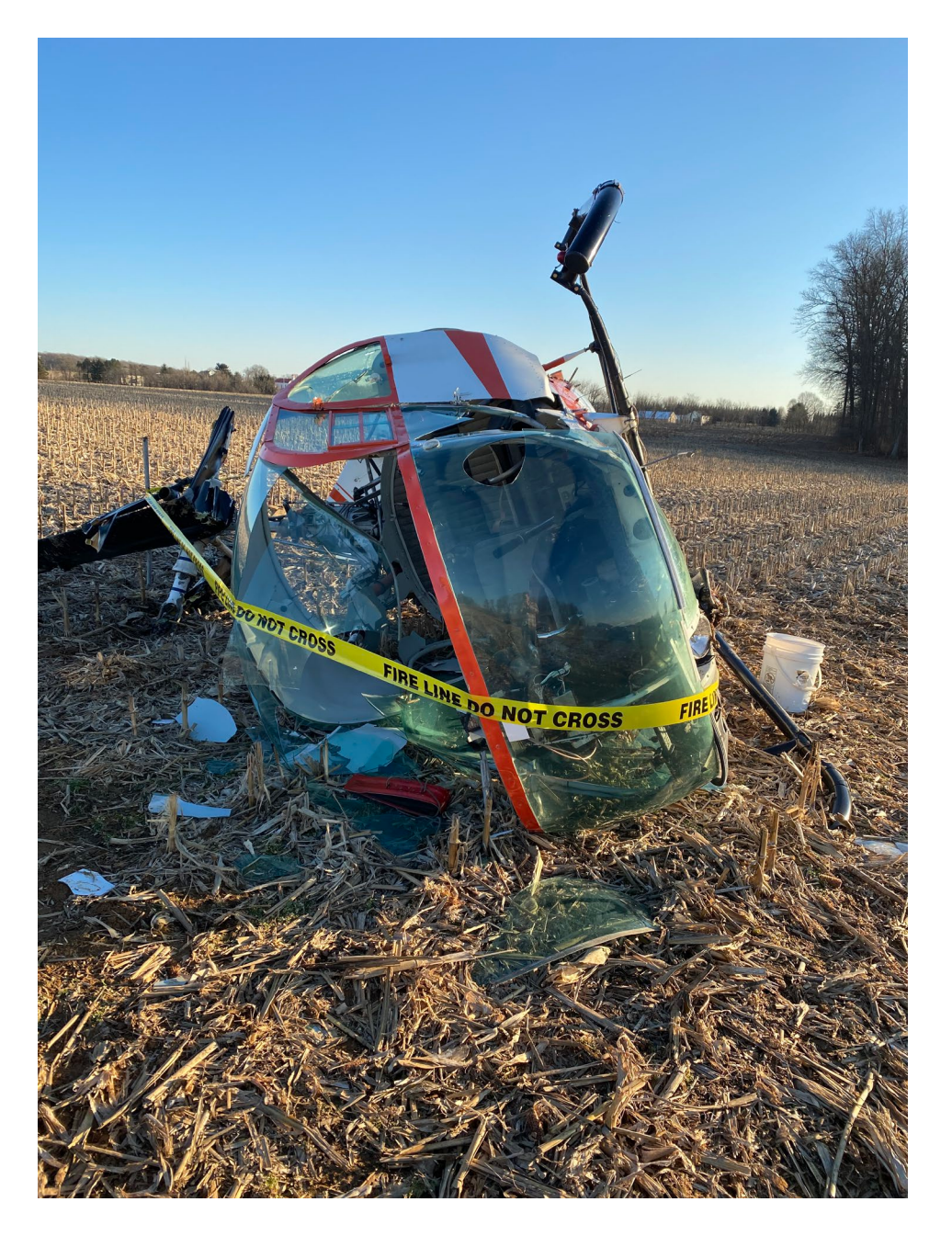
Photo 1 – View of helicopter showing airframe damage and resting on the left side.