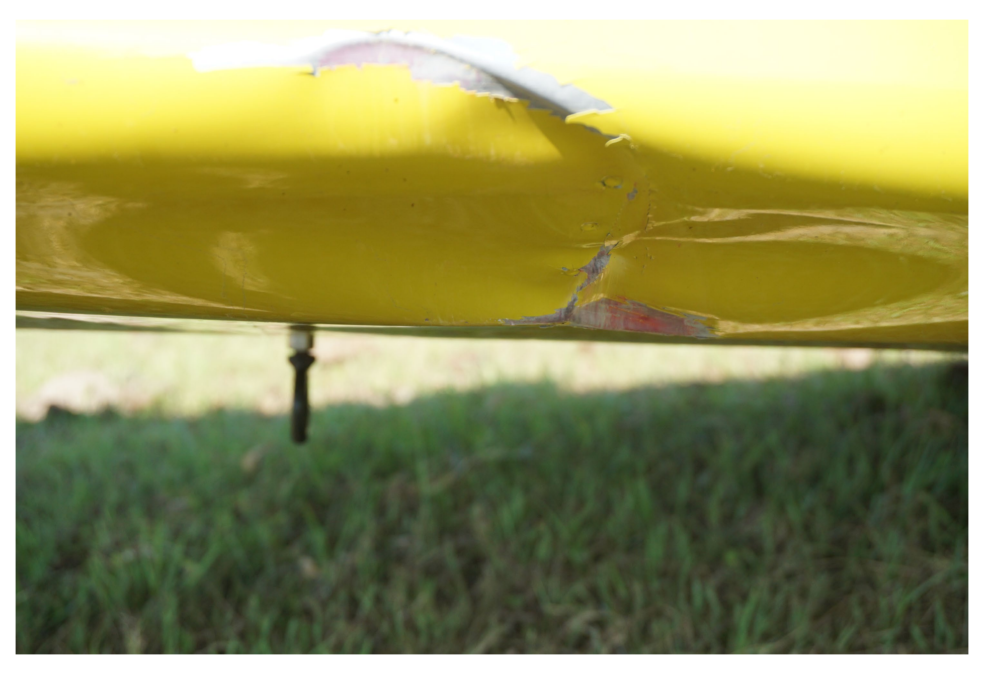
Photo 7 – View of red paint transfer on leading edge of right wing.