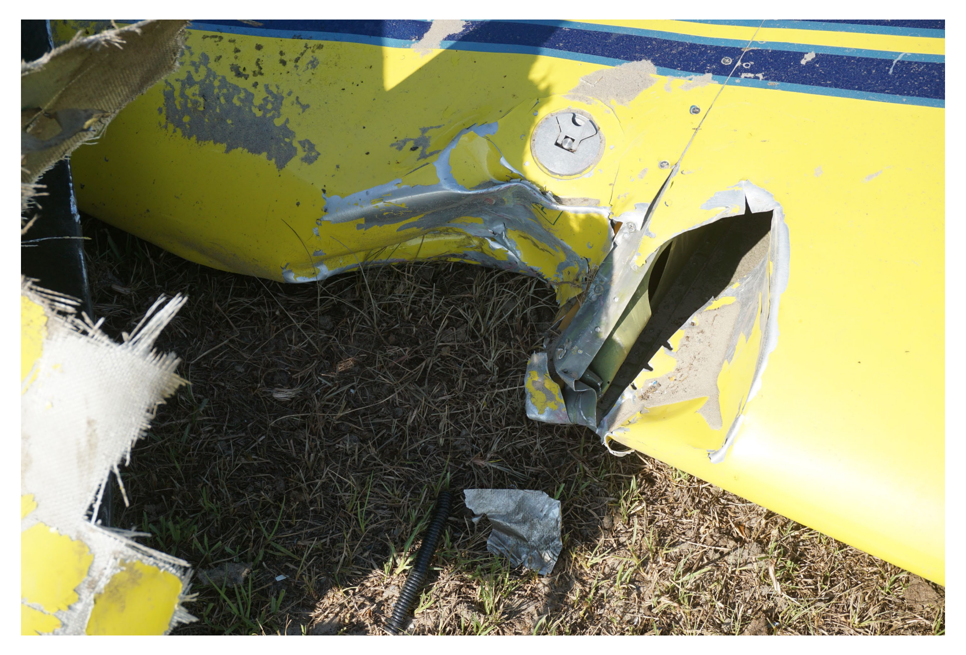
Photo\, 6-View\ of\ semicircular\ damage\ on\ leading\ edge\ of\ left\ inboard\ wing.