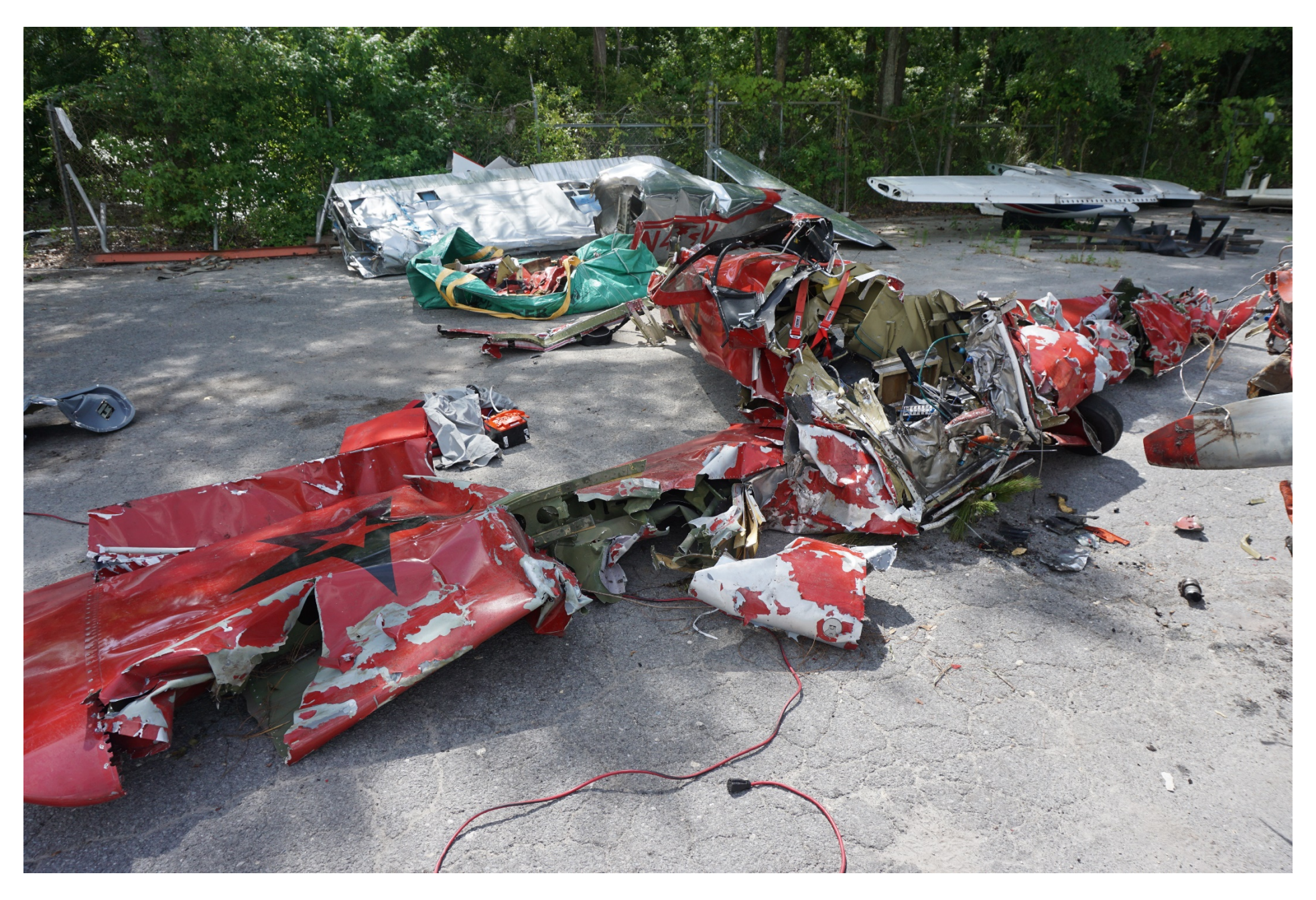
Photo 2 – View of N319RL after wreckage recovery, showing structural damage.