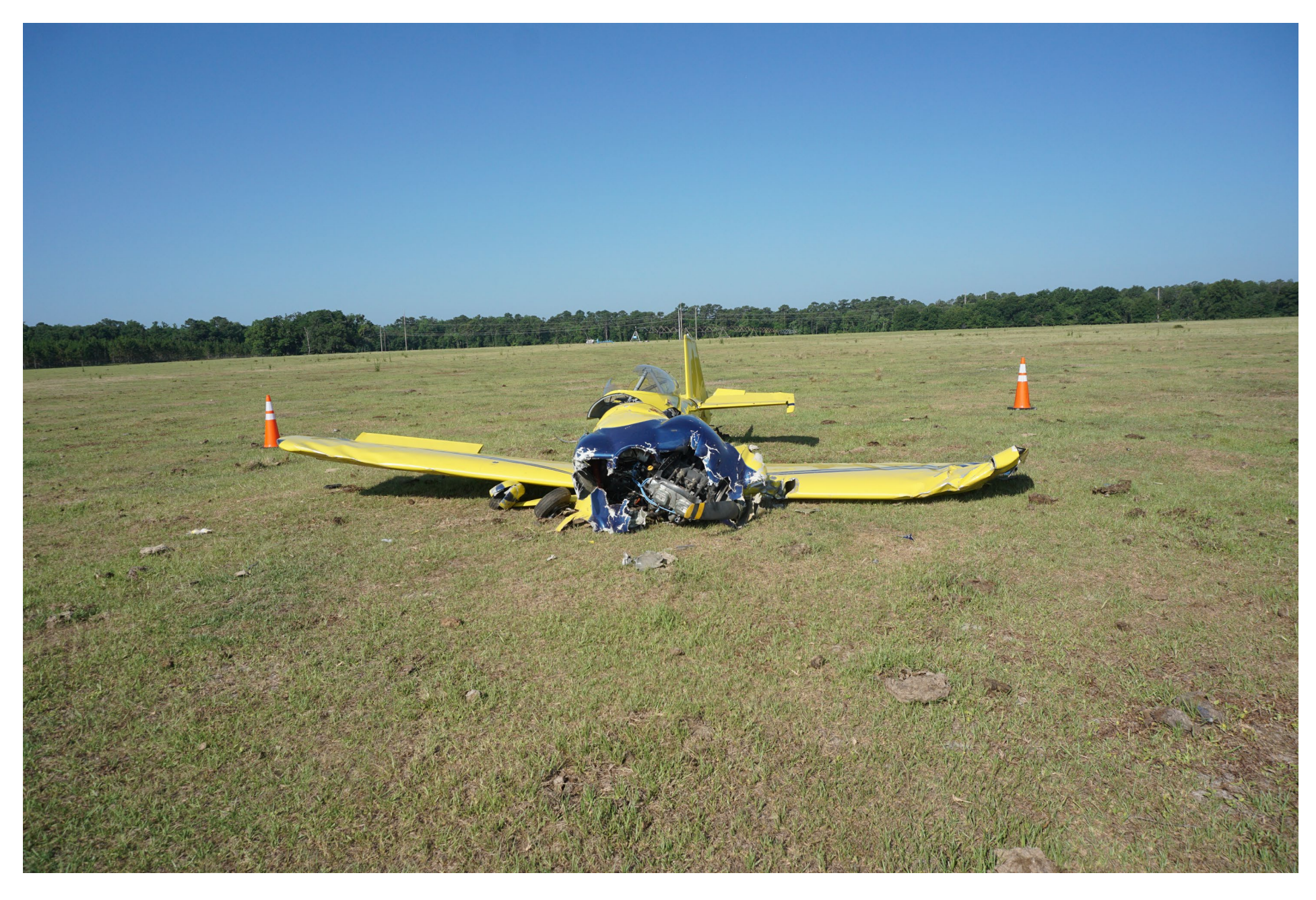
Photo \, 5-View \, of \, N203DD \, in \, field \, showing \, structural \, damage \, throughout \, aircraft.