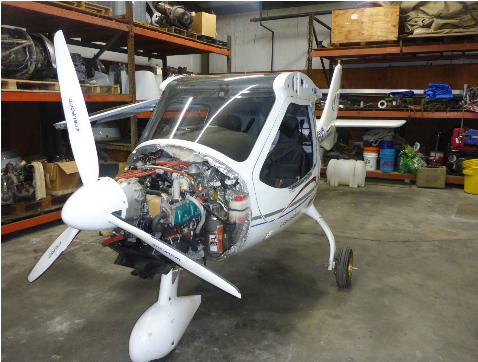
Photo 1: View of the airplane as found at Atlanta Air Salvage