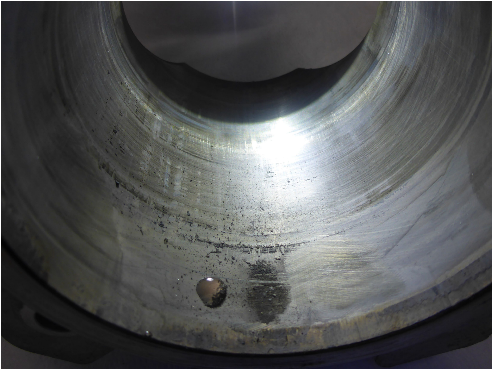
Photo 5: Number 3 cylinder with metallic debris and no oil.