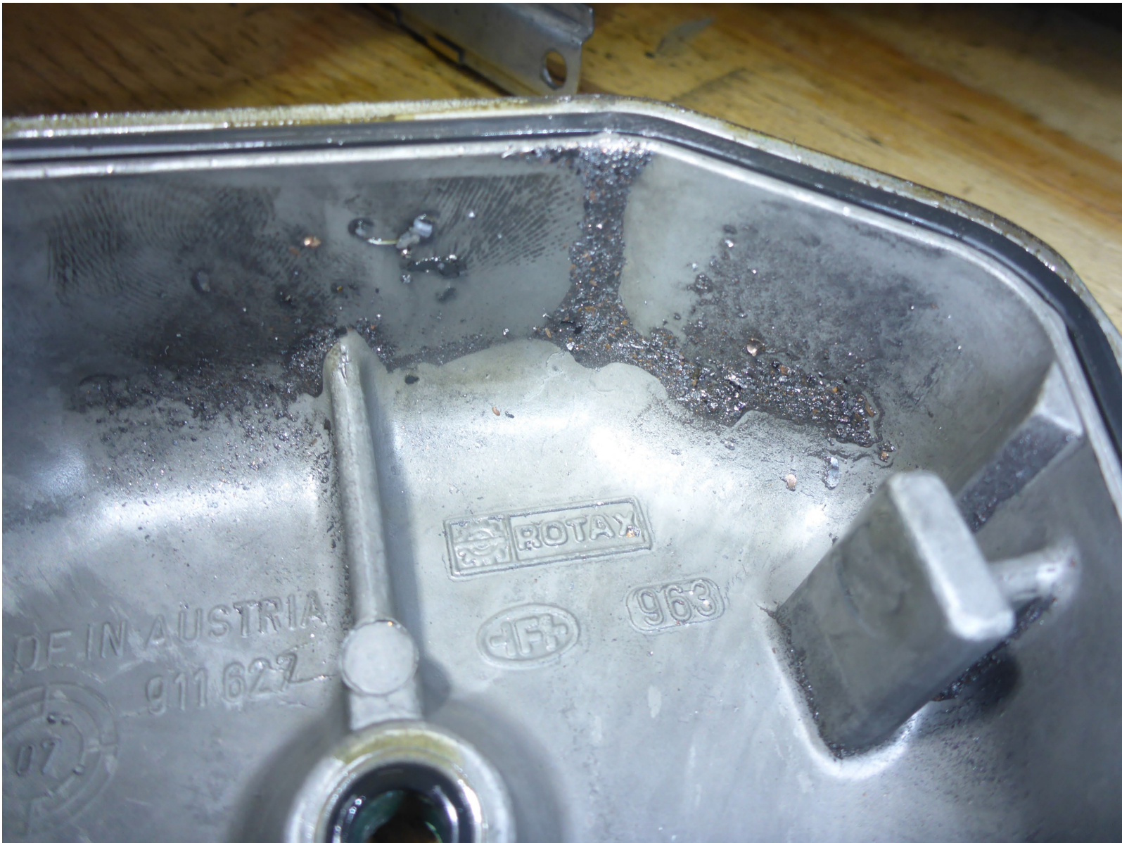
Photo 3: Number 1 rocker cover with metallic debris inside.