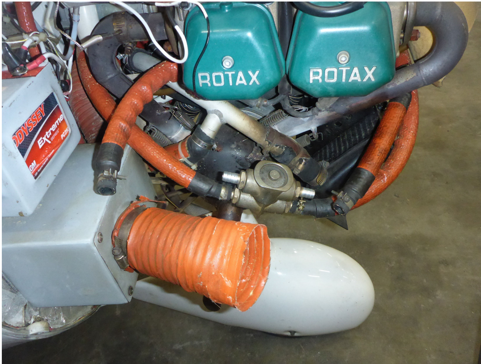
Photo 2: View of the oil thermostat and oil hoses.