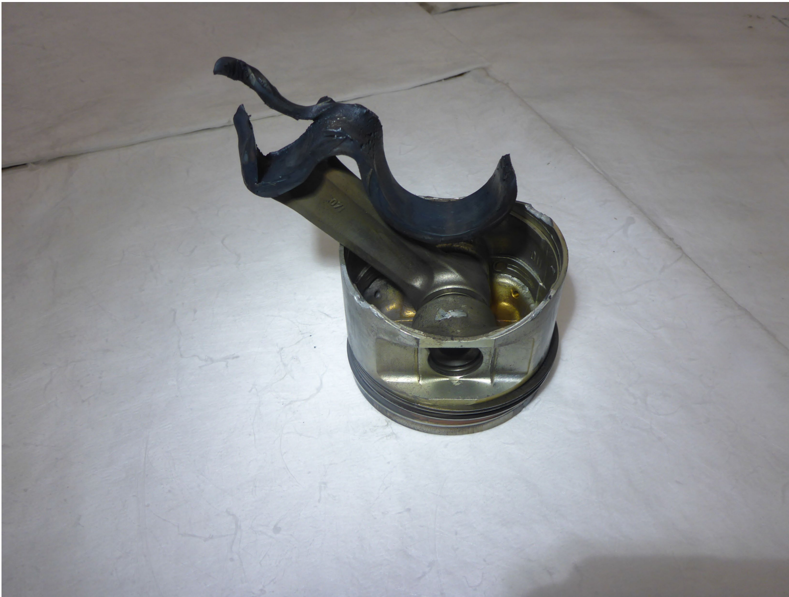
Photo 6: Number 3 connecting rod bearing, connecting rod, and piston