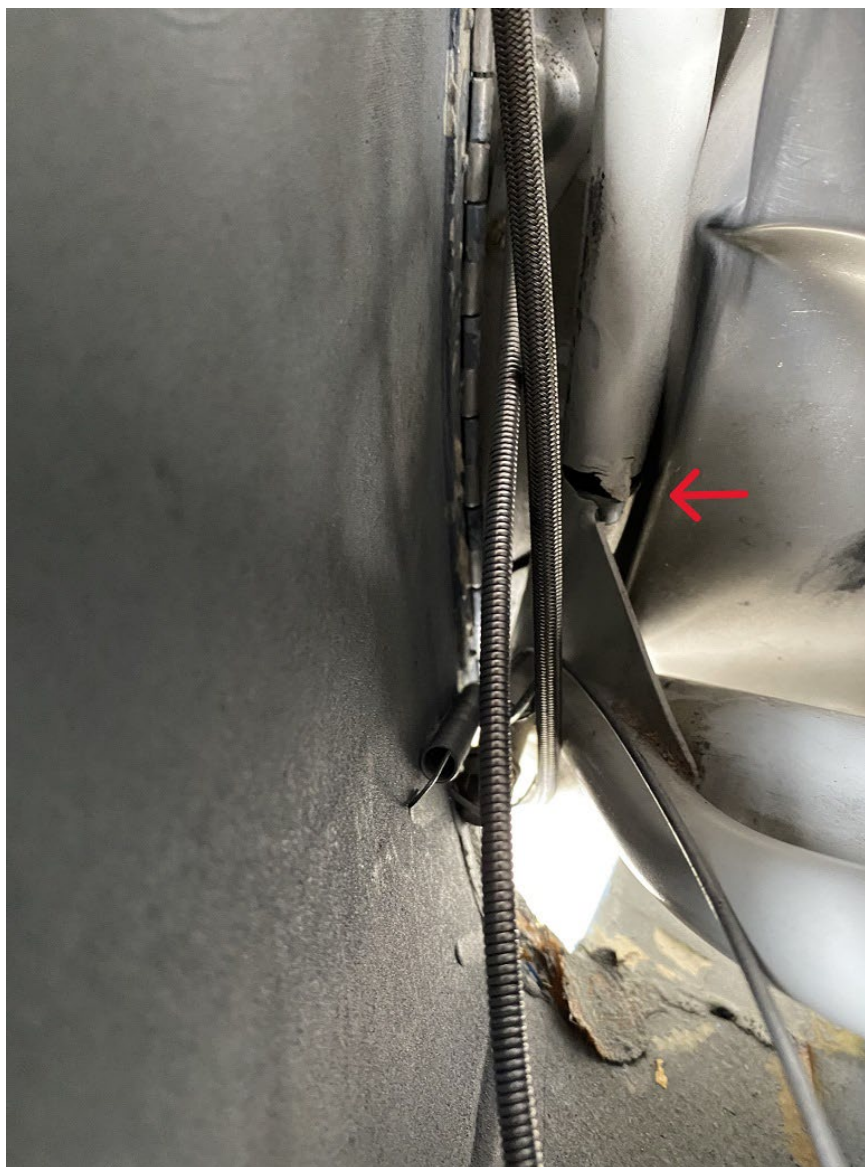
Photograph 5 - Third Separated Frame Tube