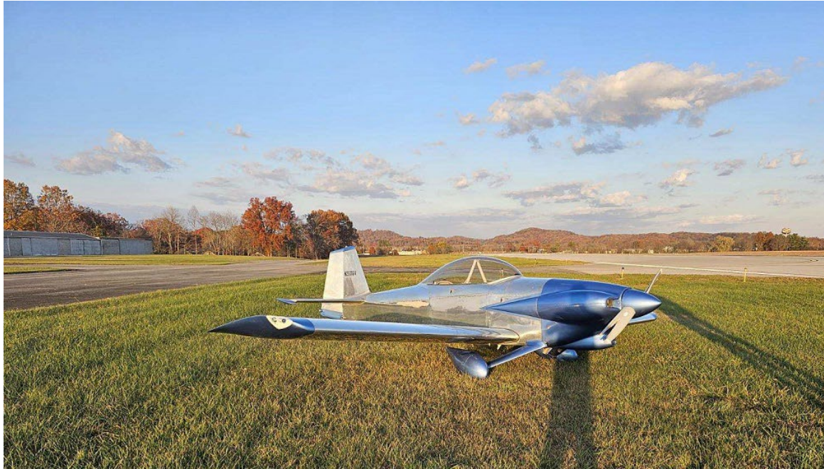
Photograph 1 - Main Wreckage