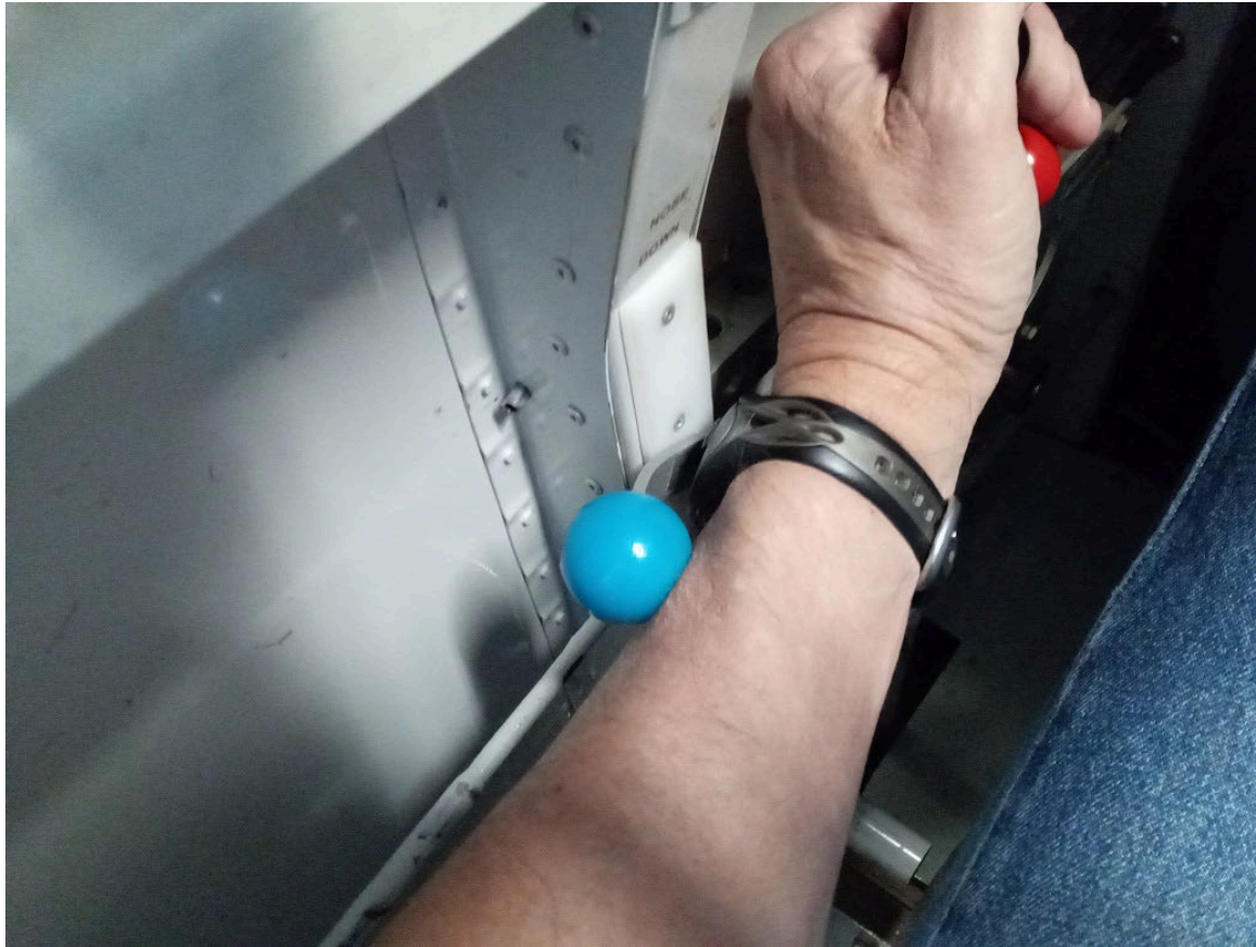
Photograph 6 - Elevator Trim Control