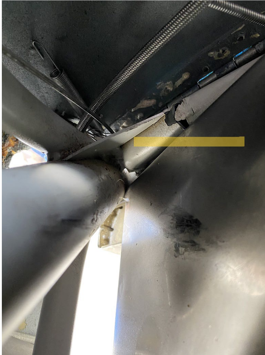
Photograph 3 - Separated Frame Tube