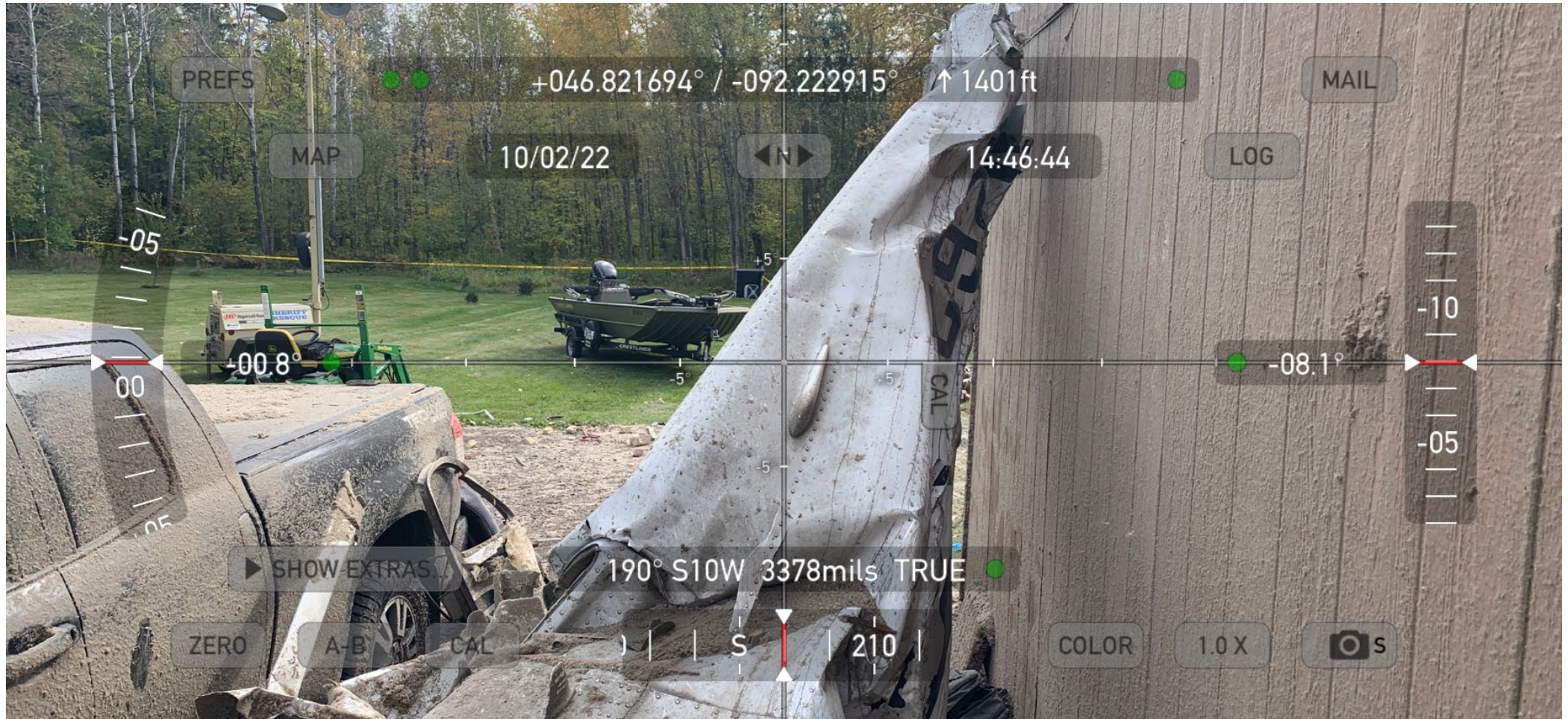
Photo 3: View of main wreckage site detailing latitude, longitude, magnetic heading and elevation.