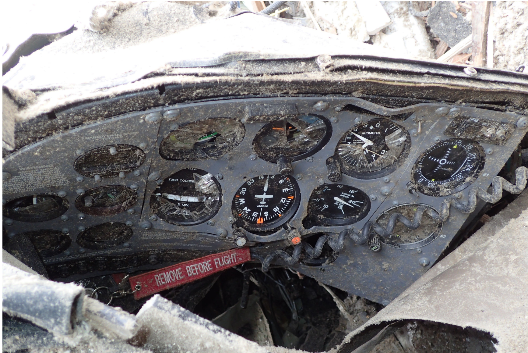
Photo 9: View of cockpit instrument panel at accident site.