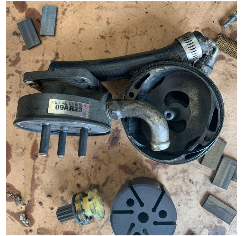
Photos 11, 12, 13: View of attitude indicator, turn coordinator and vacuum system after removal.