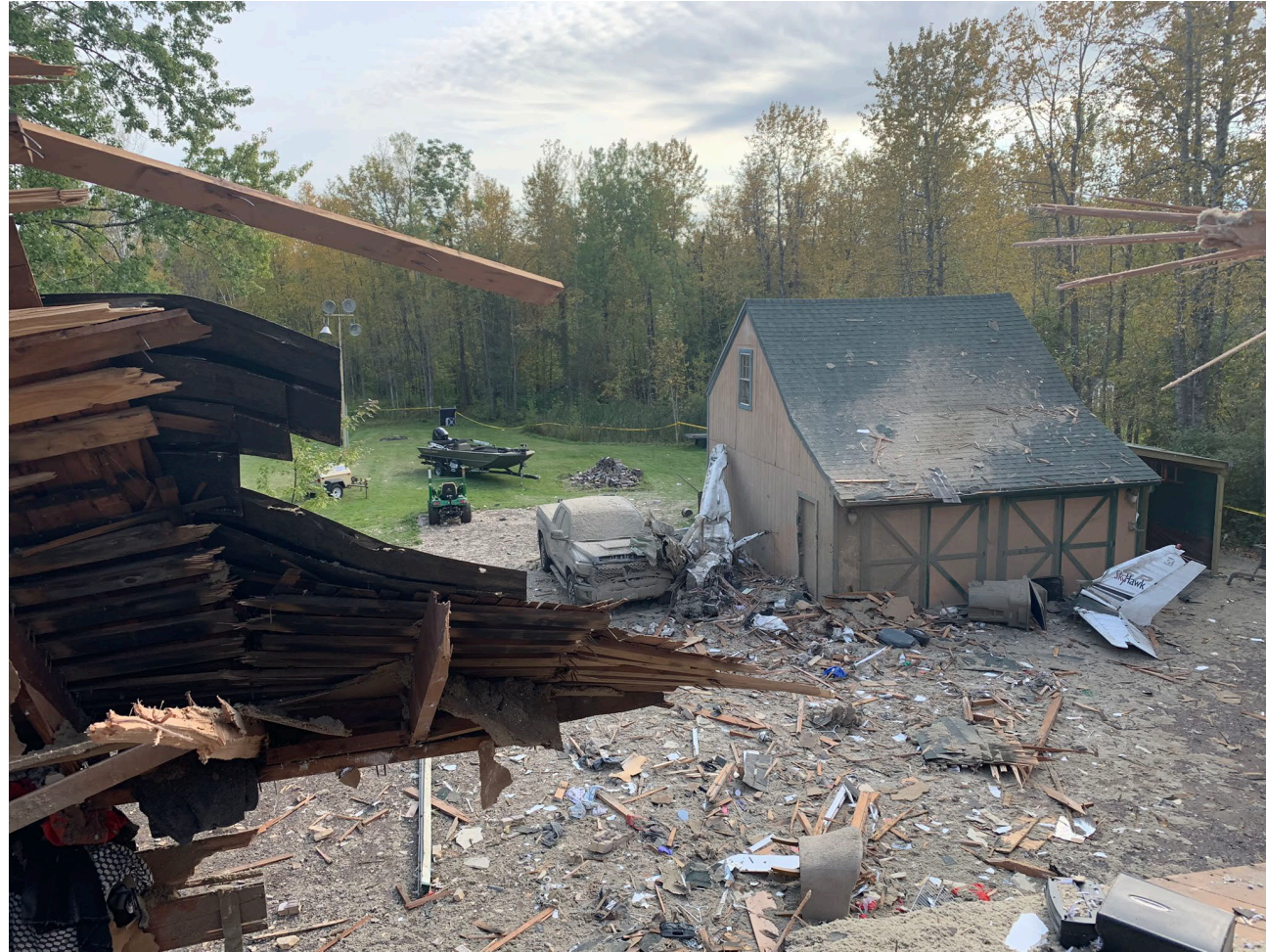
Photo 6: View of main wreckage site taken from second story floor of house.