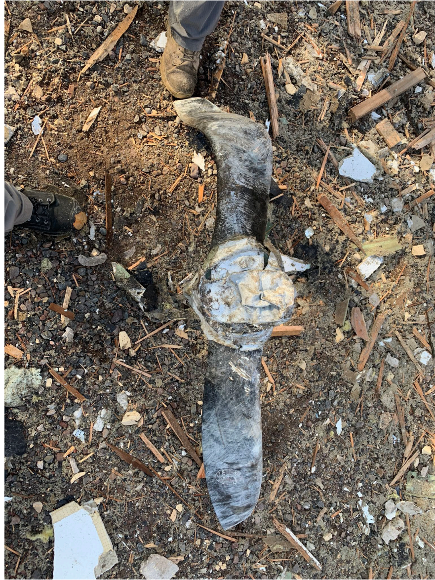
Photo 7: View of propeller assembly showing both blades and crushed spinner. Note the s-bending and chordwise scraping.