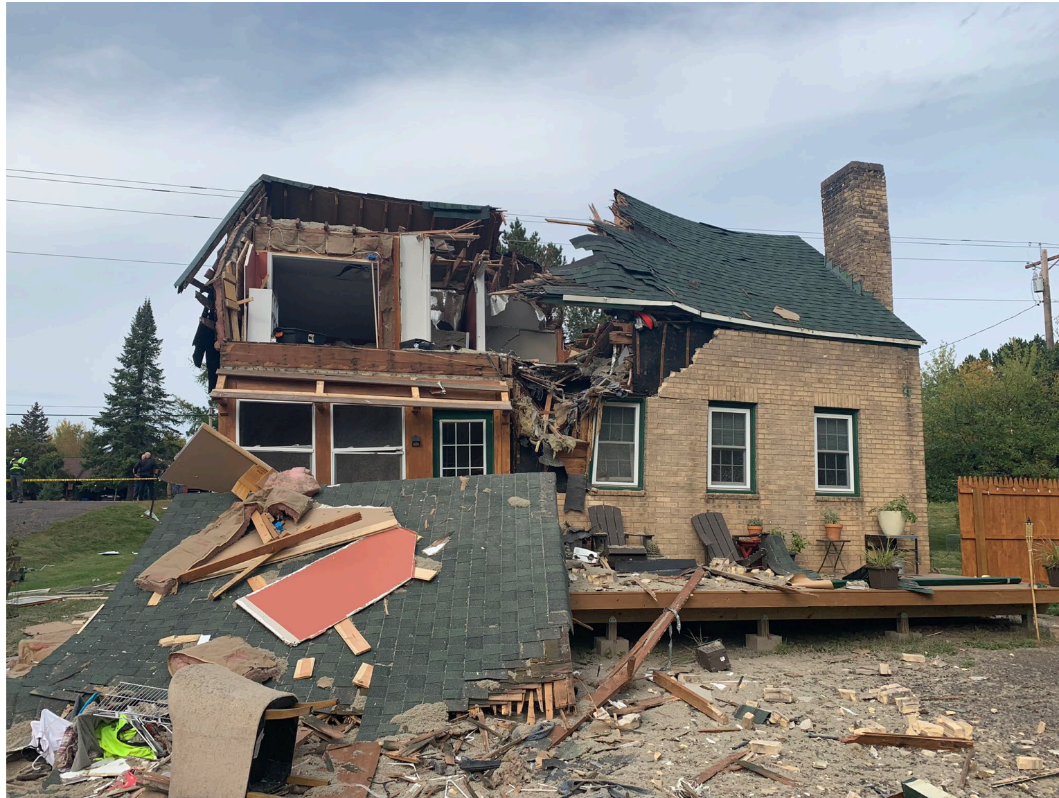
Photo 2: View of backside of damaged home where the airplane exited.