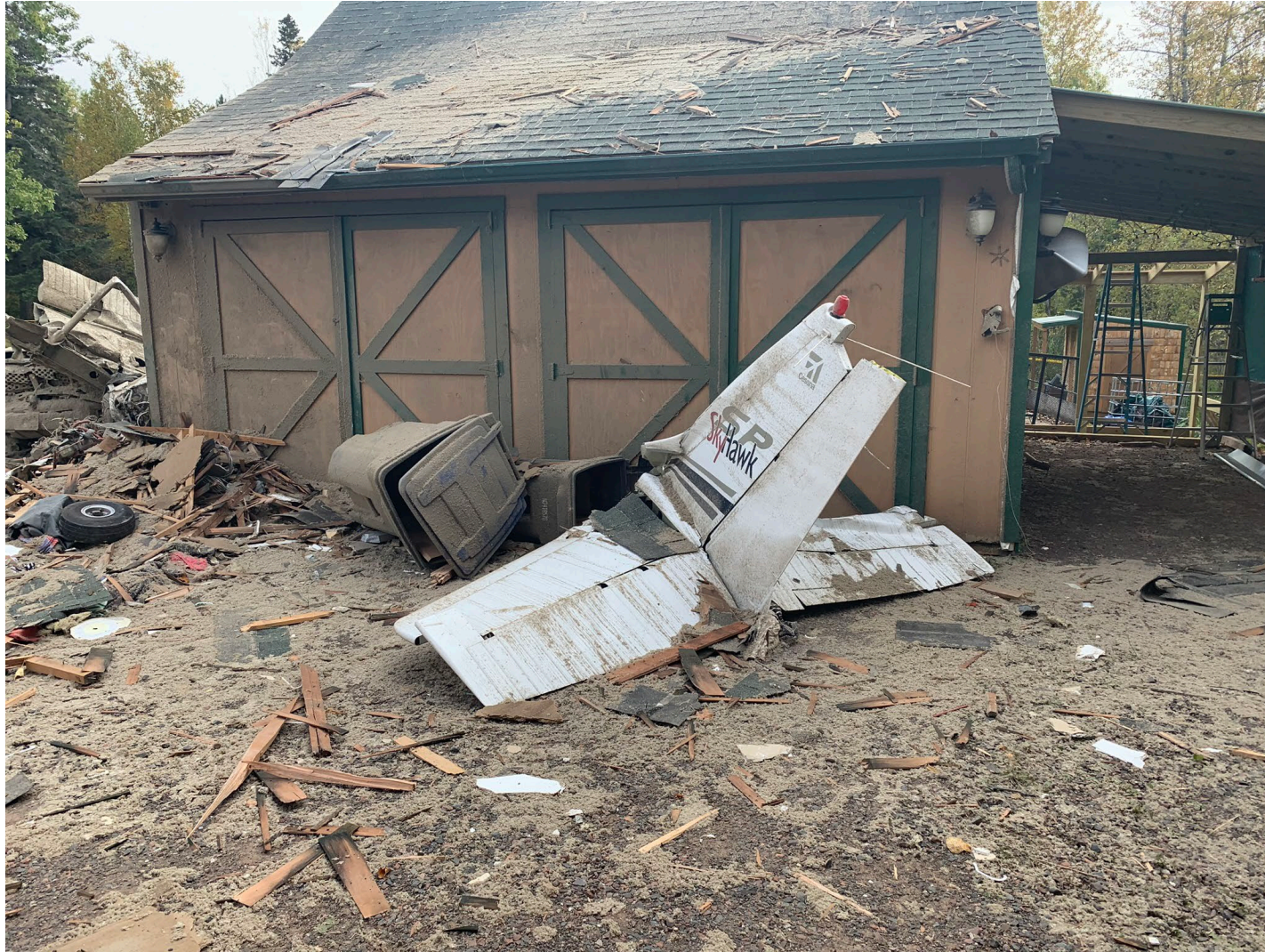
Photo 4: View of horizontal and vertical stabilizer up against garage with their respective control surfaces still in place.