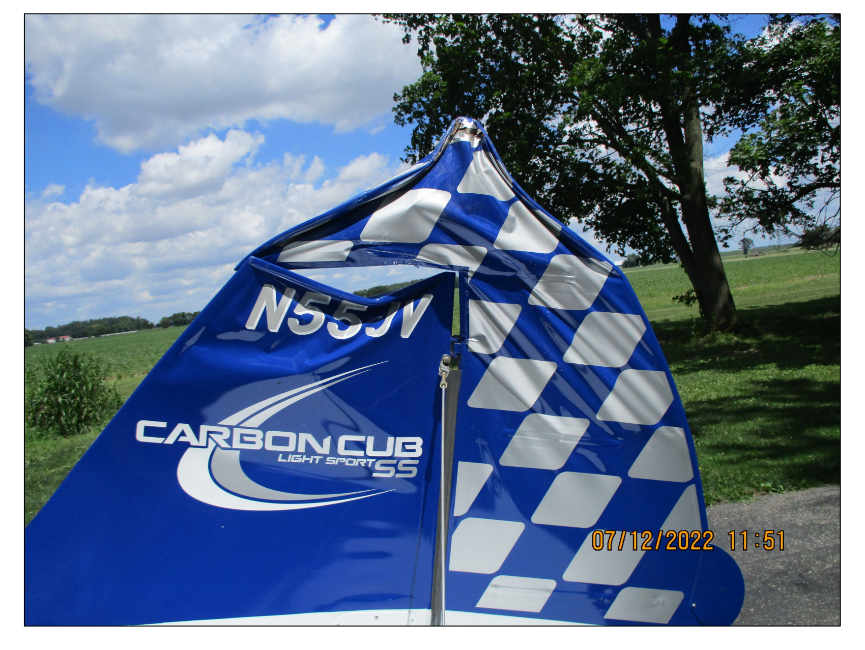
Photo 4: View of the substantial damage sustained to the vertical stabilizer and rudder