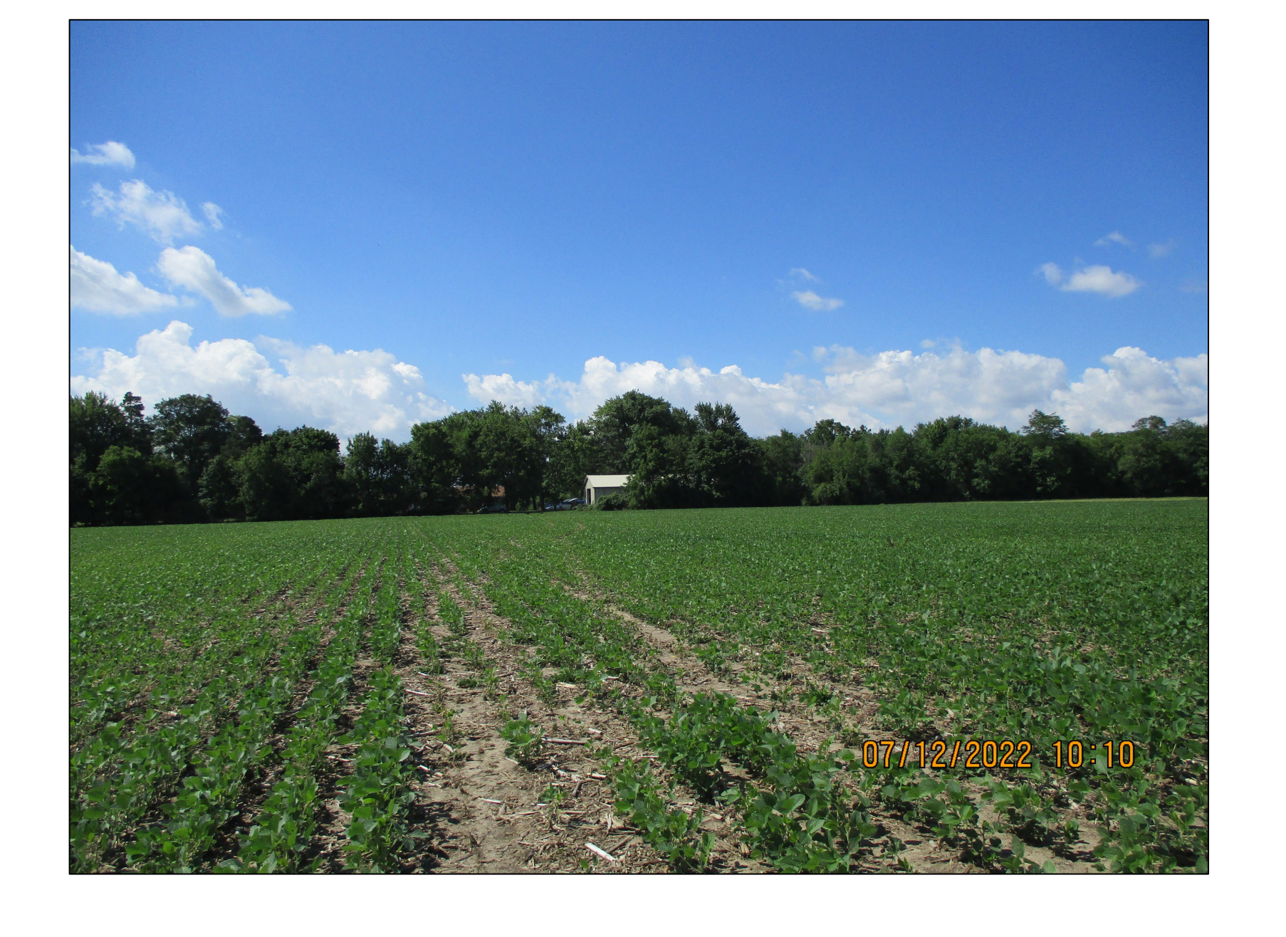
Photo 2: Overview of the farm field that was used for takeoff