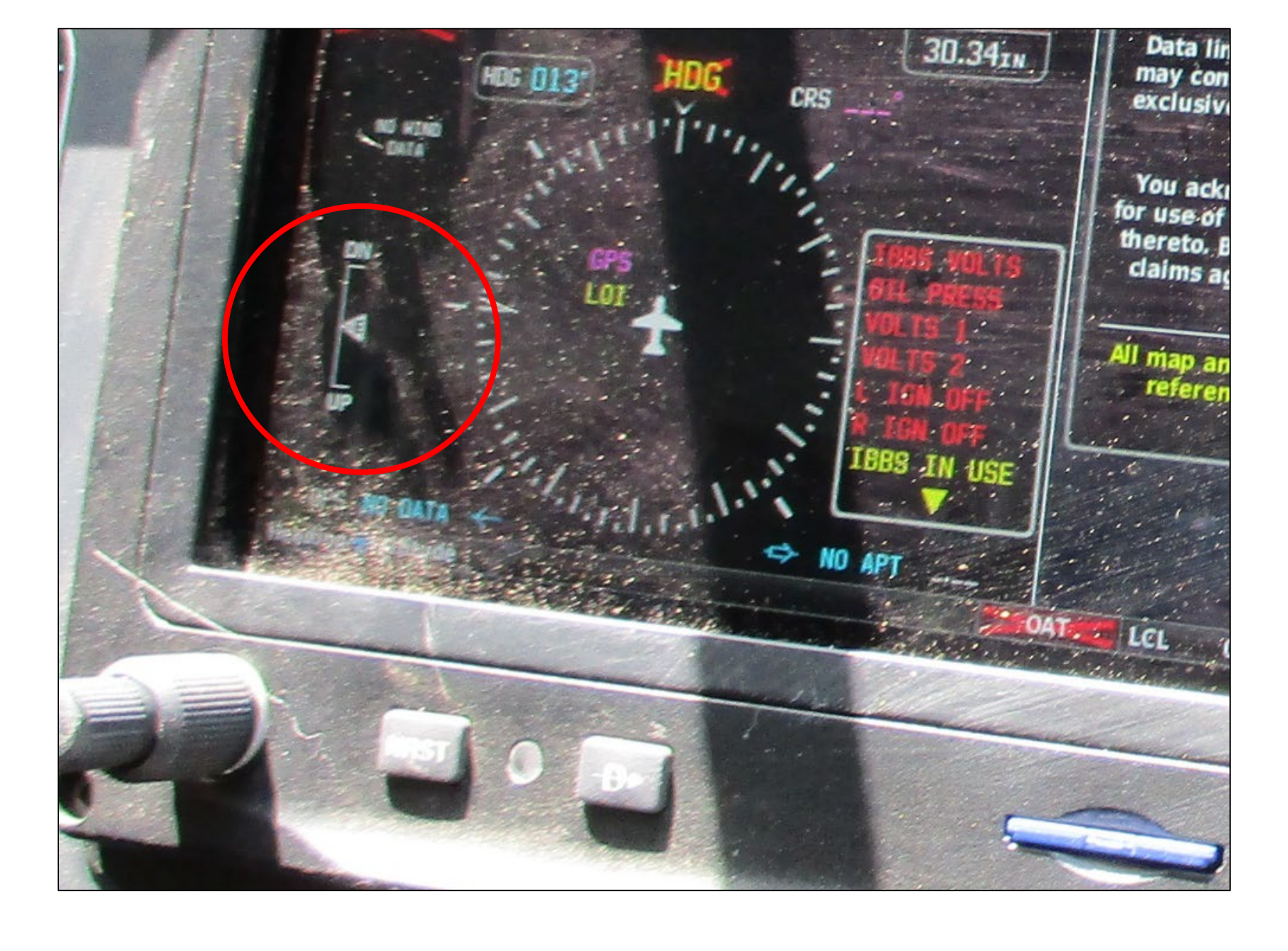
Photo 7: View of the nose UP/DOWN horizontal trim positioned to neutral