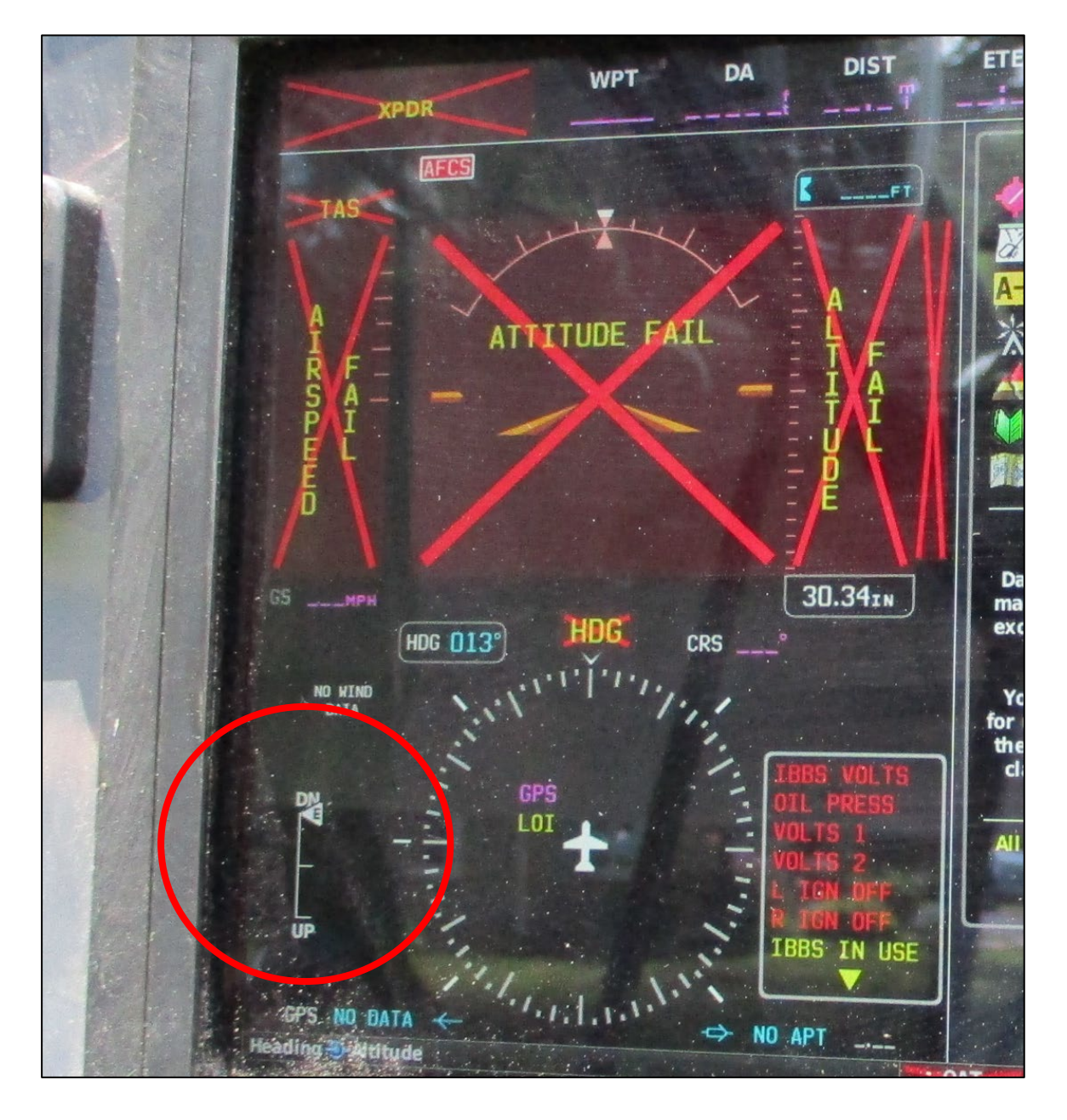
Photo 6: View of the nose UP/DOWN horizontal trim positioned to full nose down