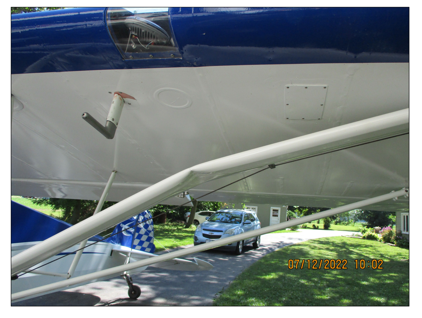
Photo 3: View of the substantial damage sustained to the left wing lift strut