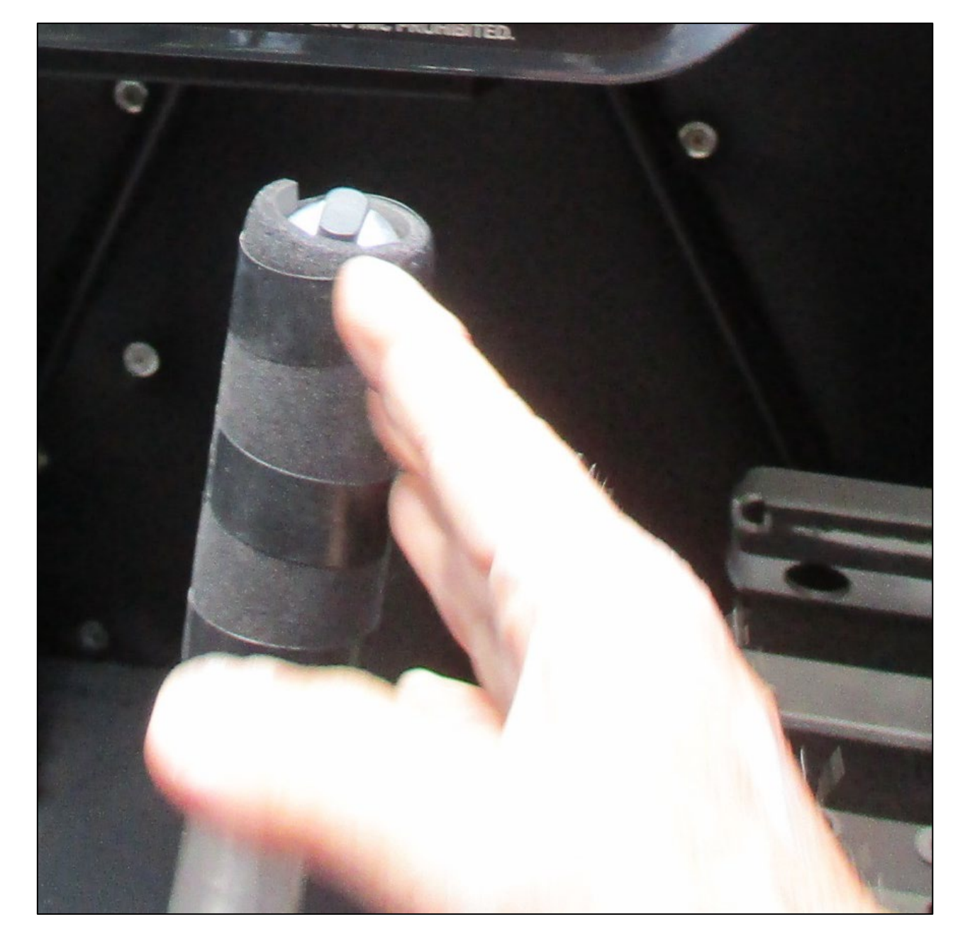
Photo 5: View of the forward seat control stick and rocker trim switch