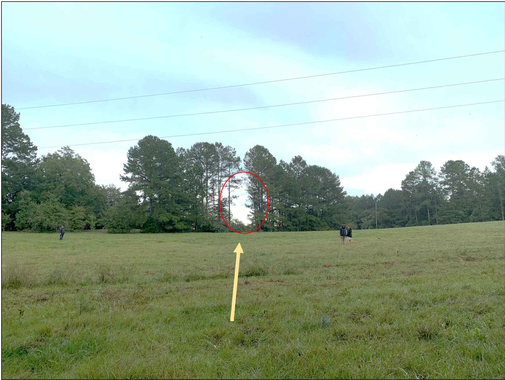
Photo 6: View of the approach path through trees. The arrow represents the approach path direction.