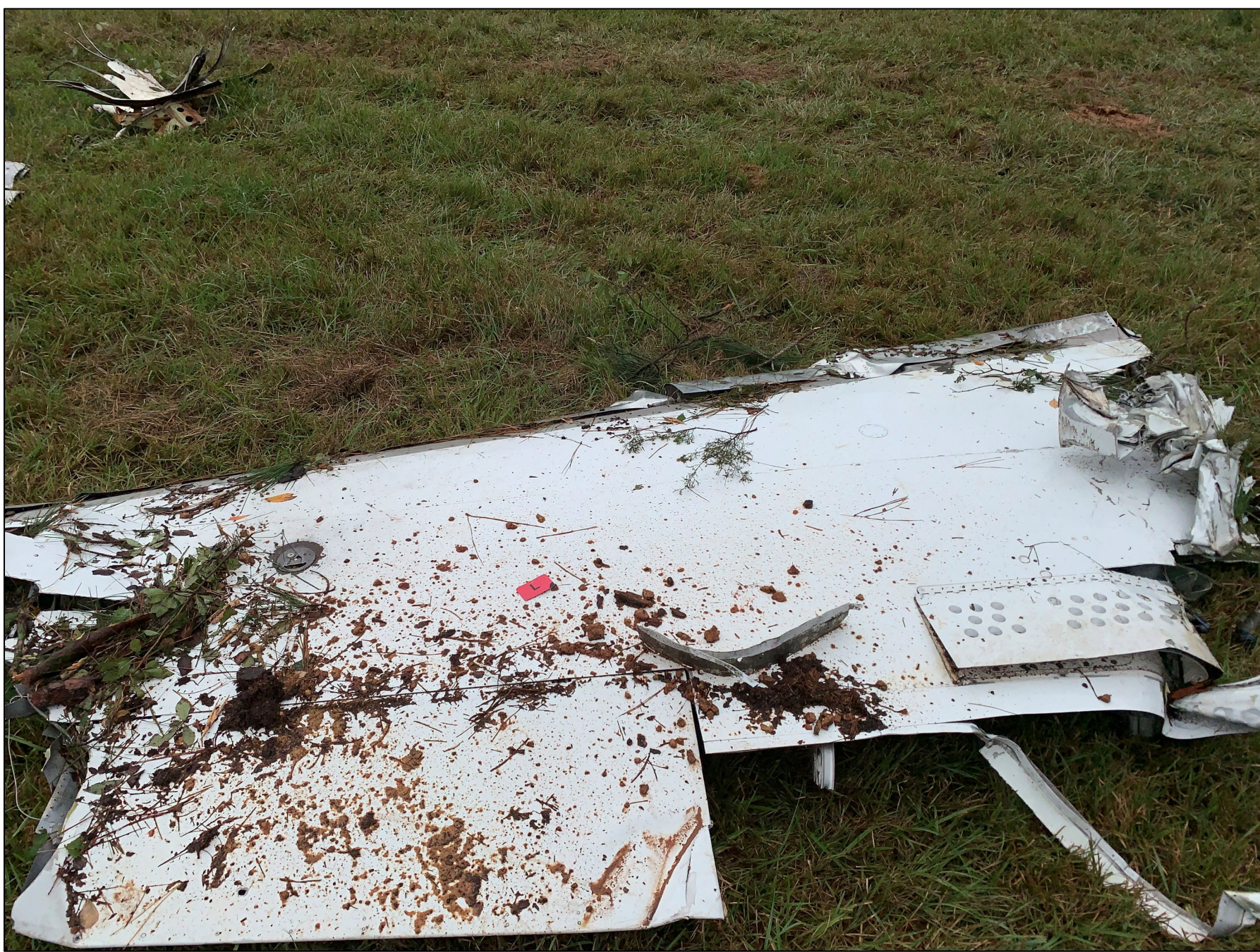
Photo 5: Overview of the fragmented left wing and air brake partially extended