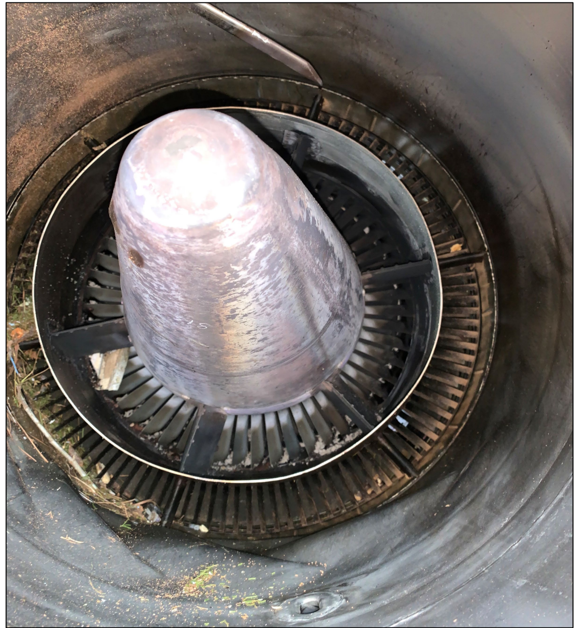
Photo 7, 8: View of left and right engine ingestion of forest elements