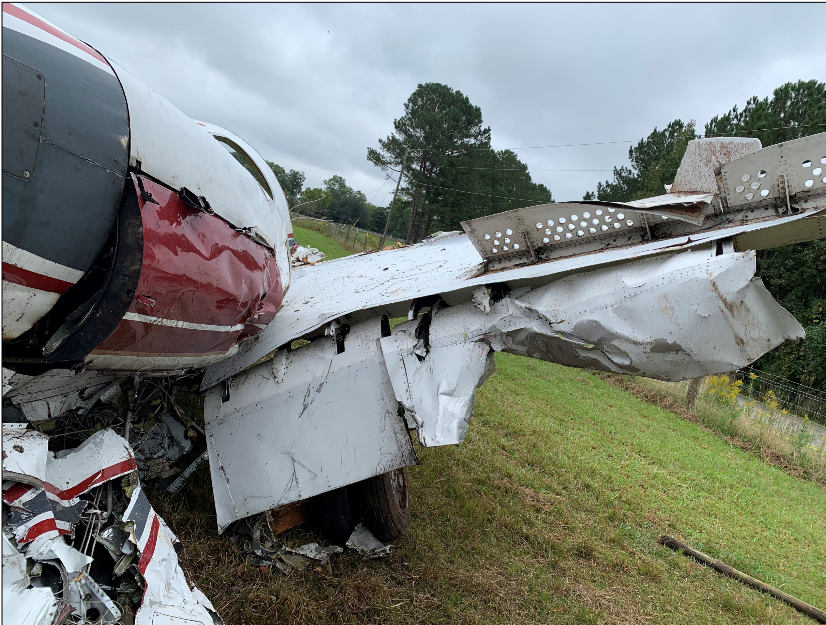
Photo 3: View of the right wing, flaps, and air brakes found deployed.