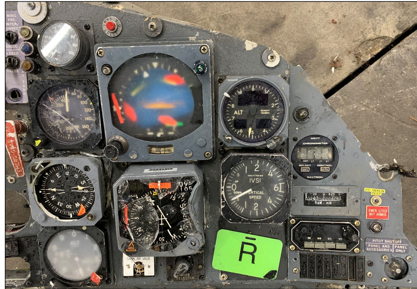
Photo 9, 10: View of the left and right cockpit panels as recovered during the layout and examination of wreckage.