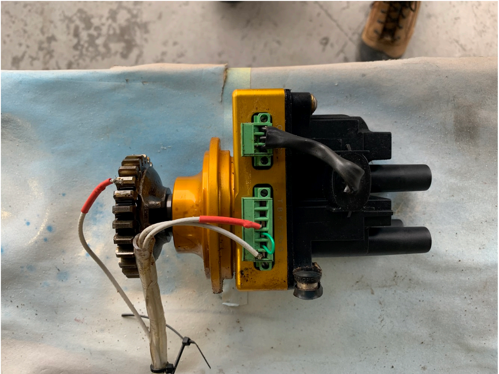
Photo 4 - Magneto