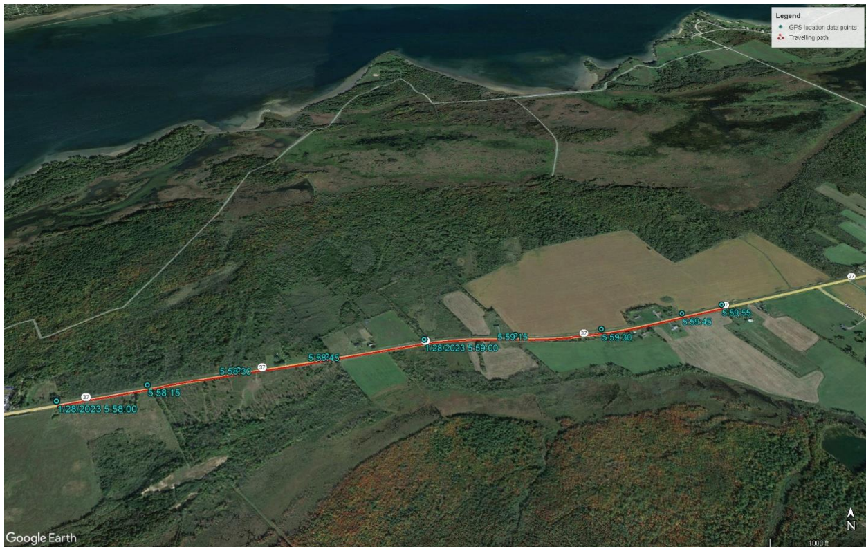
Figure 1. Google Earth overlay of the GPS location data points.