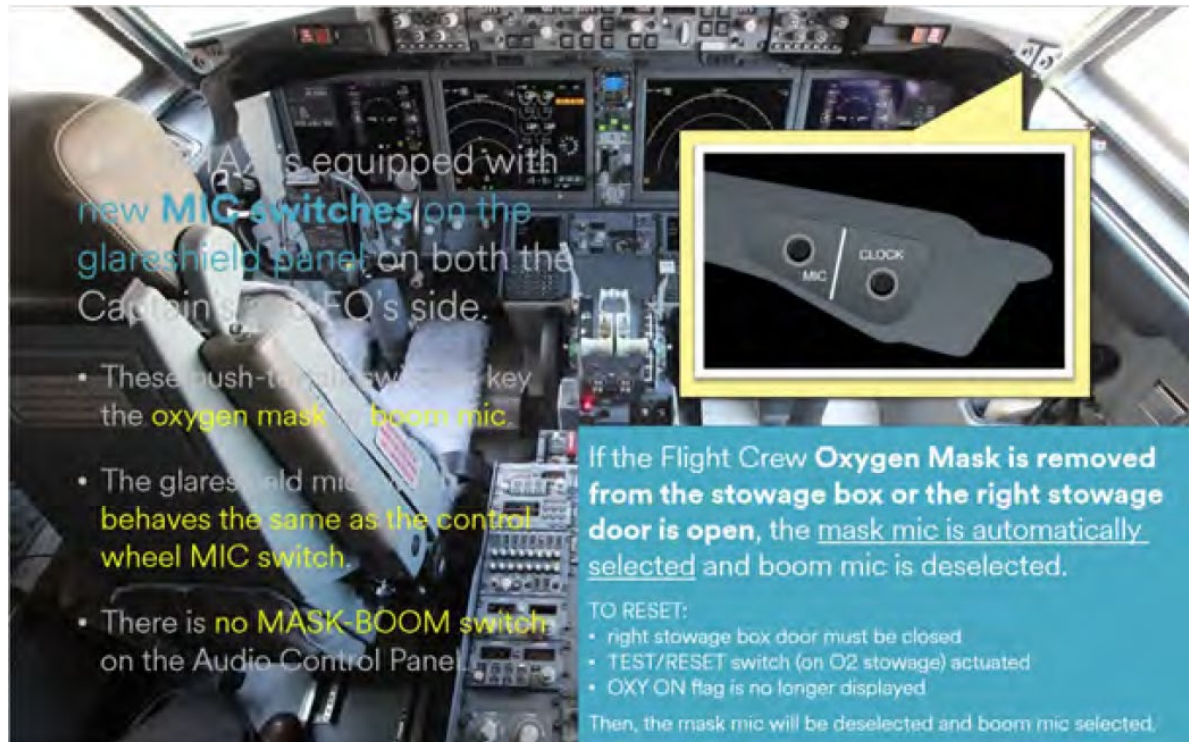
Figure 1. Relevant CBT slide prior to the accident.