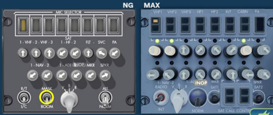
Figure 8. New CQ Quarter 2 CBT slide.

The mask microphone is enabled automatically when the mask is removed from the Stowage Box.