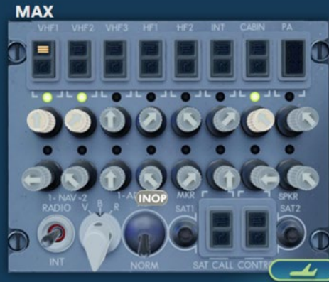
Figure 9. New CQ Quarter 2 CBT slide.