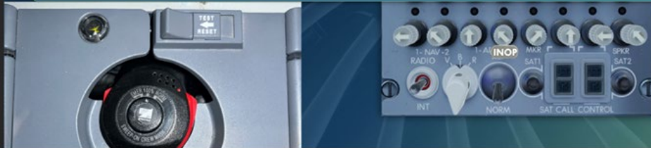
Figure 4. New 737-9 CBT slide.