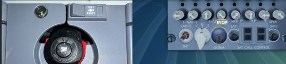
Figure 6. New 737-9 CBT slide.