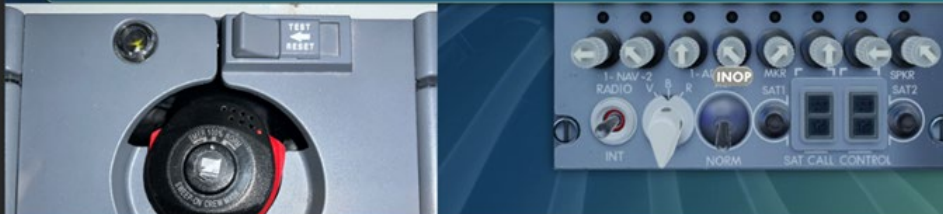
Figure 5. New 737-9 CBT slide.