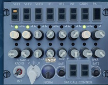
Figure 3. New 737-9 CBT slide.