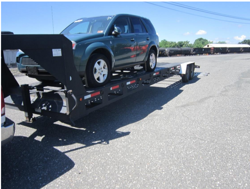
Photo 2. This exemplar trailer is the make, model, year as the trailer involved in the crash that was towed by the accident truck.