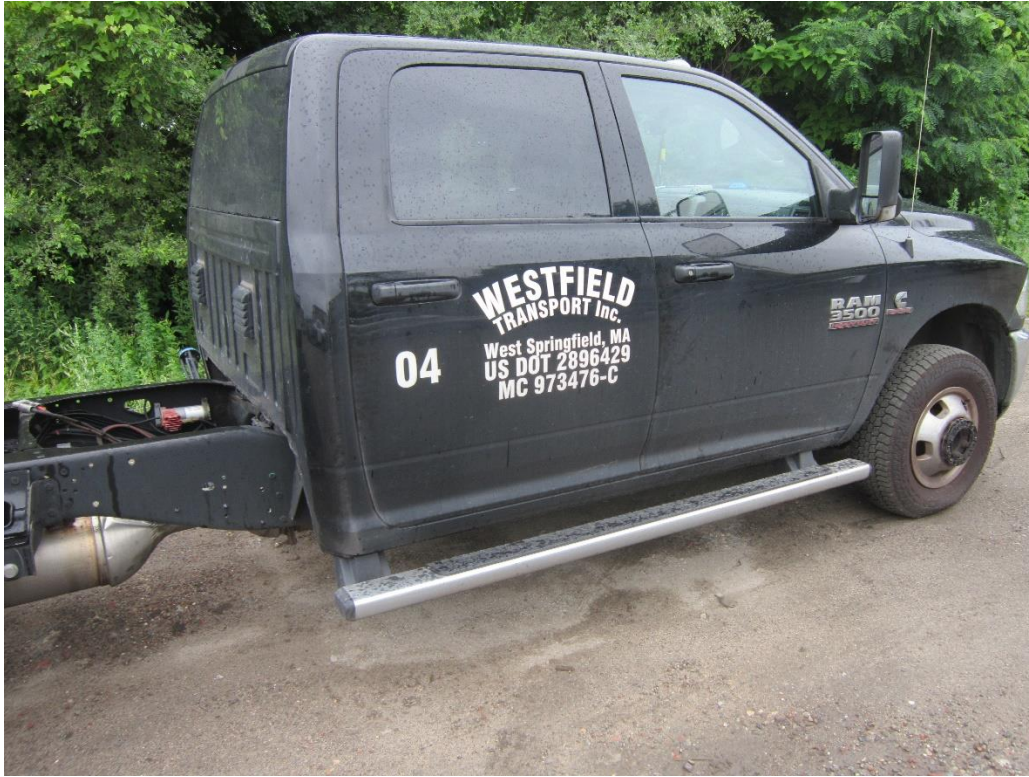
Photo 5. Westfield Transport Vehicle.