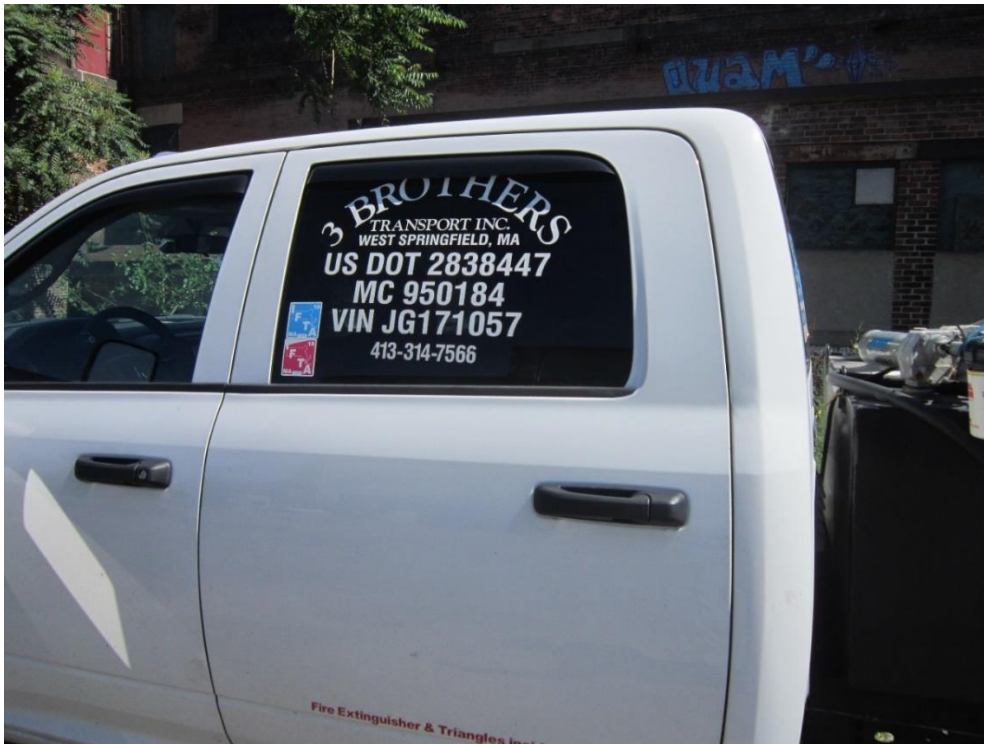
Photo 8. 3 Brothers Tansport Vehicle Parked with Wesfield Transport Vehicles