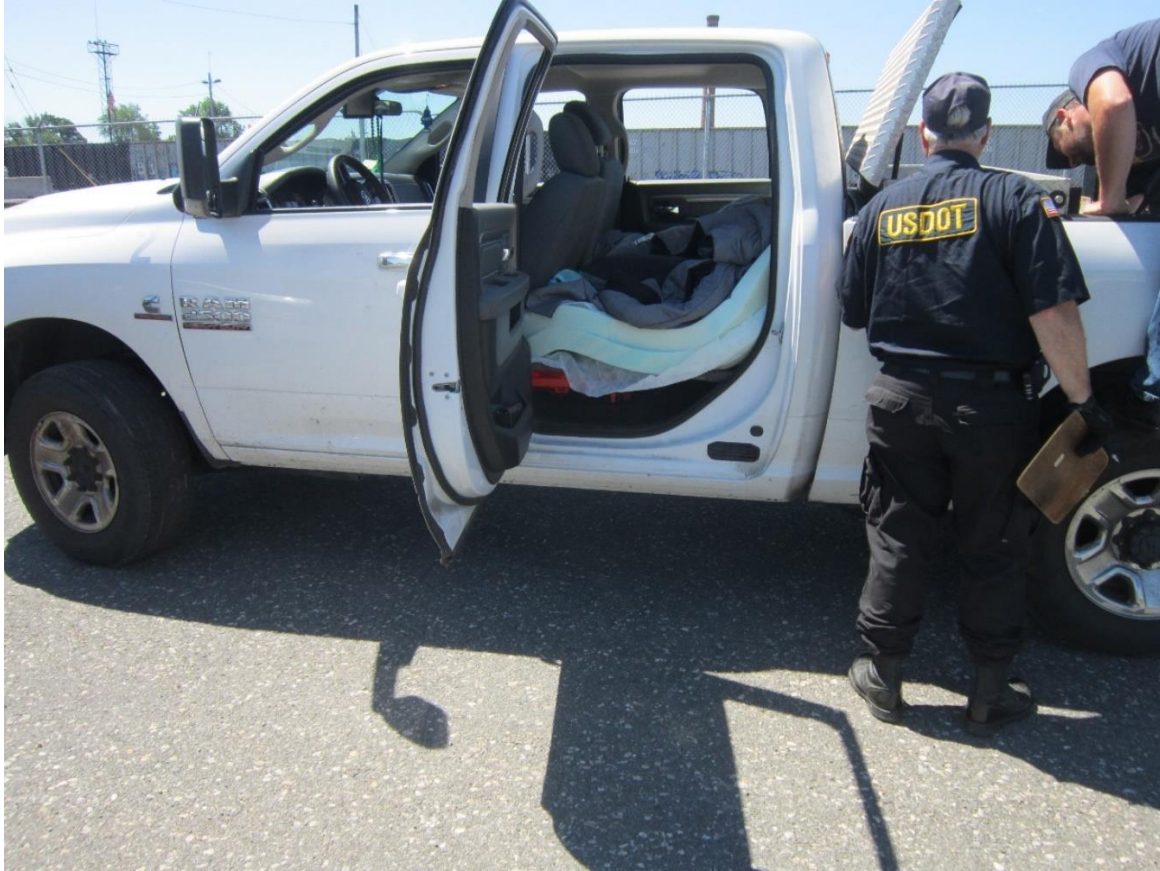
Photo 15. Massachusetts State Police and USDOT conducting an inspection on Westfield Transport Vehicle