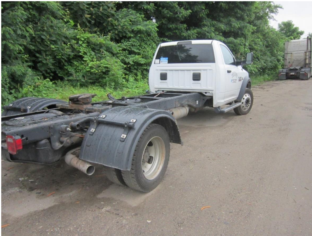
Photo 4. Westfield Transport Vehicle / frame with mounted 5 th Wheel.