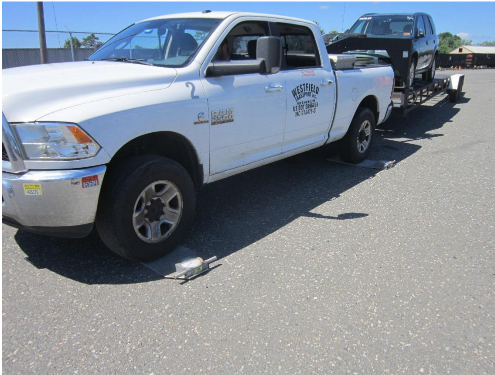
Photo 1. Exemplar Westfield Transport Vehicle. Same, year, make and model as accident vehicle.