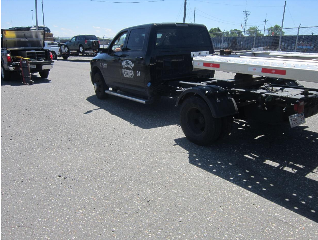
Photo 13. Massachusetts State Police Weighing Westfield Transport Vehicle