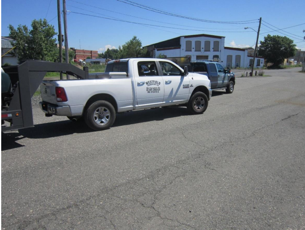
Photo 3. Exemplar Truck and Exemplar Trailer. These vehicles are the same make, model, and years as the combination vehicle involved in this crash.