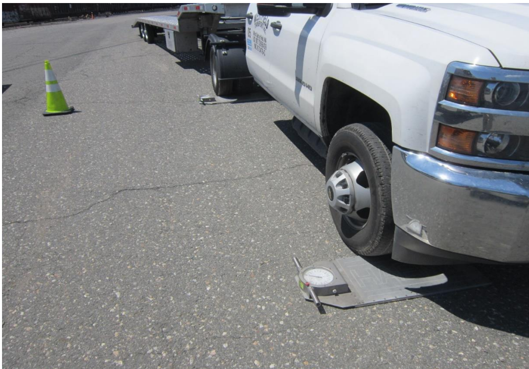
Photo 14. Massachusetts State Police Weighing Westfield Transport Vehicle