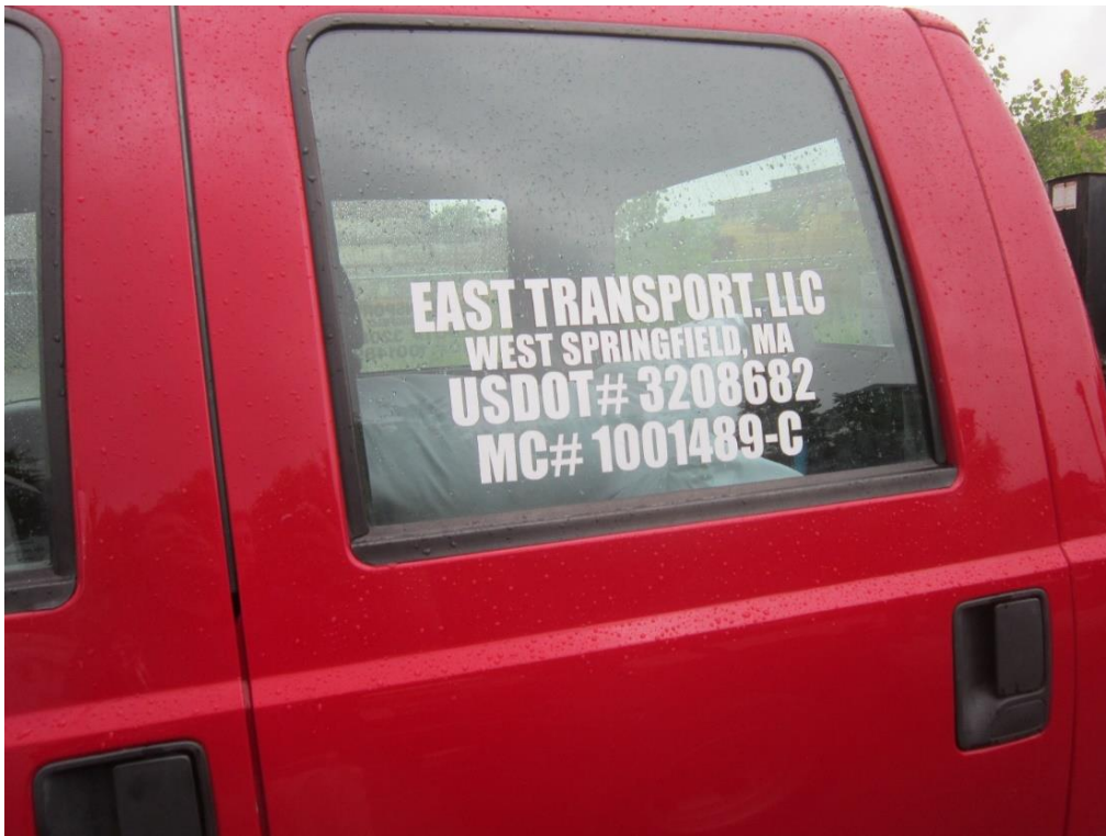
Photo 6. East Transport Vehicle Parked with Westfield Transport Vehicles