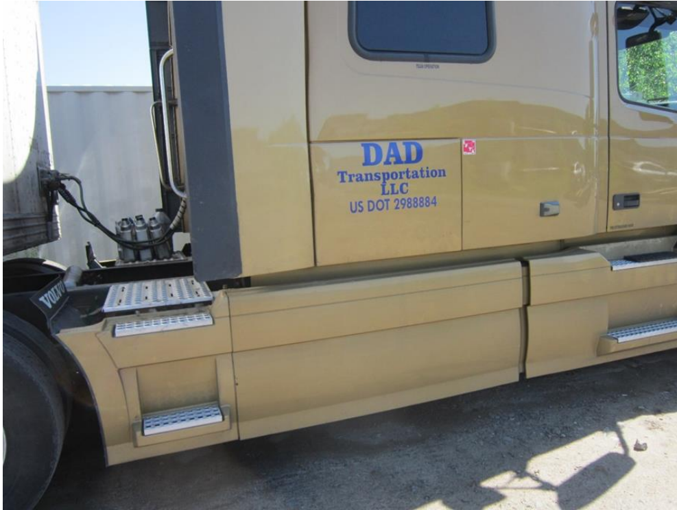
Photo 9. Dad Transportation Vehicle Parked with Westfield Transport Vehicles