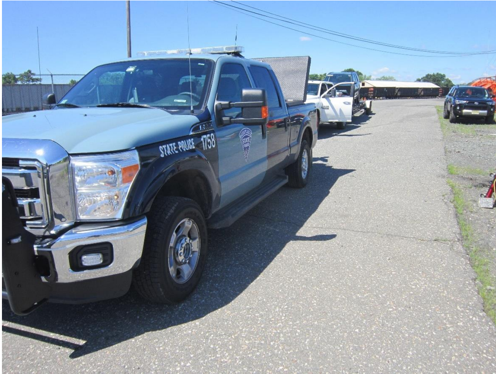
Photo 11. Massachusetts State Police Inspecting Westfield Transport Vehicles