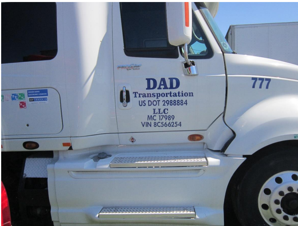
Photo 10. Dad Transportation Vehicle Parked with Westfield Transport Vehicles.