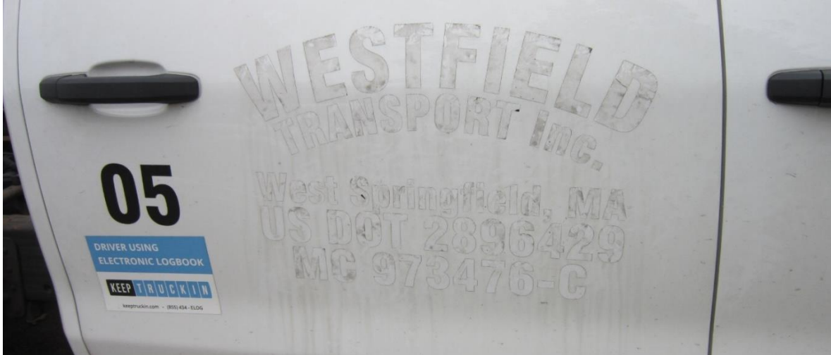
Photo 16. This photo shows Westfield Transport lettering removed from vehicle 3 weeks after the crash.