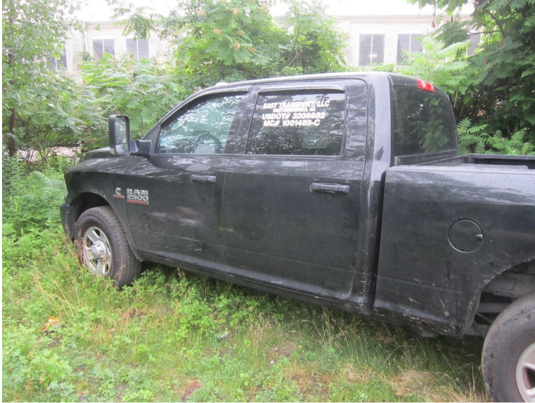
Photo 7. East Transport Vehicle Parked with Westfield Vehicles.