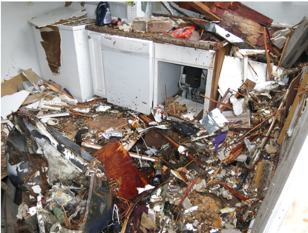
Photograph 3 – Accident site - Interior.