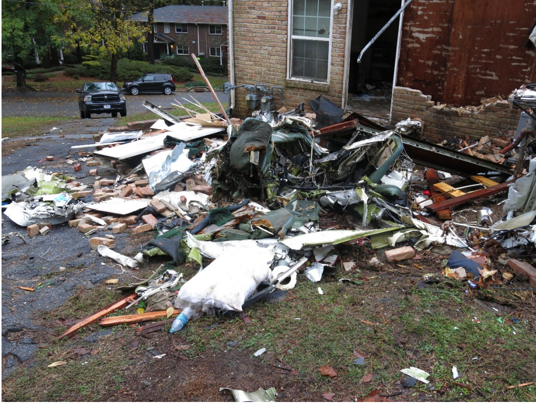
Photograph 2 – Accident site.