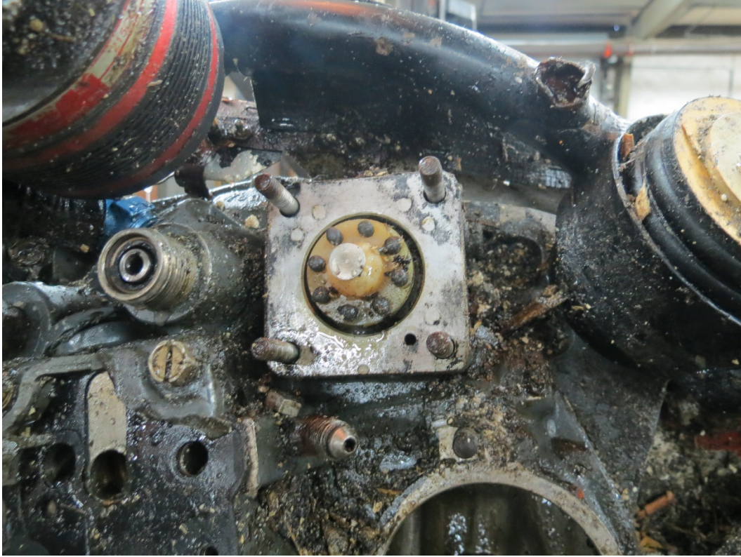
Photograph 10 – Vacuum pump engine mount.