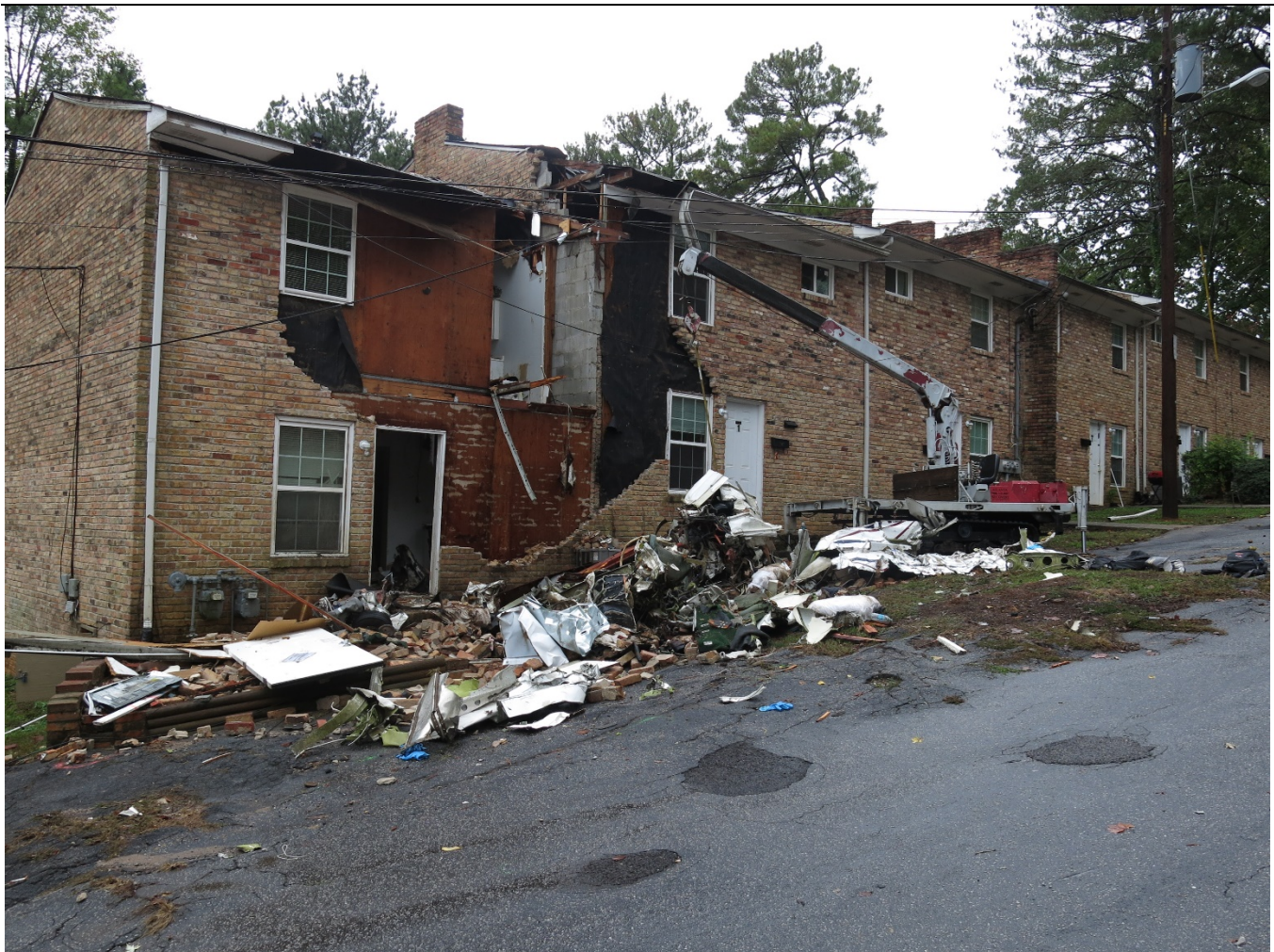
Photograph 1 – Accident site.

Date: October 30, 2019 NTSB Accident Number: ERA20FA021