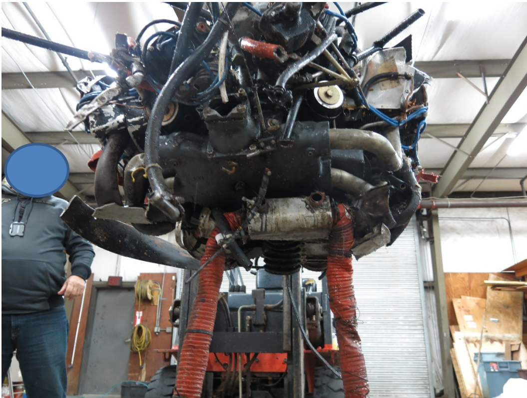
Photograph 7 – Engine, aft under side.