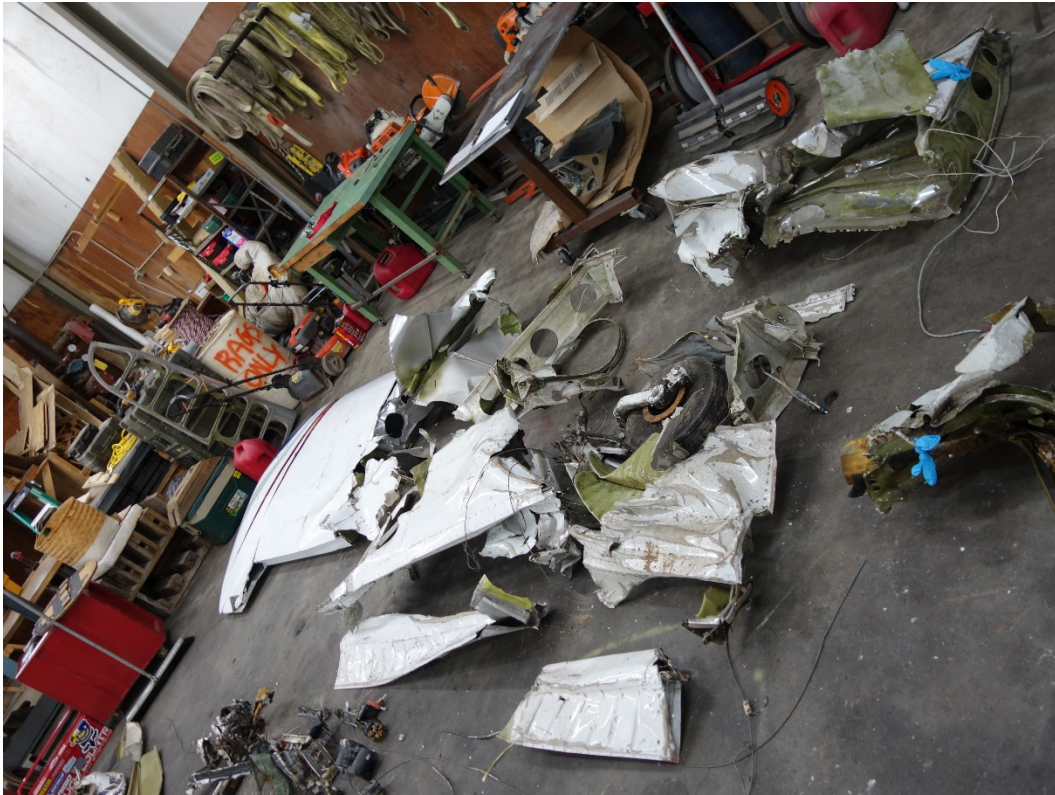
Photograph 12 – Left wing layout.