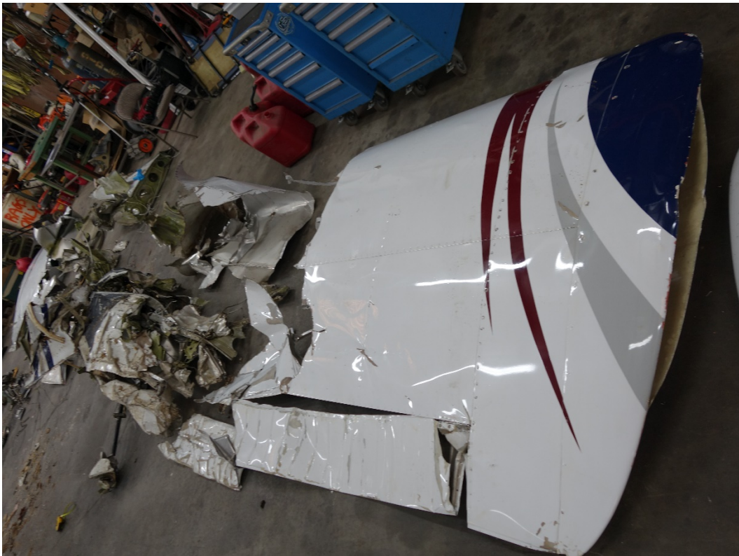
Photograph 13 – Right wing layout.