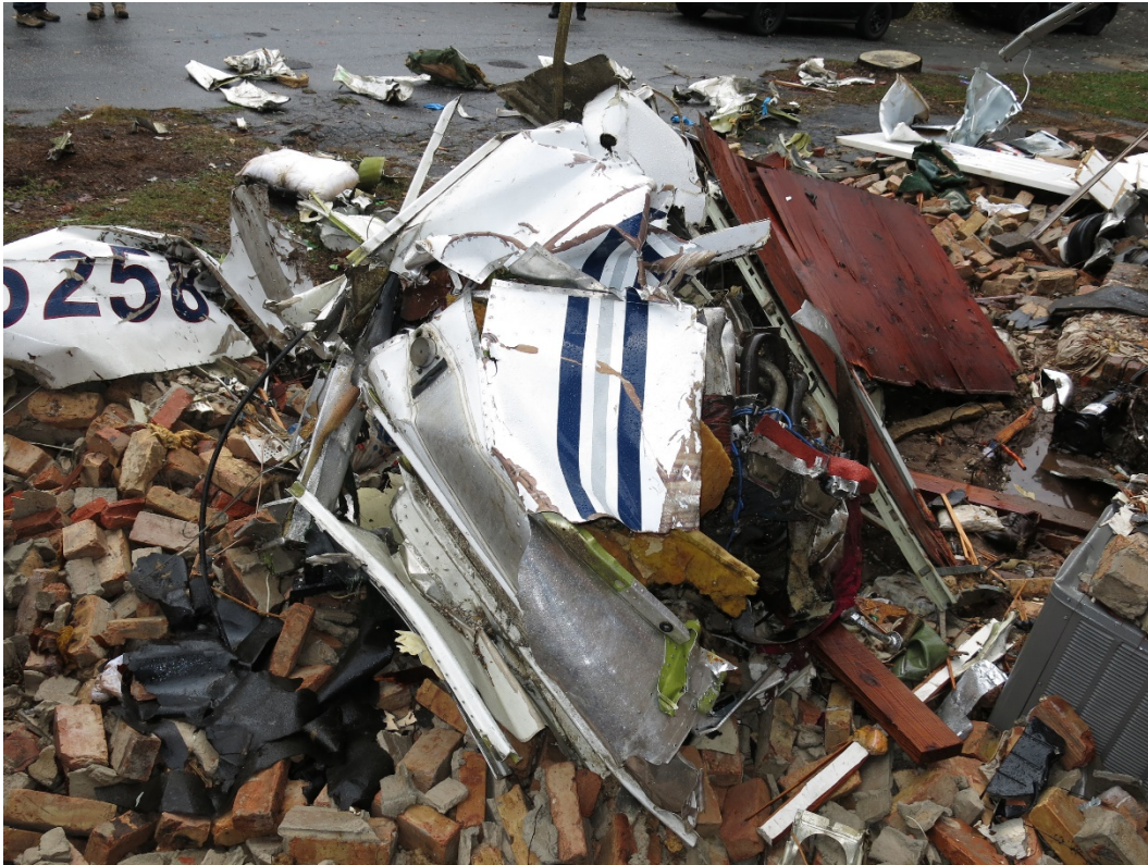
Photograph 4 – Accident site.