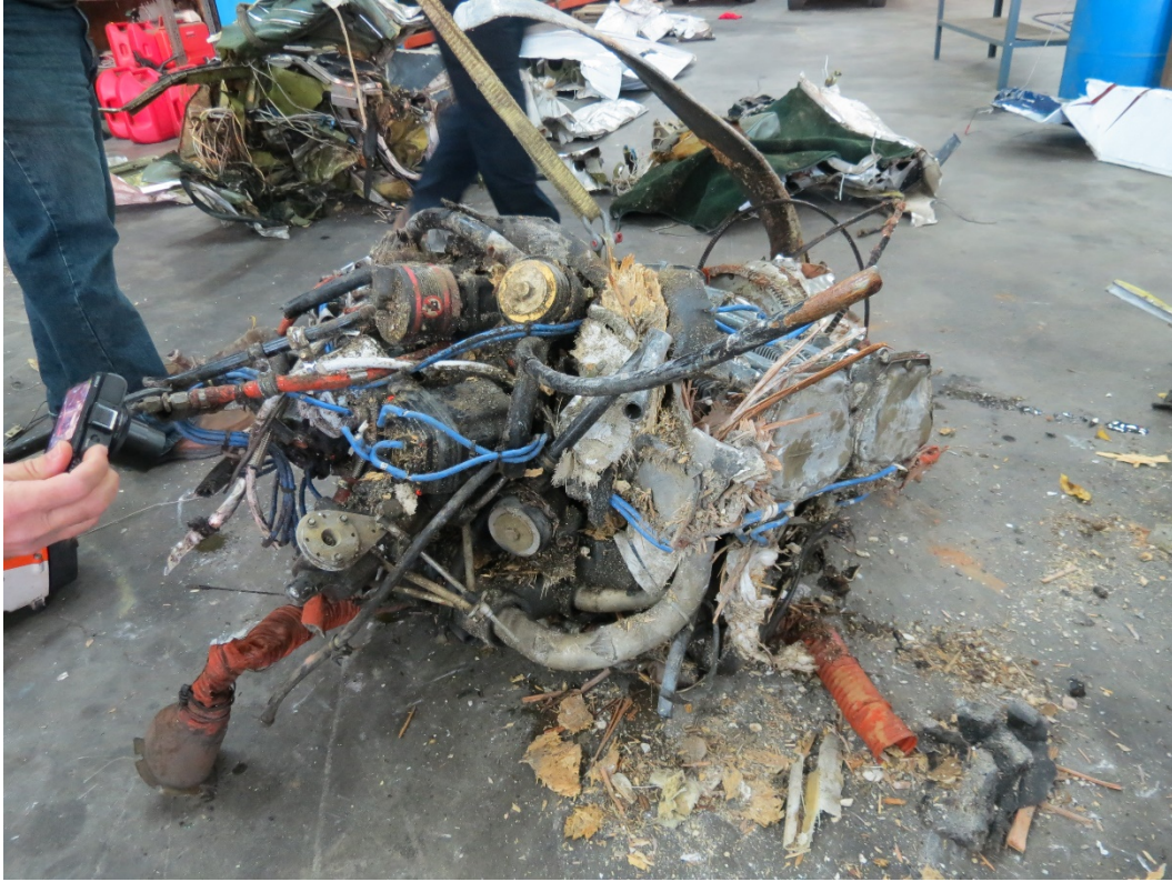
Photograph 8 – Aft right-side engine.