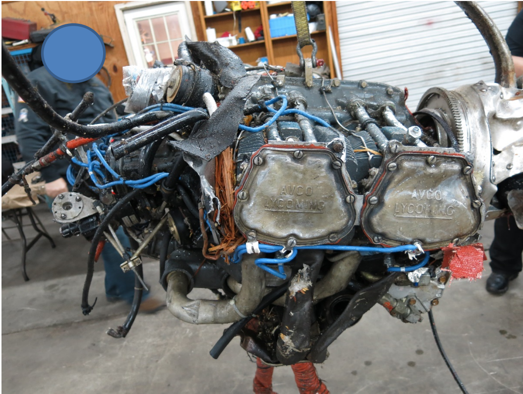
Photograph 6 – Engine, right side.