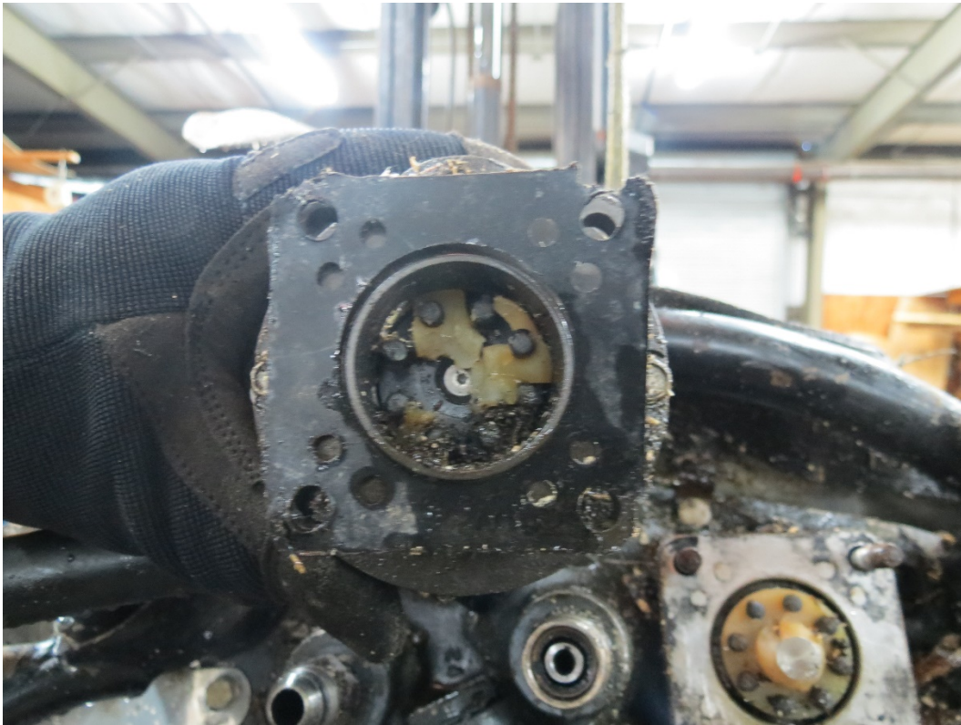
Photograph 9 – Vacuum pump.