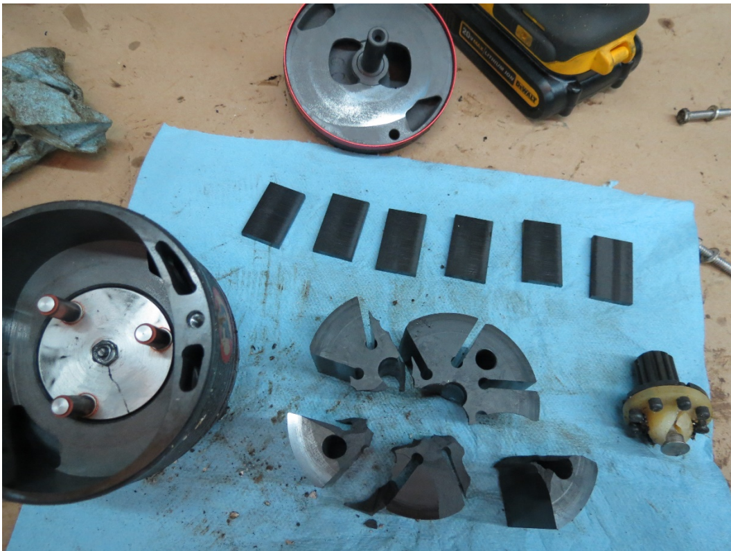
Photograph 11 – Disassembled vacuum pump.