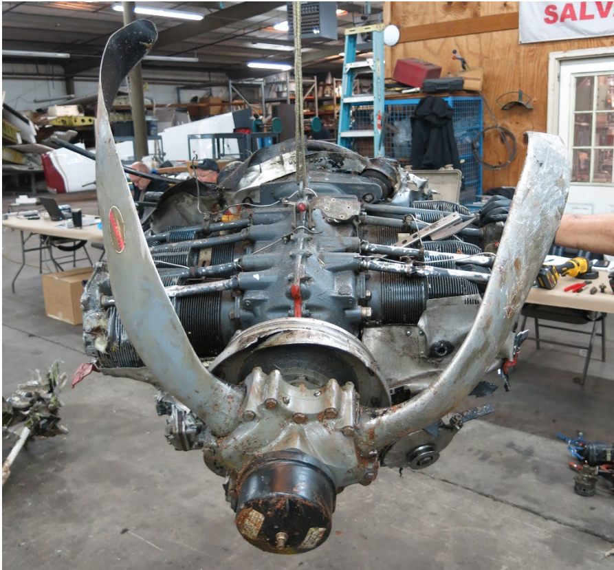
Photograph 7 – Forward engine and propeller.