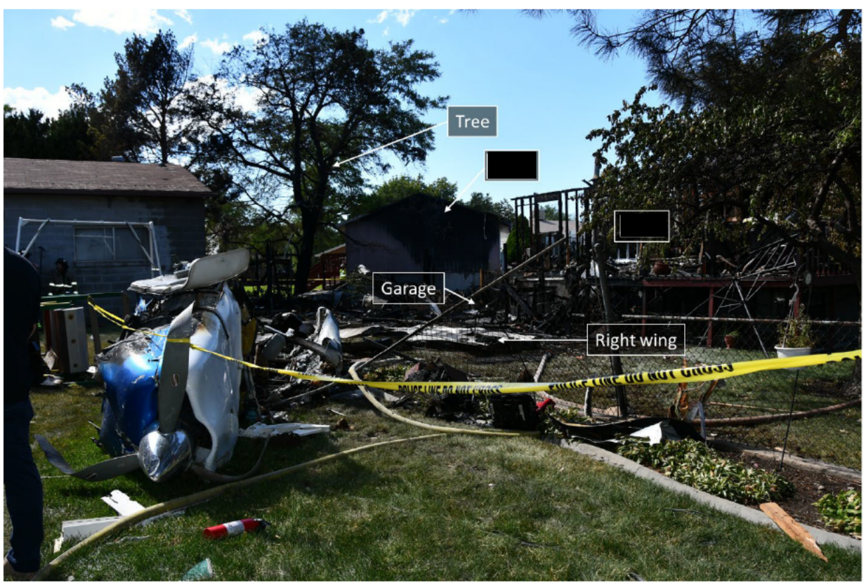
Figure 3. View showing the fuselage in the back yard, and the right wing in the neighboring back yard.