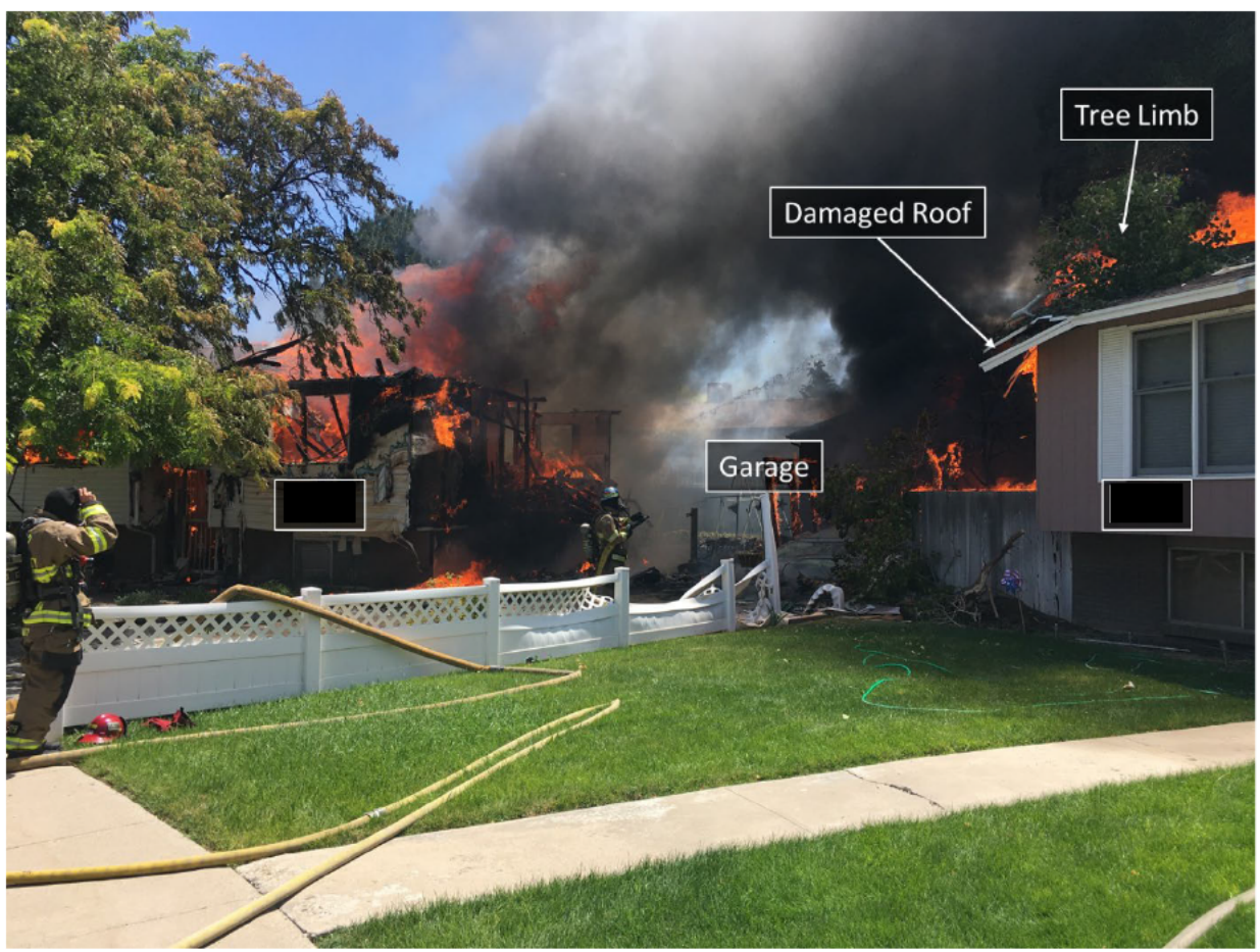
Figure 4. View of the two neighboring houses that were damaged.