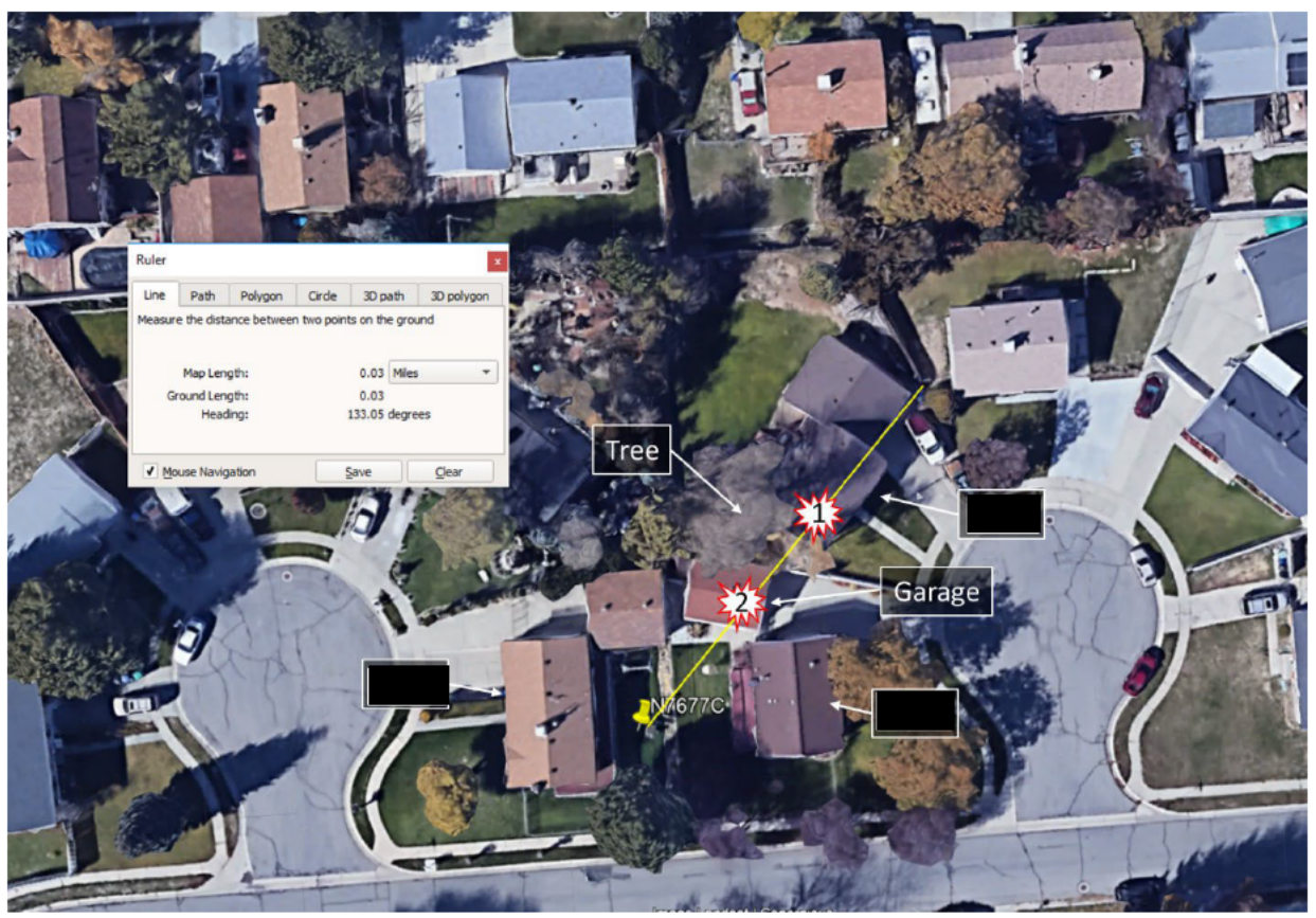
Figure 1. Overhead view showing the first and second points of probable impact.