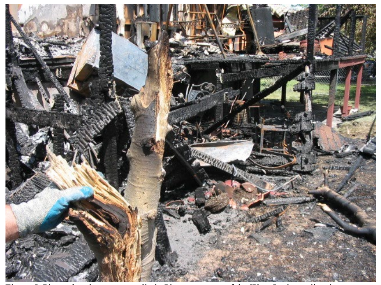
Figure 5. Photo showing a cut tree limb.