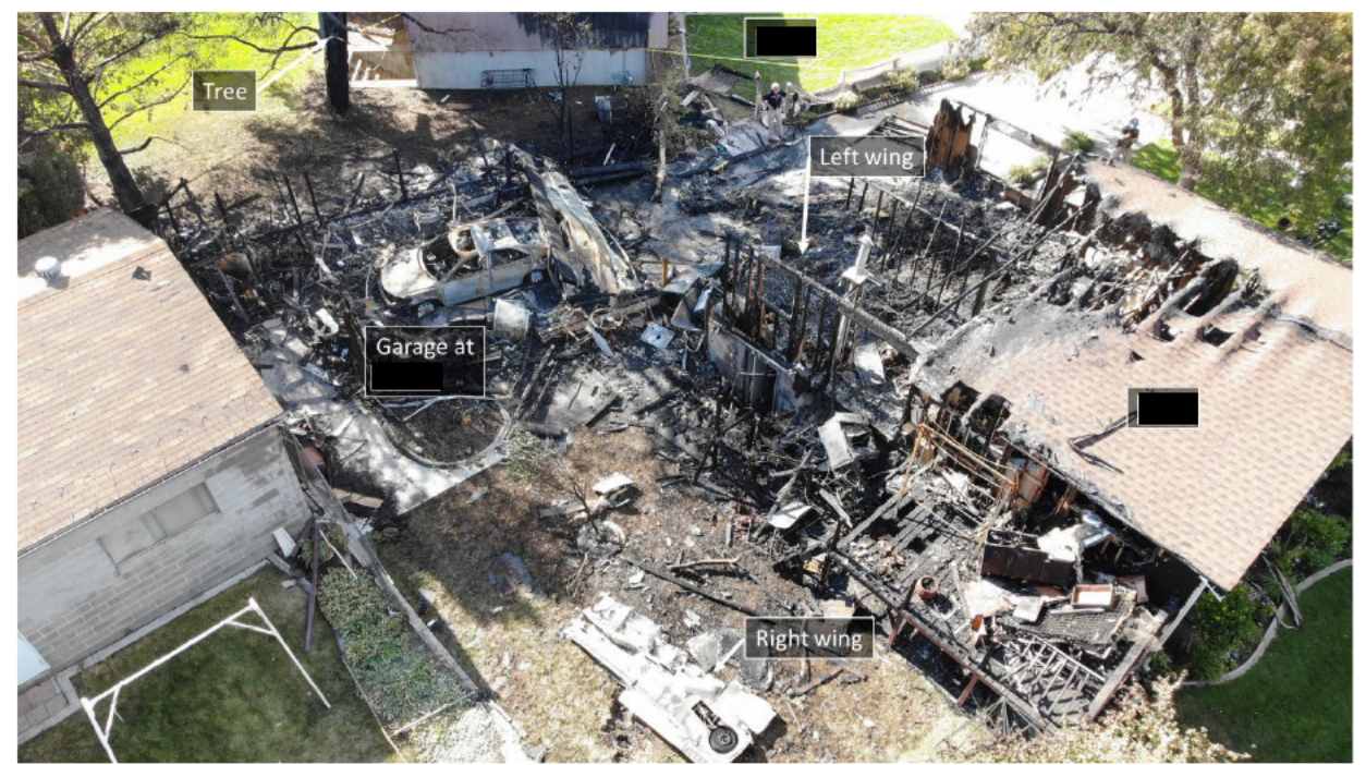
Figure 2. Overhead view showing the left, and right-wing locations.