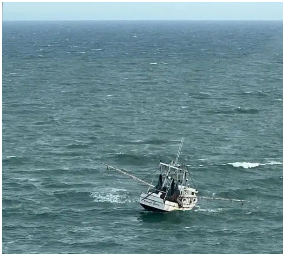
Figure 5. Aerial view of the Carol Jean from the responding Coast Guard helicopter on March 17 before the captain and his friend were rescued.

on March 17. At 1818, the Coast Guard transported the captain and his friend to a local hospital, where they were evaluated and released.