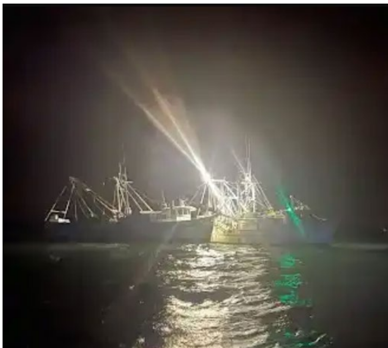
Figure 4. The Carol Jean at anchor with the Having Faith secured by tow line about 2245 on March 16.

Weather forecasts for the evening of March 16 indicated winds 5 to 10 knots, with seas from 1 to 2 feet. The captain stated that, although he attempted to keep the Having Faith secured to the Carol Jean , he could not, and it “ended up floating away.” Throughout the night and into the early morning hours of March 17, the Carol Jean dragged anchor; according to the vessel’s automatic identification system (AIS) data, at 0713, the Carol Jean was about 7.5 miles northwest of where it had originally anchored.