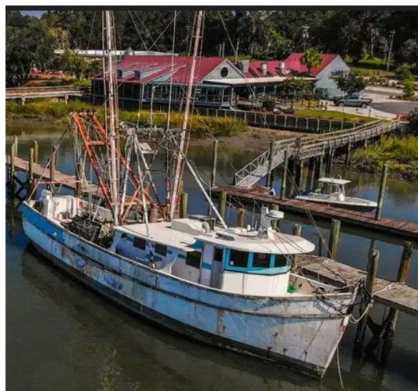
Figure 3. Commercial fishing vessel Having Faith precasualty.

On the morning of March 16, the captain of the Carol Jean began preparations to tow the Having Faith from Port Royal to Valona, with the assistance of a friend. The captain found a 100- to 150-foot-long rope in a forward compartment on the Having Faith that he used as the tow line. The rope had been stored on the Having Faith for an unknown period of time. The captain stated that he believed it was an anchor line, and since it was "big," he and his friend thought it would suffice (he did not know what material comprised the rope or the rope's diameter). The captain and his friend connected the tow line to the aft boom on the Carol Jean and then passed the other end through the Having Faith 's anchor chute (chain pipe), into an open hatch, and tied it around two fuel tanks located within the forward compartment.