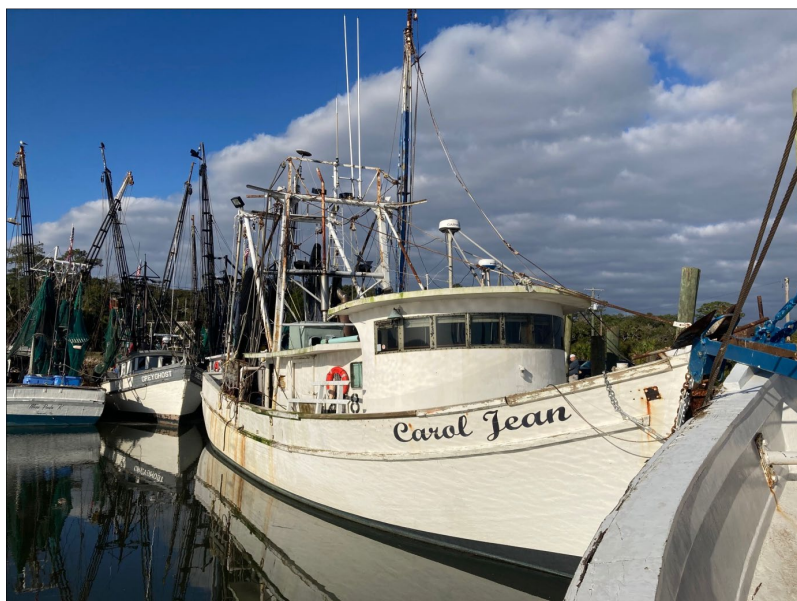
Figure 1. Commercial fishing vessel Carol Jean precasualty.

On March 21, 2023, while anchored with no one on board, the commercial fishing vessel Carol Jean flooded and sank in the Atlantic Ocean near Tybee Island, Georgia. 1 After the vessel's emergency position indicating radio beacon activated at 1903, the US Coast Guard responded and found a debris field where the beacon's signal originated. There was no pollution reported. The loss of the Carol Jean was estimated at $250,000.