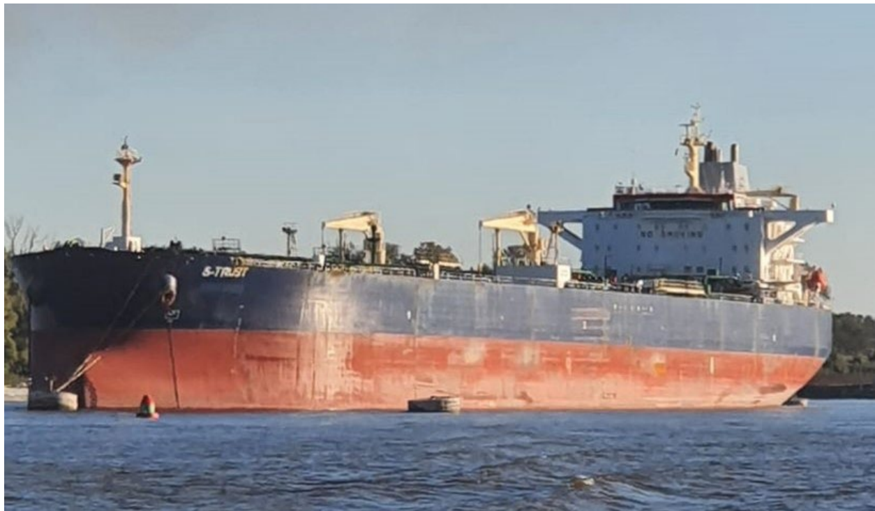
Figure 1. S-Trust at anchor following the casualty.

On November 13, 2022, about 1530 local time, a fire started on the bridge of the oil tanker S-Trust while the vessel was docked at the Genesis Port Allen Terminal in Baton Rouge, Louisiana. 1 Fire teams from the vessel's crew extinguished the fire about 1550. There were no injuries, and no pollution was reported. The damage to the vessel was estimated at $3 million.