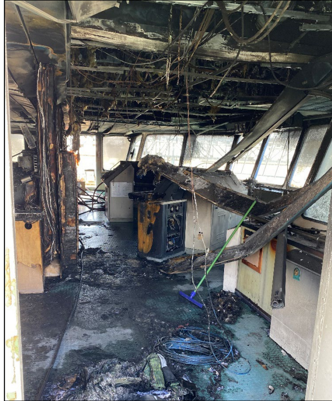
Figure 3. The damage to the bridge.

At 1527:54 local time, the footage showed an orange flash immediately followed by a puff of smoke by the communications table. Following the initial flash, the video showed smoke rising up and increasing in volume and thickness.