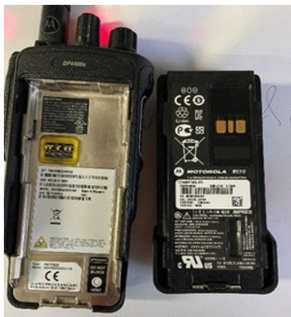
Figure 6. A Motorola DP4400e radio and lithium-ion battery used on the bridge of the S-Trust .

A postcasualty battery inventory identified that the vessel carried twenty-seven 7.4-volt batteries for the radios: 14 of the batteries had lithium-ion cells, and 13 of the batteries had nickel-metal hydride cells. The vessel also had 16 battery chargers: 8 for lithium-ion batteries and 8 for nickel-metal hydride batteries; 6 of the lithium-ion chargers were Motorola