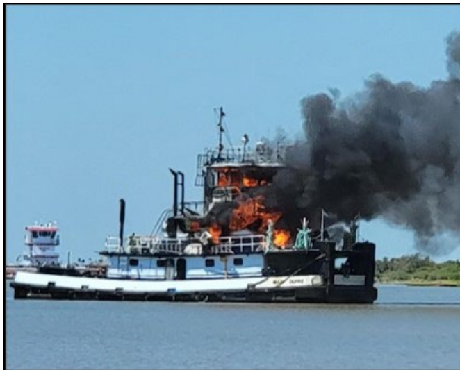
Figure 5. Fire aboard Mary Dupre minutes after crewmembers abandoned the vessel.

Several nearby towing vessels arrived on scene and applied water to the Mary Dupre . At 1525, a salvage company vessel arrived and reported the fire was “smoldering.” A team from the salvage vessel boarded the Mary Dupre and used a fire hose from a towboat that was alongside the Mary Dupre to extinguish the fire. About 1900, another towing vessel began towing the Mary Dupre to a nearby shipyard, arriving about 2200.