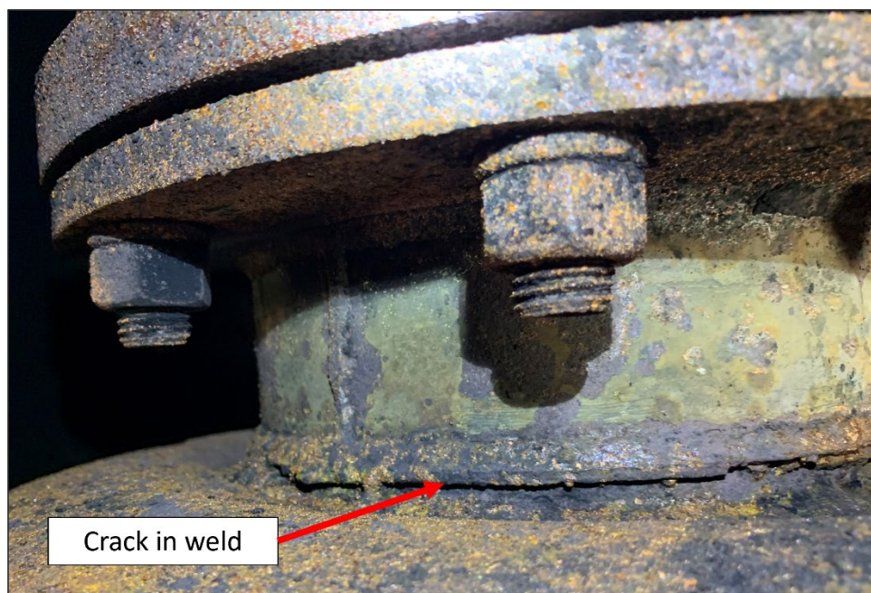
Figure 9. Crack in weld below the upper (outlet) flange of the starboard muffler aboard the Mary Dupre .

After the casualty, investigators found cracks in the welds on the upper section of the starboard engine muffler (inside the starboard stack) under the outlet flange around more than half of its circumference. Additionally, an exhaust blanket was found disconnected on the inboard side of the muffler in the direction of the pilot's stateroom, exposing the bare steel of the muffler towards the common steel bulkhead whose inboard side had wooden framing with attached paneling bolted directly to it.