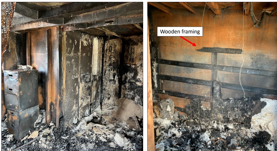
Figure 7. Pilot's stateroom adjacent to the starboard stack where the fire started ( left ), and charred wooden framing attached to steel bulkhead ( right ).

There was little to no fire and heat damage observed on the aft section of the main deck. In the engine room below the main deck, there was no damage to the main engines, generators, or other machinery. In both the wheelhouse and on the second deck, all wood framing, furniture, paneling, and joinery, as well as all paint and combustibles, were destroyed, completely consumed by fire and heat. On the main deck, combustible materials in the galley and crew quarters were partially burned. Due to the severity of the damage, the vessel was declared a constructive total loss and scrapped in October 2022.