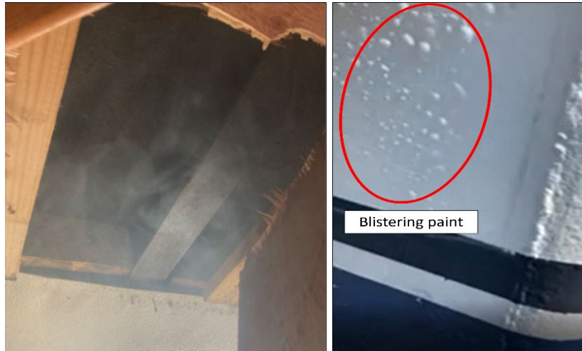
Figure 4. Smoke in area of the removed overhead panel in the pilot's stateroom ( left ). Blistering white paint on steel bulkhead of starboard stack during the fire ( right ).

The captain stated he shut down the starboard engine and generator about this time but could not recall if he shut down the port engine. Crewmembers started the fire pump and began cooling the exterior surface of the starboard stack using fire hoses. The captain also notified nearby vessels, the vessel's operating company, and the US Coast Guard of the emergency.