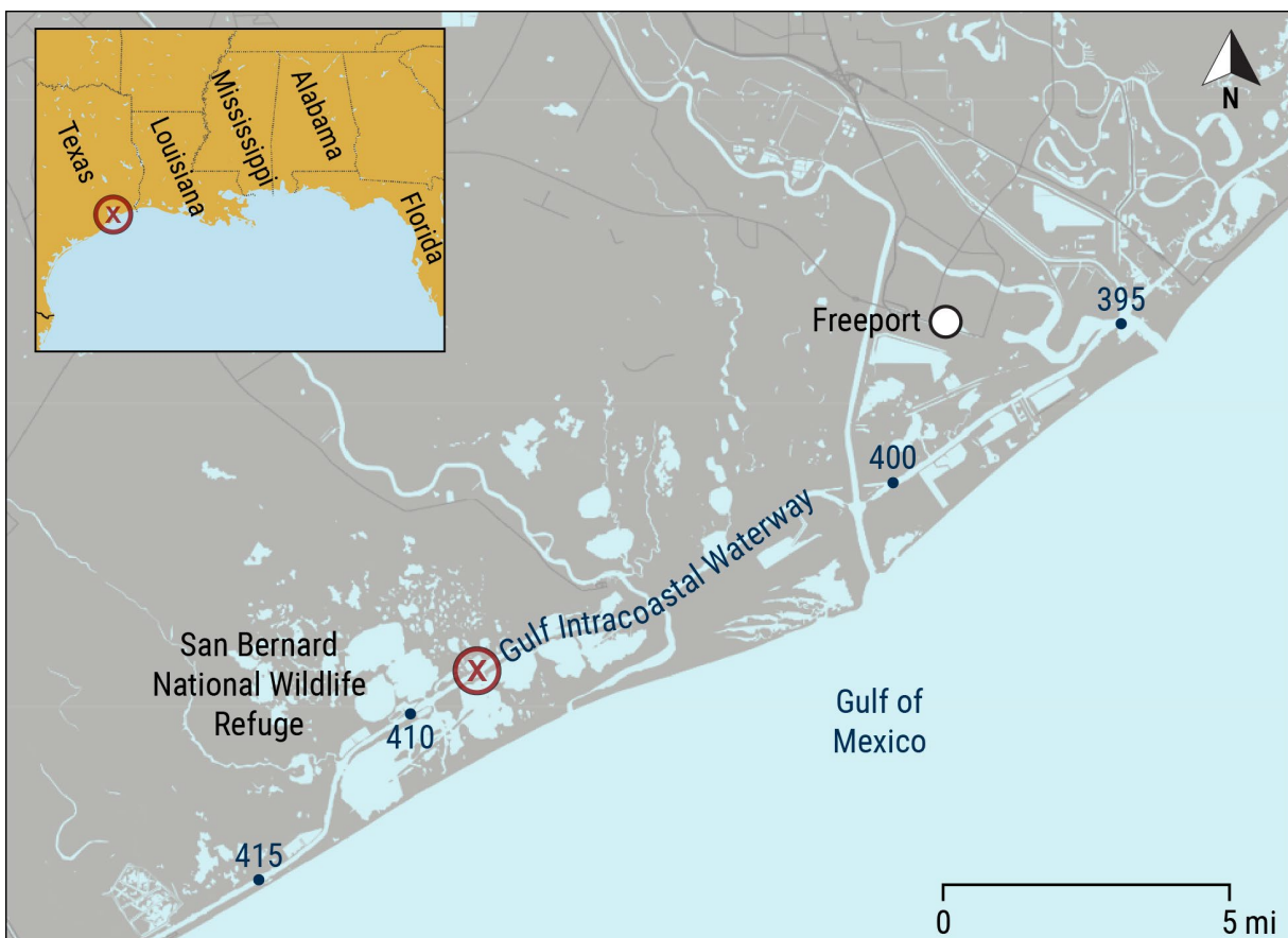
Figure 2. Area where the fire aboard the Mary Dupre occurred, as indicated by a red X.