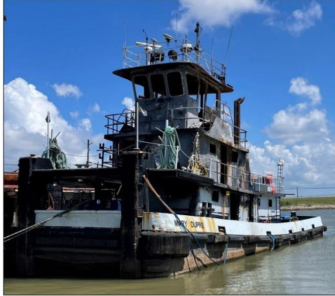
Figure 6. The Mary Dupre after the fire.

There was little to no fire and heat damage observed on the aft section of the main deck. In the engine room below the main deck, there was no damage to the main engines, generators, or other machinery. In both the wheelhouse and on the second deck, all wood framing, furniture, paneling, and joinery, as well as all paint and combustibles, were destroyed, completely consumed by fire and heat. On the main deck, combustible materials in the galley and crew quarters were partially burned. Due to the severity of the damage, the vessel was declared a constructive total loss and scrapped in October 2022.