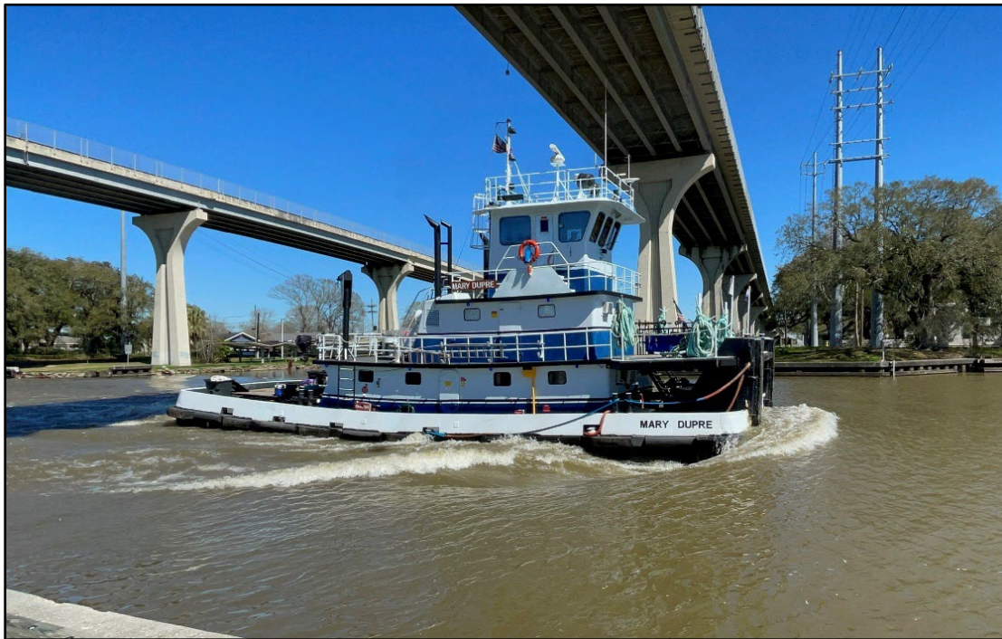
Figure 1. Mary Dupre underway before the fire.

On June 26, 2022, about 0930 local time, a fire broke out in a stateroom on board the towing vessel Mary Dupre , which was pushing one barge of bio-diesel fuel (pyrolysis fuel oil) on the Gulf Intracoastal Waterway near Freeport, Texas. 1 Nearby Good Samaritan towing vessels retrieved the barge from the Mary Dupre , extinguished the fire, and evacuated the four crewmembers. There were no injuries, and no pollution was reported. The towing vessel was deemed a total constructive loss estimated at $1 million.