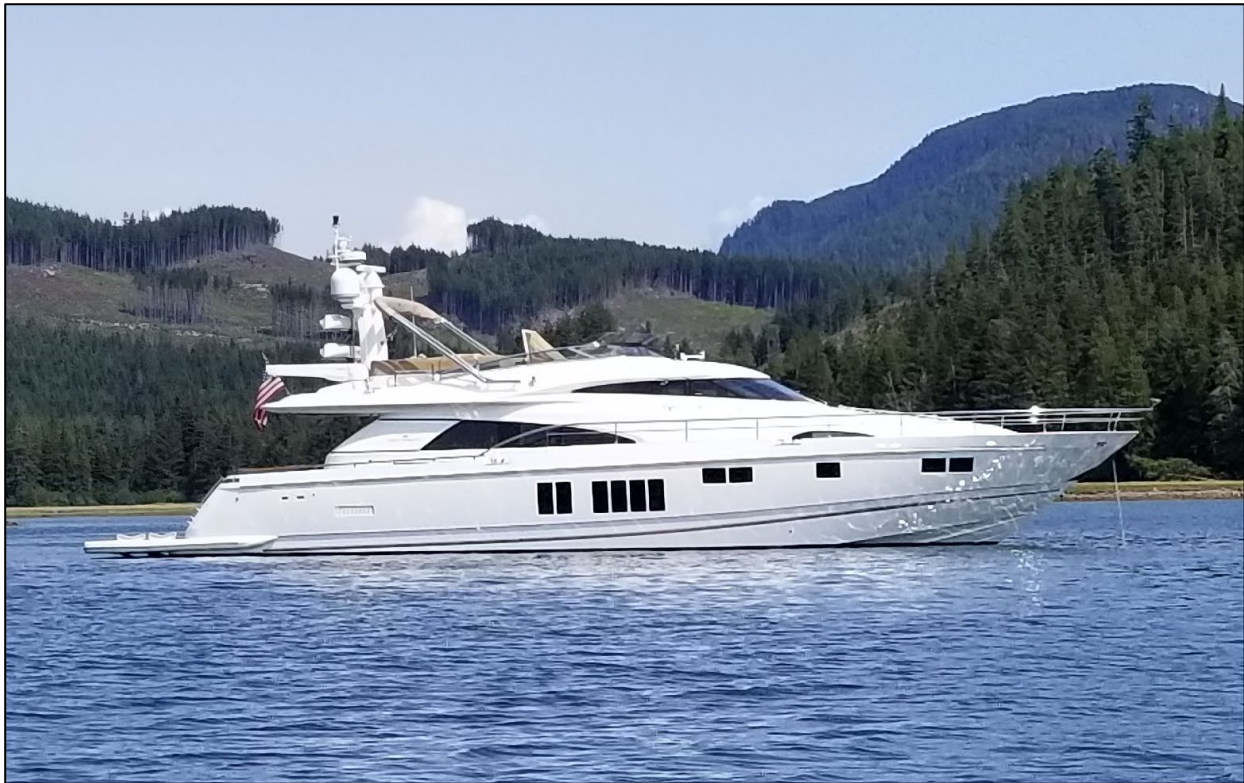
Figure 1. Recreational yacht Pegasus before the casualty.

At 0204 local time on July 15, 2022, the 79.9-foot-long yacht Pegasus caught fire while moored at the Peninsula Yacht Basin in Gig Harbor, Washington. 1 No persons were on board, and the fire burned for about an hour before it was reported. By the time firefighters arrived, the fire had engulfed the aft section of the yacht and the flames could not be completely extinguished. The fire was eventually doused when the vessel sank by its stern at its berth. The Pegasus was a total loss, estimated at $1.5 million. A vessel docked nearby also suffered minor damage.