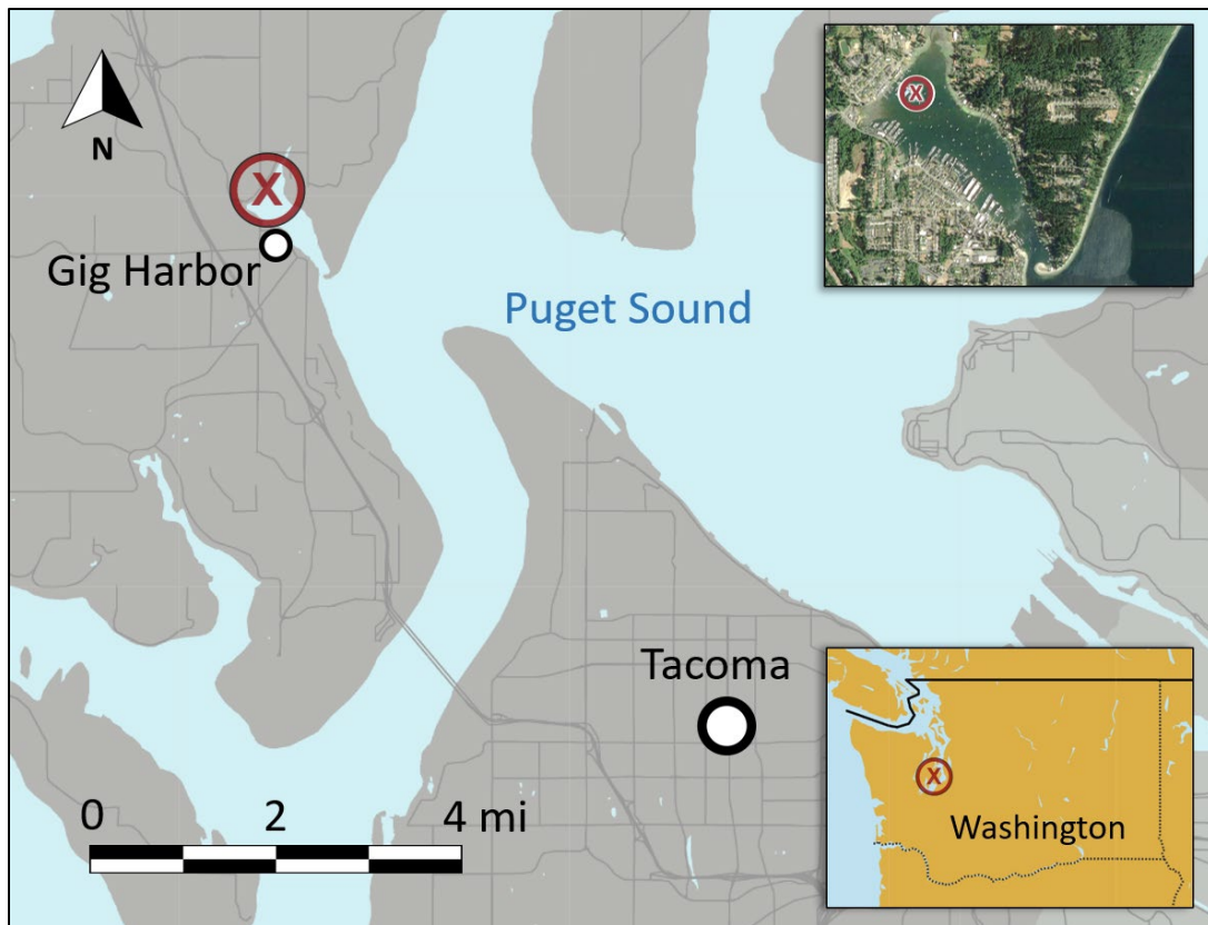
Figure 2. Location of the Pegasus fire, as indicated by a red X.