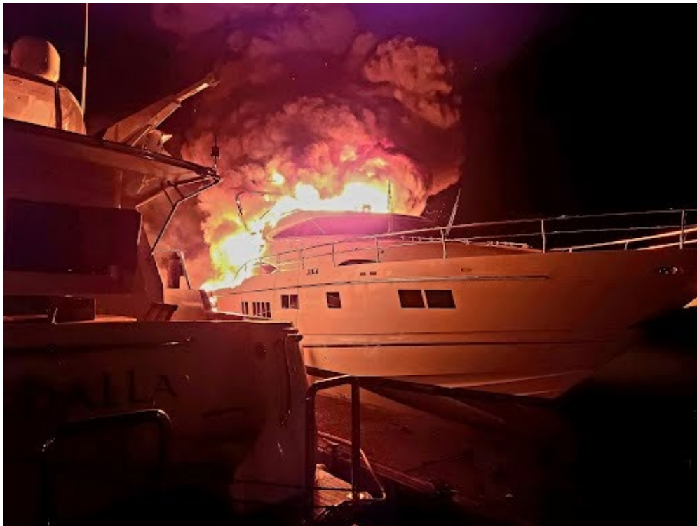
Figure 4. Yacht Pegasus fire at 0322 local time, just before the arrival of firefighters at the vessel's berth.

Firefighters knocked down the flames, but the fire was persistent and continued to flare up. At 0414, the stern of the Pegasus sank with the bow rising out of the water. The bow then slowly settled as the vessel continued to take on water. The last of the fire was extinguished at 0431, when the main deck cabin was inundated with seawater.