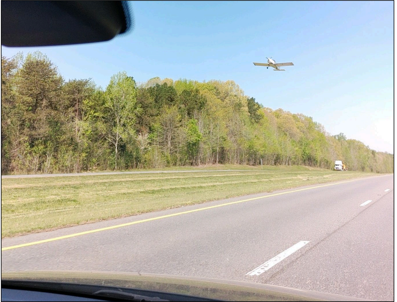
Figure 2: Additional photograph provided by the witness.