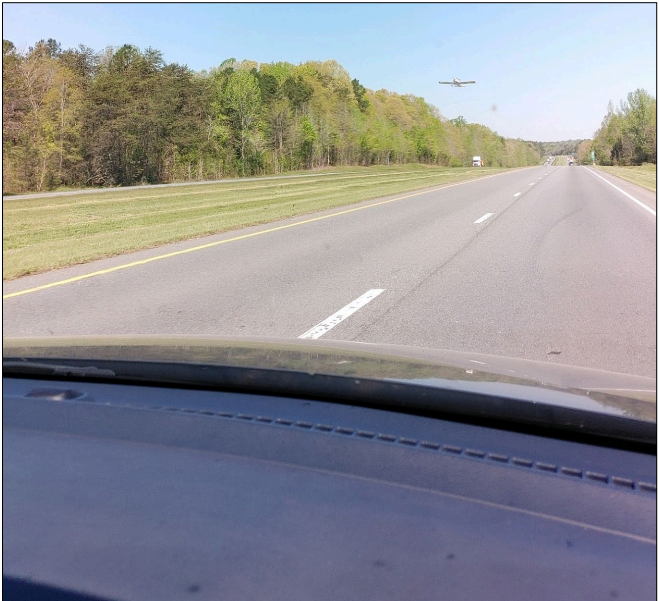
Figure 1: Photograph provided by the witness.