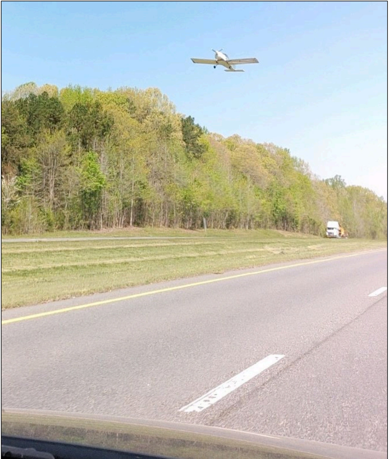
Figure 3: Final and third photograph provided by the witness.